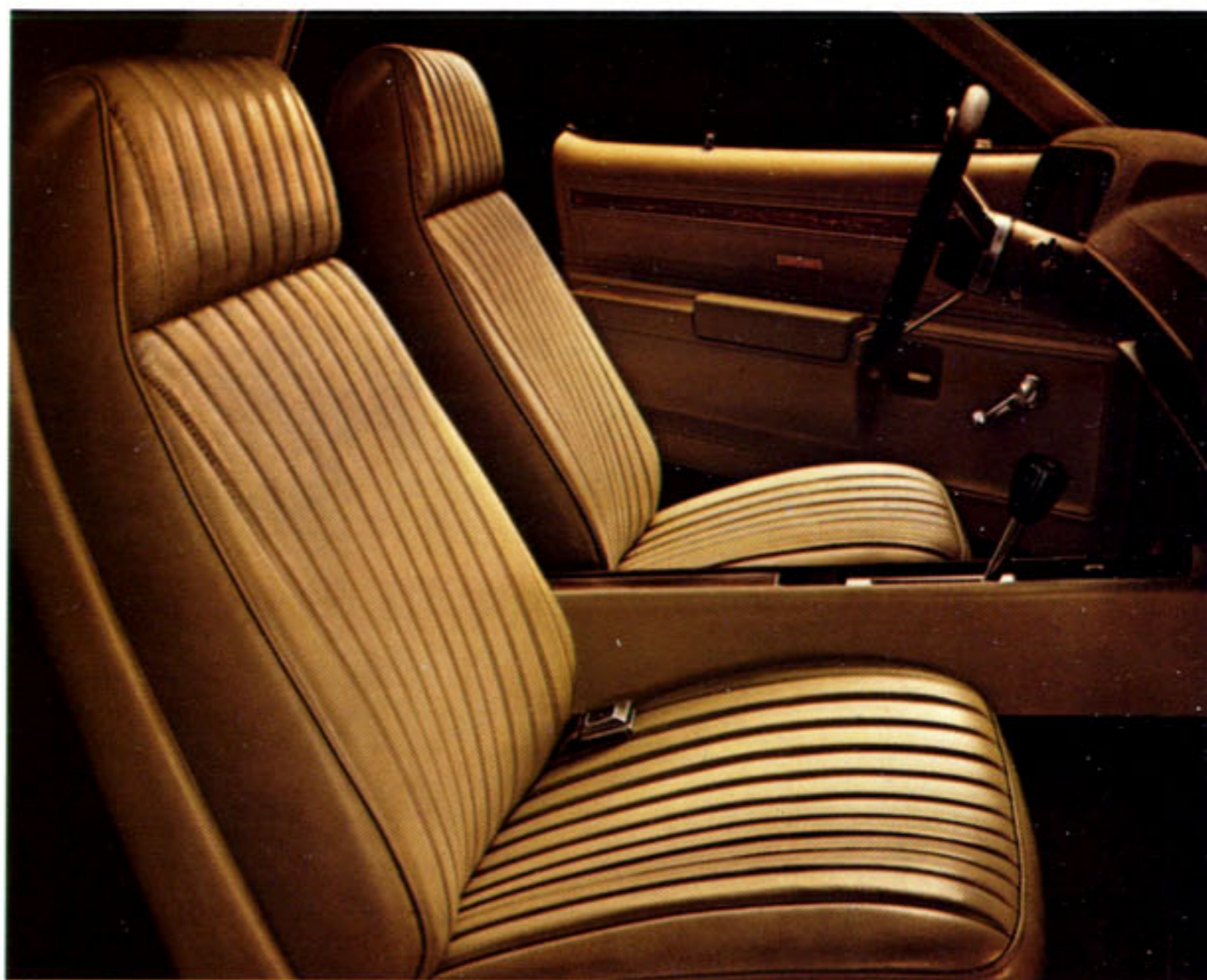
Available Morrokide upholstered bucket seats. Shown in chamois—also available in blue, white, saddle, black and burgundy.

and buzzer). Two front-seat head restraints. Energy-absorbing steering column. Passenger-guard door locks with forward-mounted lock buttons. Safety door latches and hinges. Folding seat-back latches. Energy-absorbing padded instrument panel and front seat-back tops. Contoured windshield header. Thick laminate windshield. Padded sun visors. Safety armrests. Safety steering wheel. Cargo-Guard. Side-guard Beam. Contoured full roof inner panel.