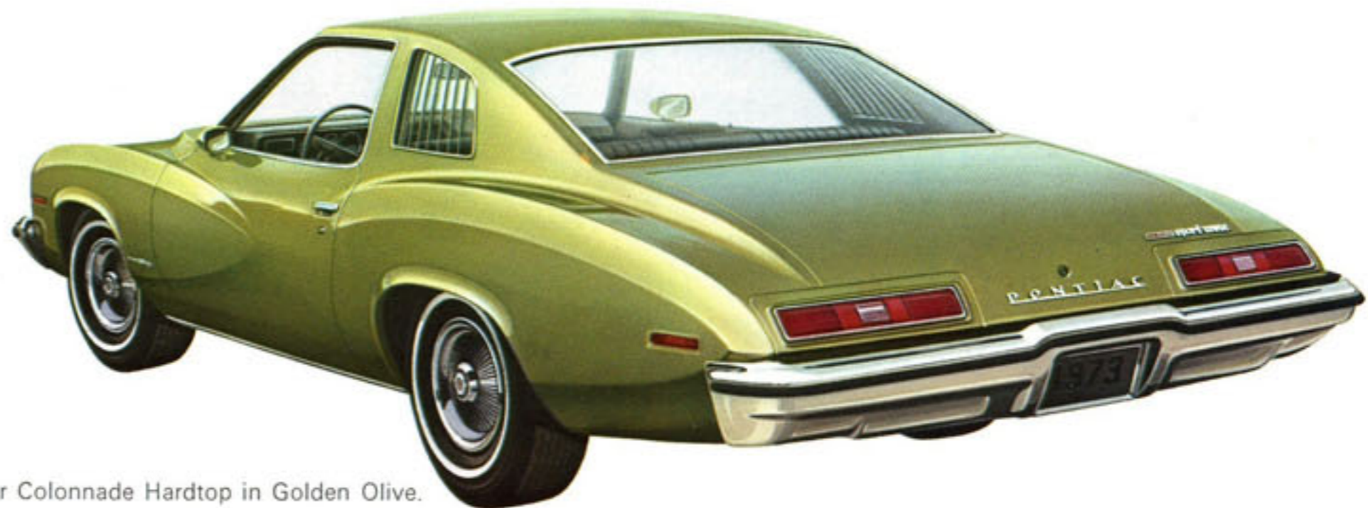
LeMans Sport Coupe 2-Door Colonnade Hardtop in Golden Olive.

Affordable. And equipped any way you want it. That's what we think a sporty looking car should be. If you agree, there's a 1973 LeMans Sport Coupe waiting.