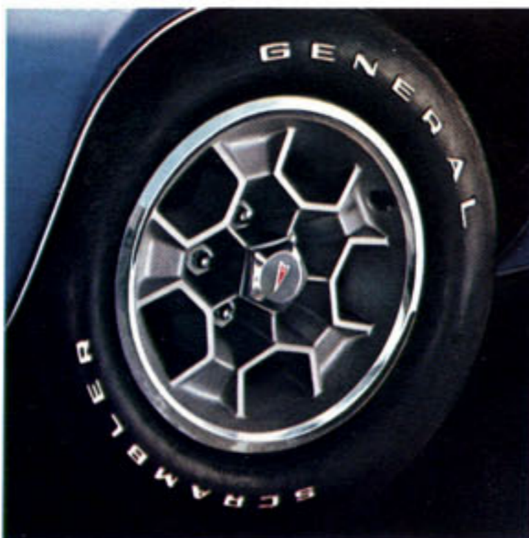
Available Honeycomb wheels.

Seat belts with pushbutton buckles for all passenger positions. Single-buckle seat and shoulder belts for driver and right front passenger (with reminder light