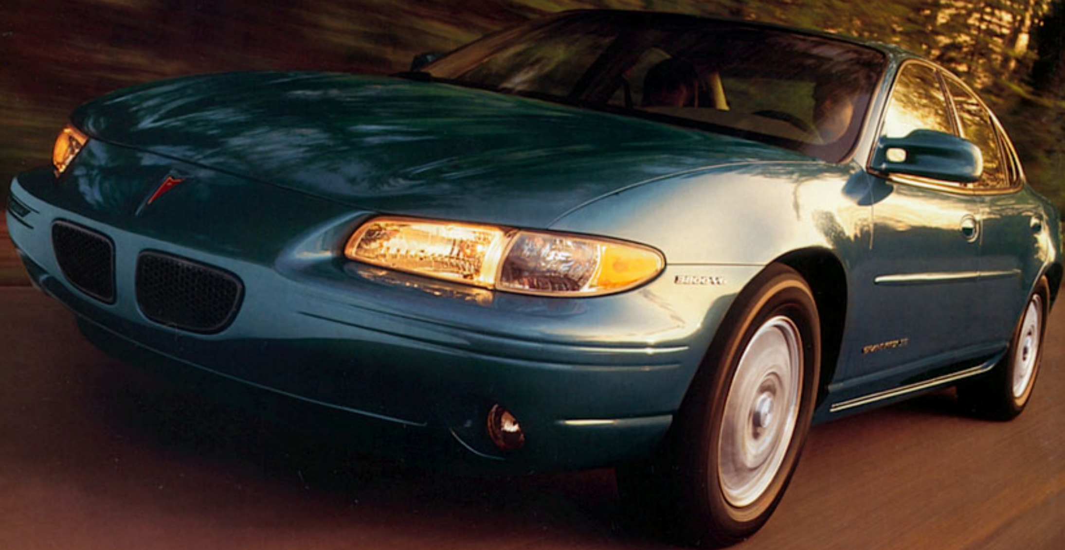
Grand Prix SE Sedan in Medium Jade-Gray Metallic with the available 16" Silver Crosslace Wheels.