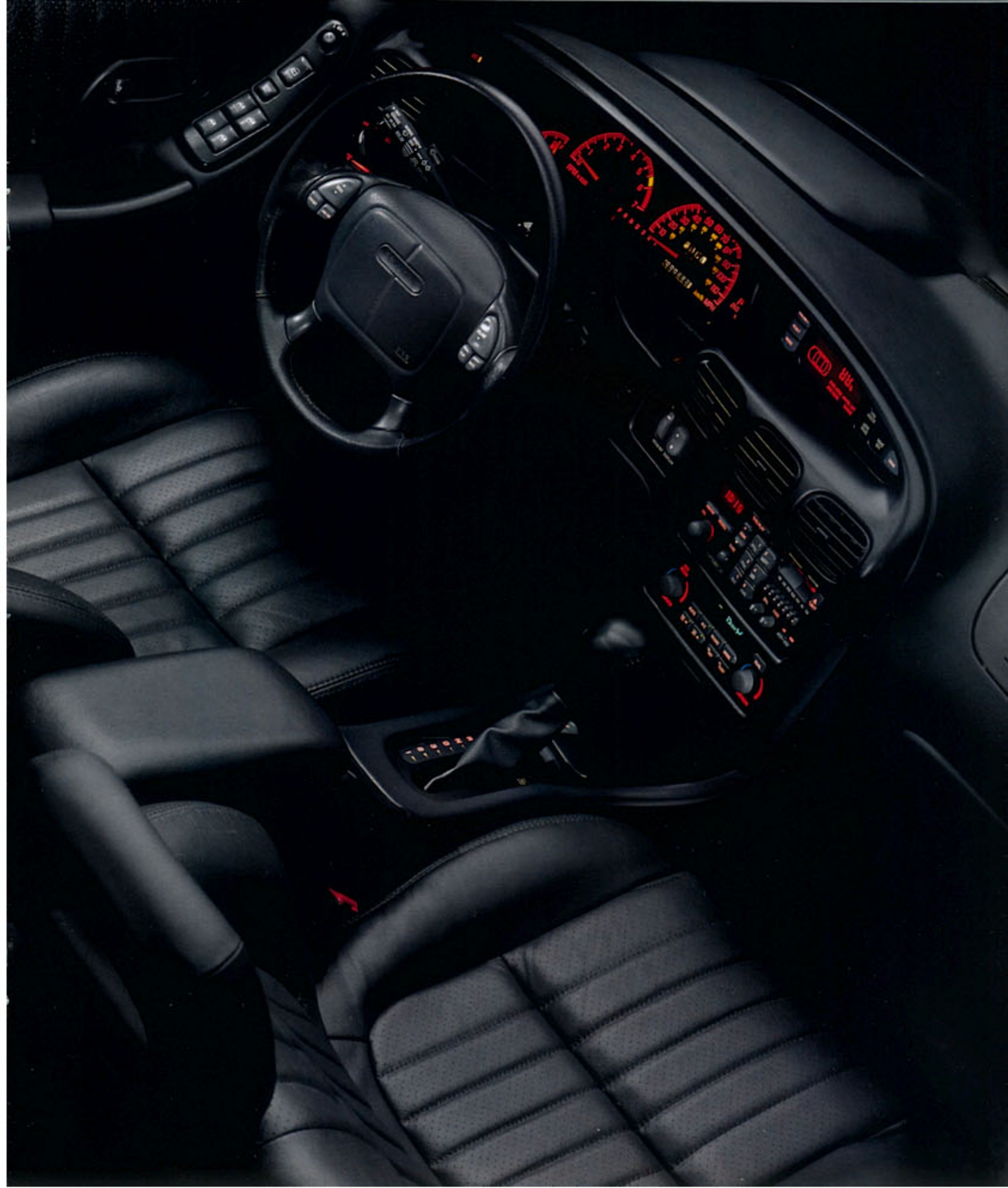
GT Sedan Interior in available Graphite leather.