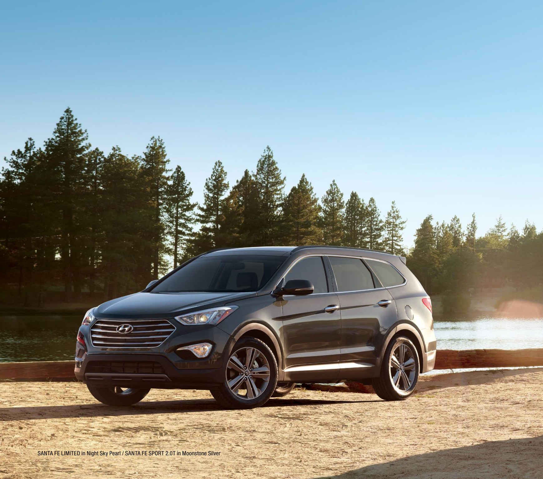
SANTA FE LIMITED in Night Sky Pearl / SANTA FE SPORT 2.0T in Moonstone Silver