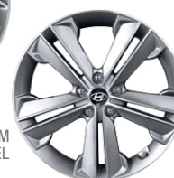
19" ALUMINUM ALLOY WHEEL