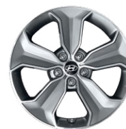
18" ALUMINUM ALLOY WHEEL