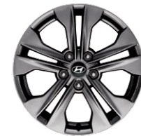
17" ALUMINUM ALLOY WHEEL