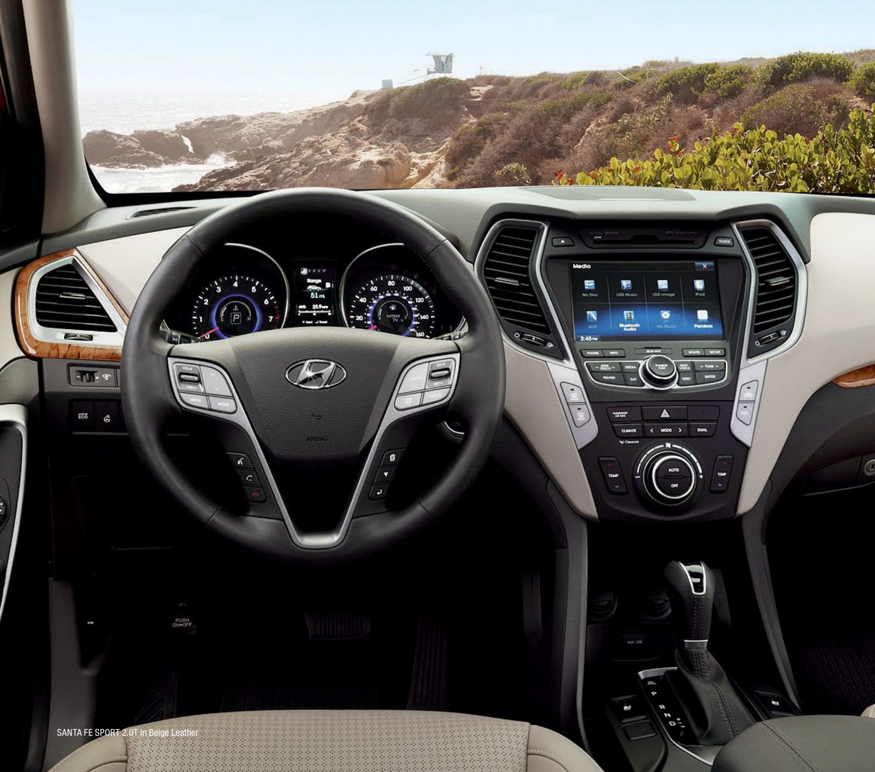
SANTA FE SPORT 2.0T in Beige Leather