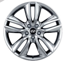
19" ALUMINUM ALLOY WHEEL