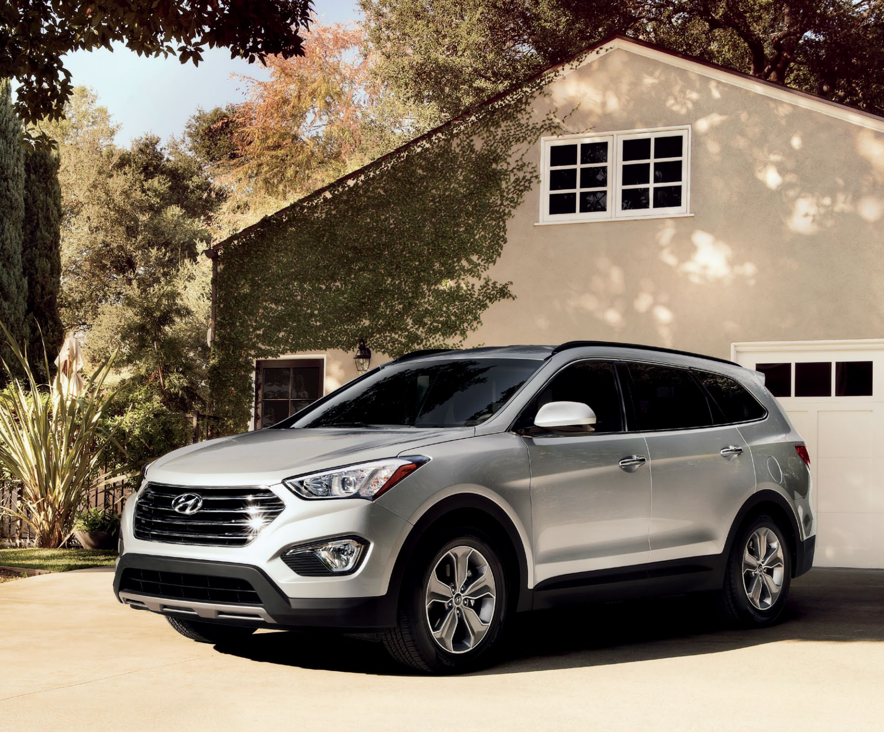
SANTA FE GLS in Circuit Silver