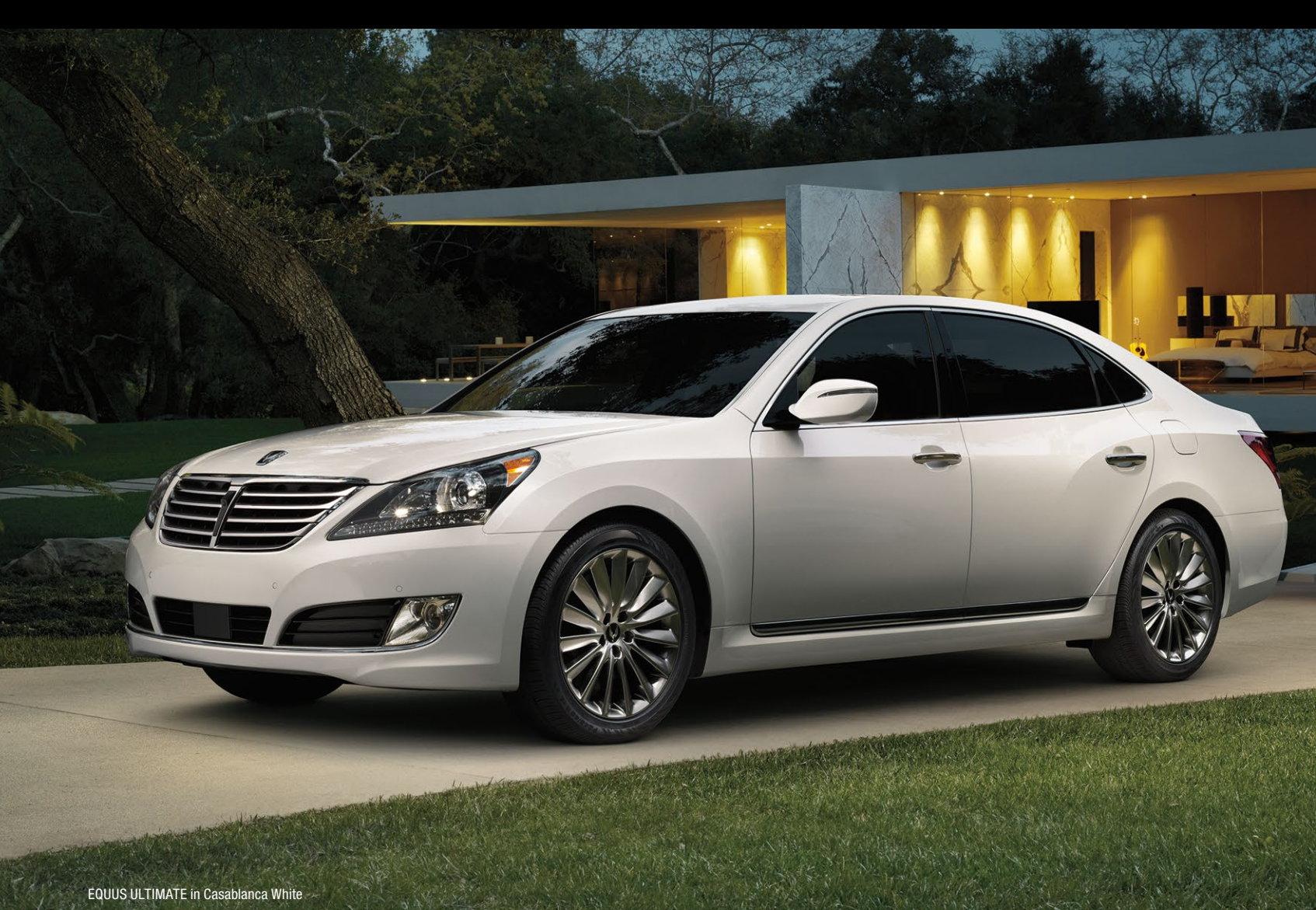
EQUUS ULTIMATE in Casablanca White