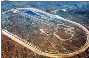
Proving Grounds in California