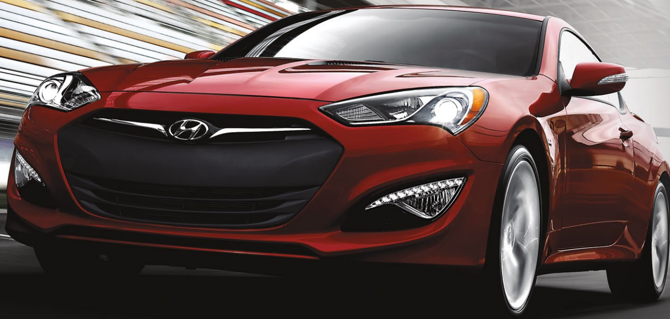
GENESIS COUPE 3.8 ULTIMATE in Tsukuba Red