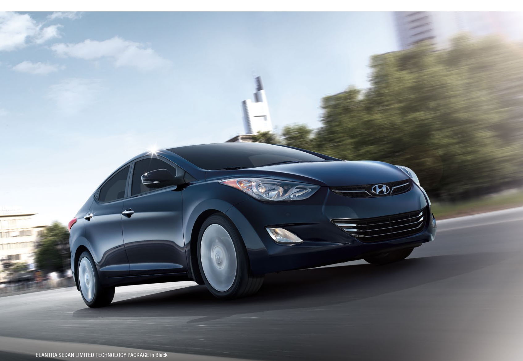
ELANTRA SEDAN LIMITED TECHNOLOGY PACKAGE in Black