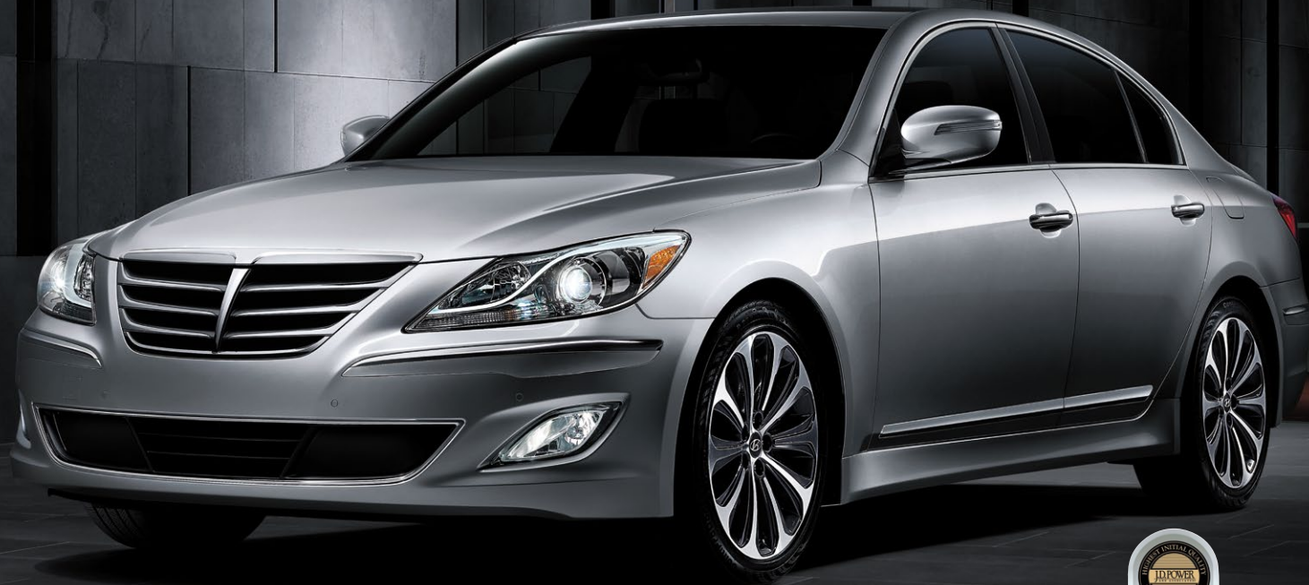
GENESIS 5.0 R-SPEC in Santiago Silver Metallic