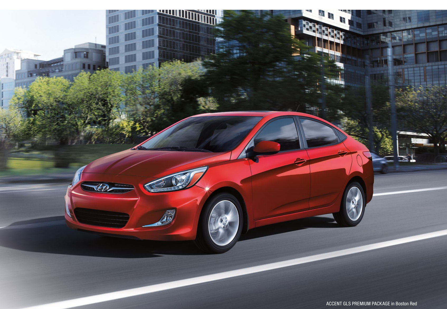
ACCENT GLS PREMIUM PACKAGE in Boston Red