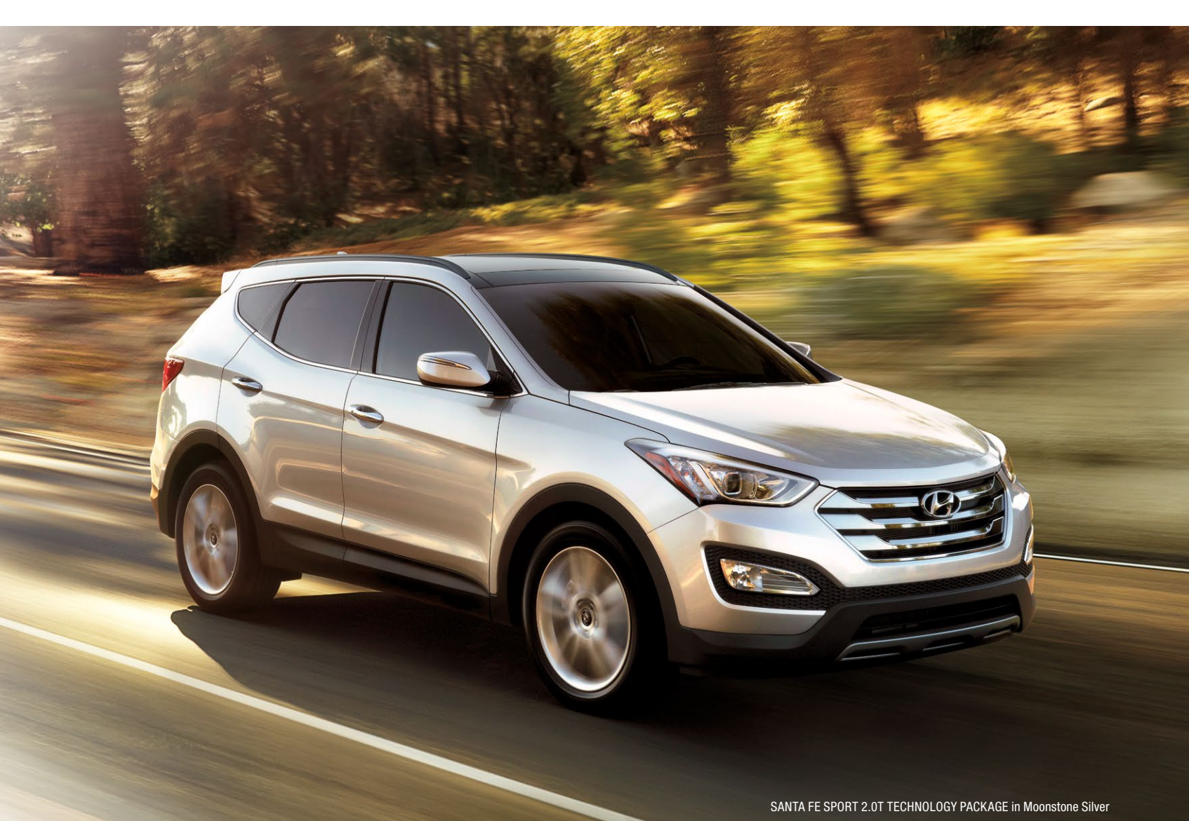
SANTA FE SPORT 2.0T TECHNOLOGY PACKAGE in Moonstone Silver