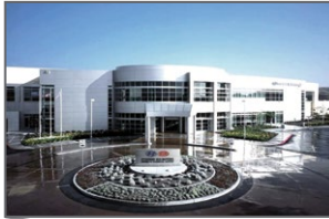
Design Center in California