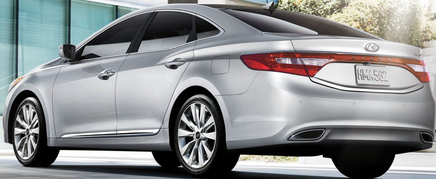
AZERA LIMITED PREMIUM PACKAGE in Silver Frost Metallic