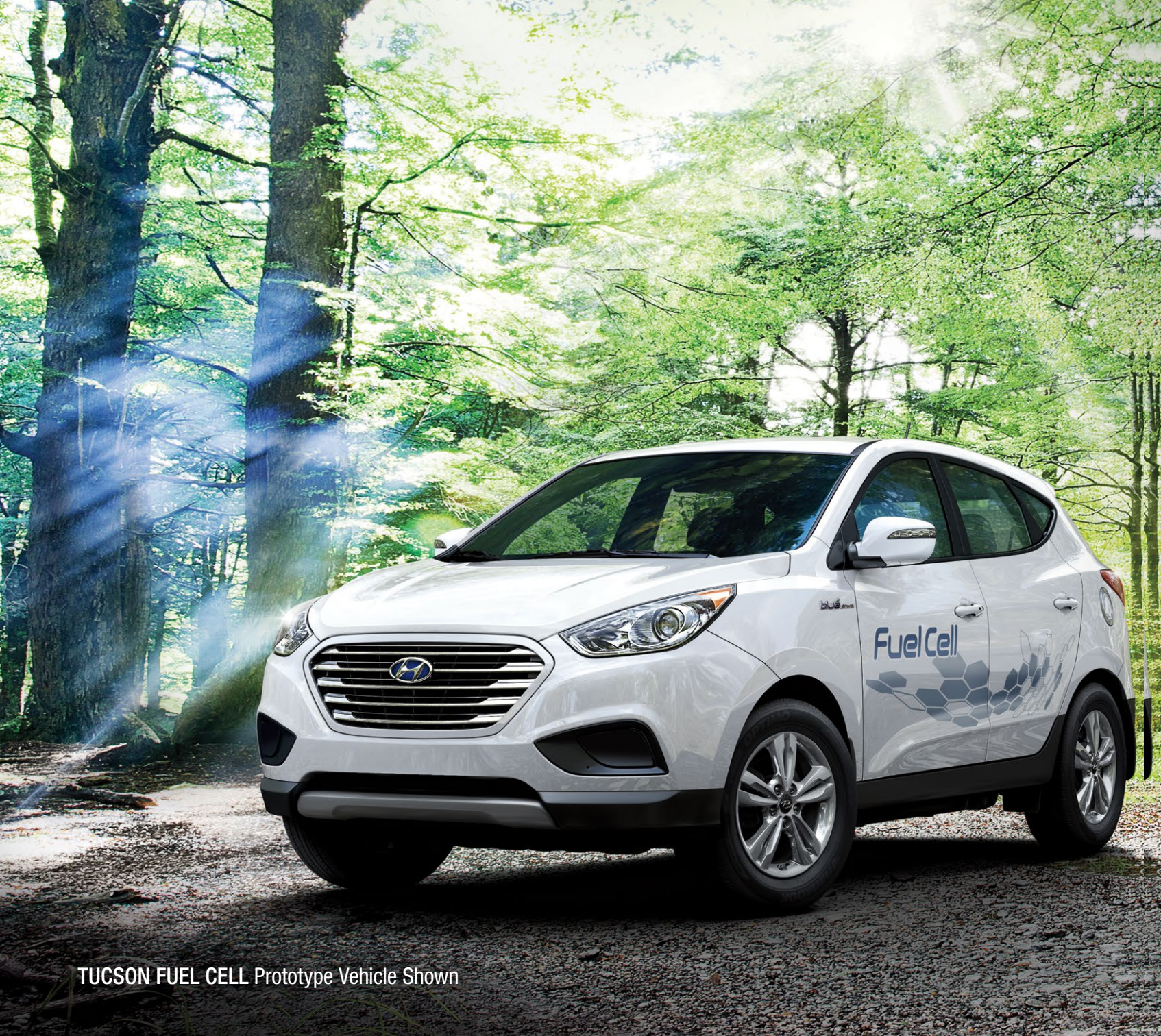
TUCSON FUEL CELL Prototype Vehicle Shown