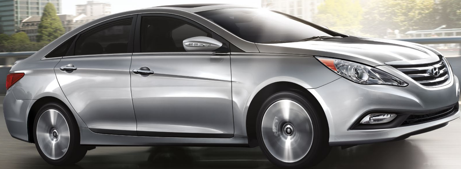
SONATA 2.0T LIMITED in Harbor Gray Metallic