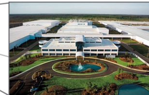
Manufacturing Facility in Alabama