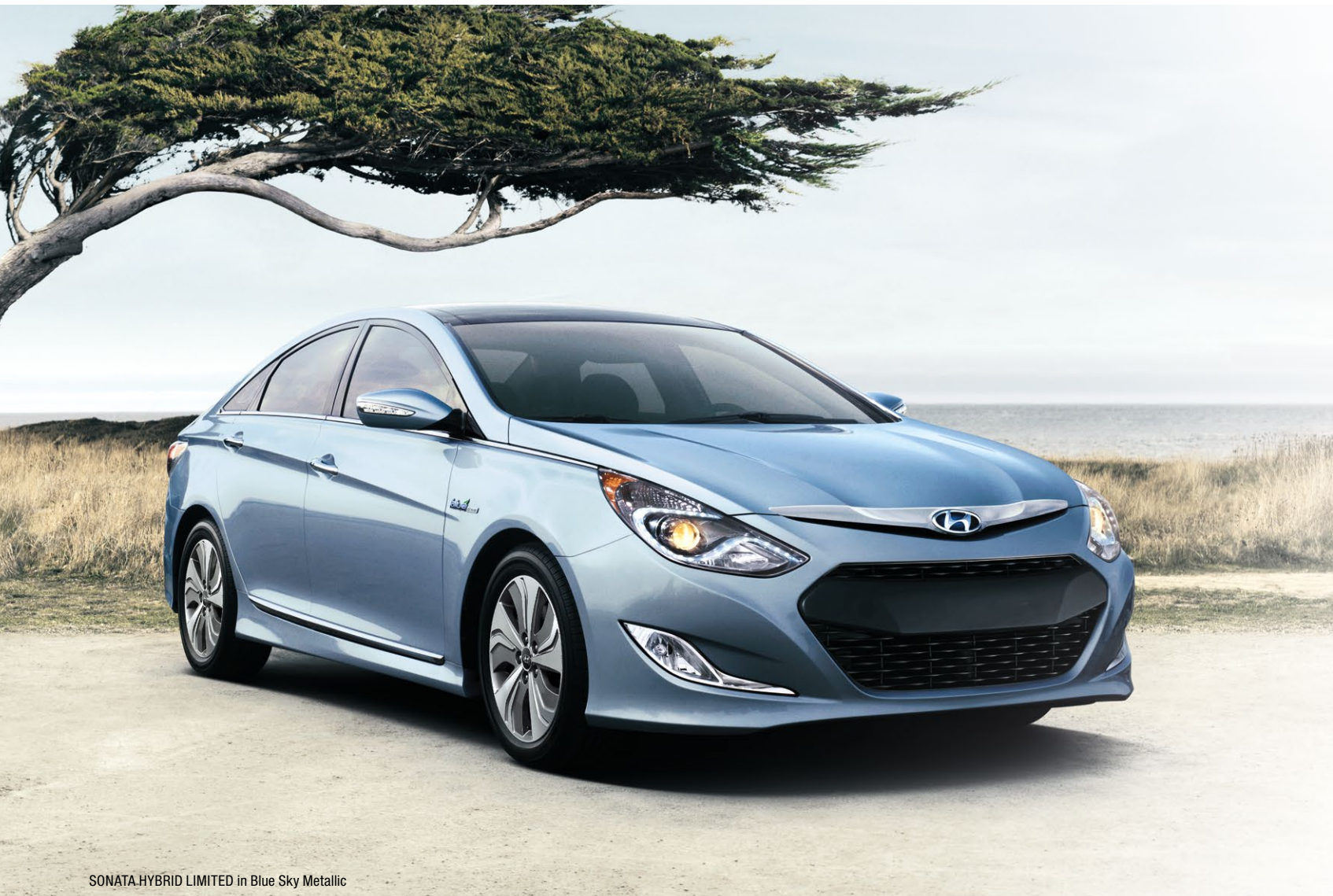
SONATA HYBRID LIMITED in Blue Sky Metallic