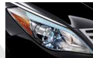
HID Xenon Headlights with Automatic High Beam Assist