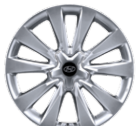
19" Alloy Wheel Limited