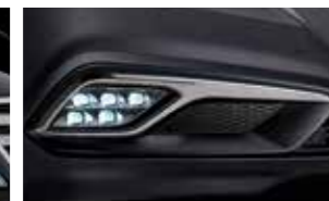
LED Fog Lights