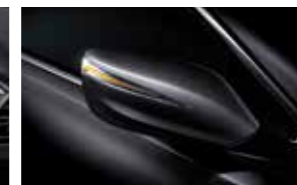
Power-Folding Side Mirrors with LED Turn Signal Indicators