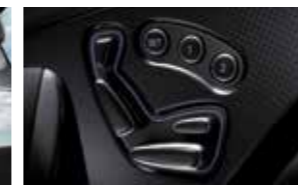
Integrated Memory System