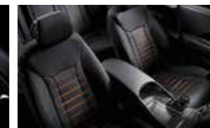
Heated Front and Rear Seats