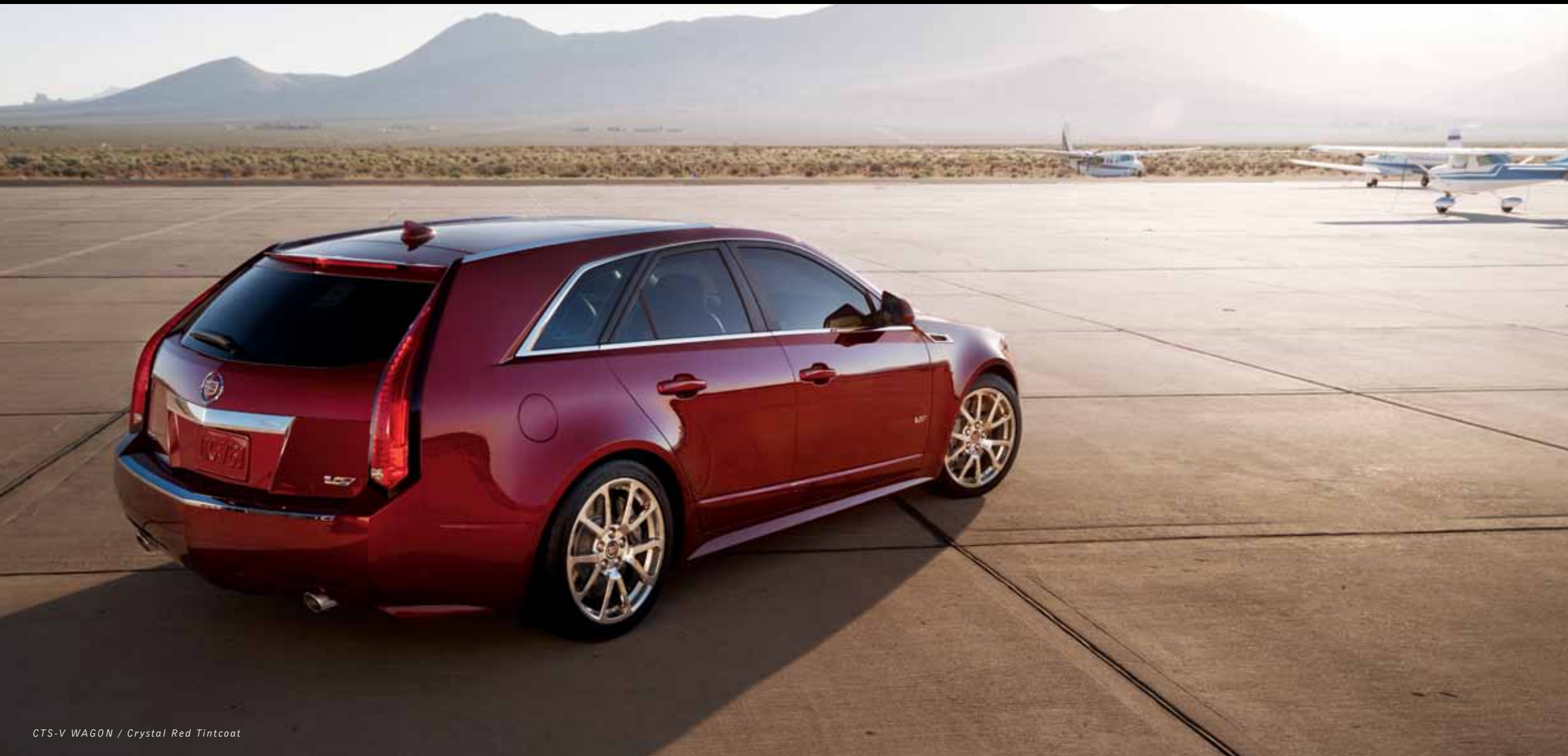
CTS-V WAGON / Crystal Red Tintcoat