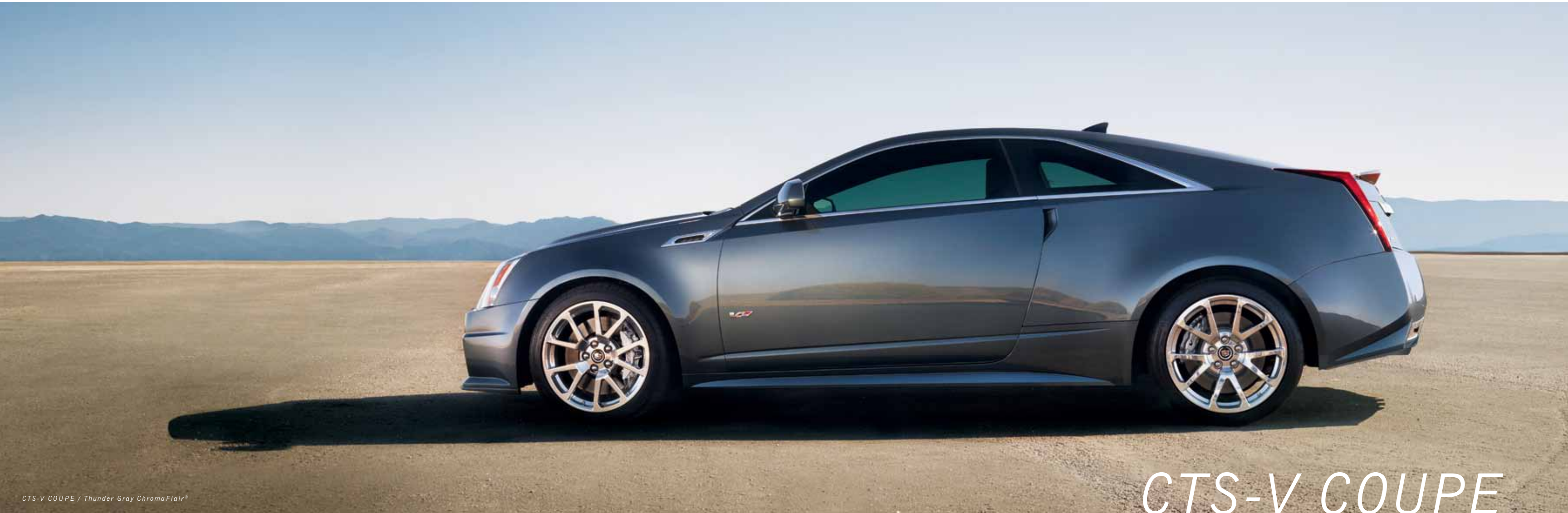
CTS-V COUPE / Thunder Gray ChromaFlair®