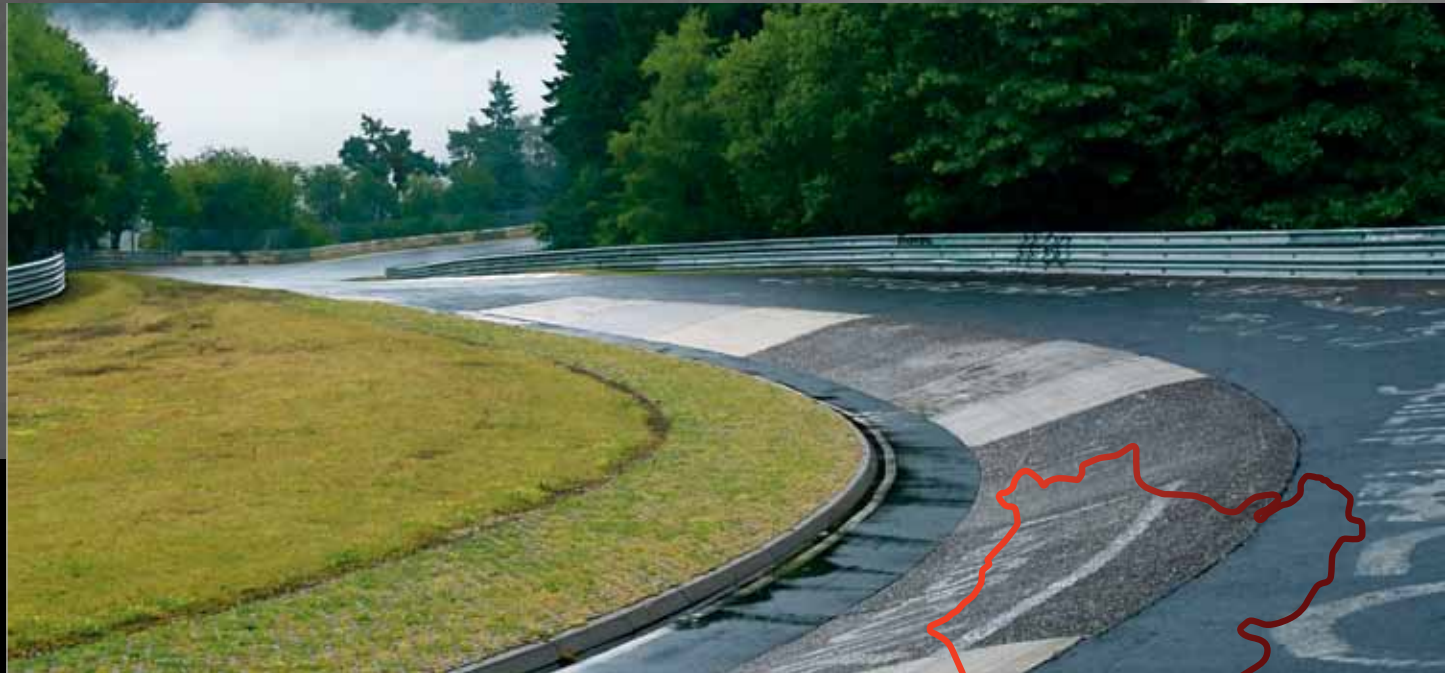
NÜRBURGRING'S FAMED KARUSSELL CORNER