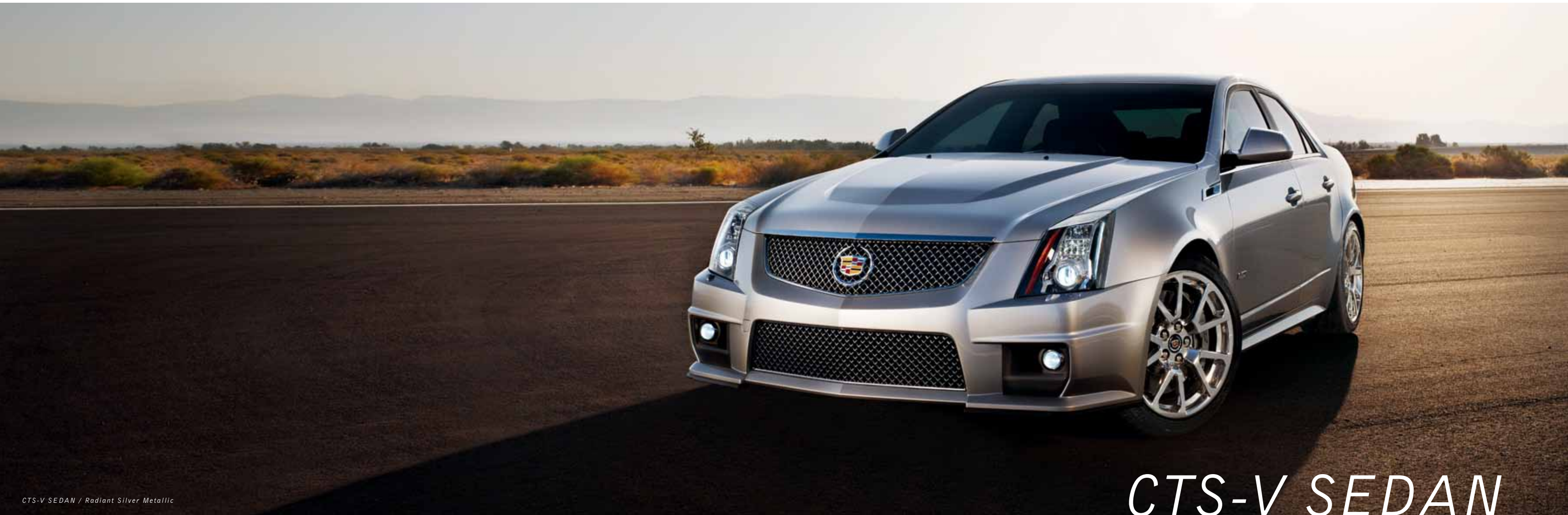
CTS-V SEDAN / Radiant Silver Metallic