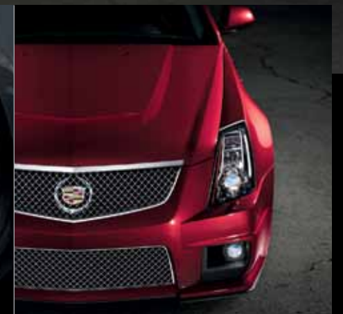
CTS-V POWER DOME HOOD