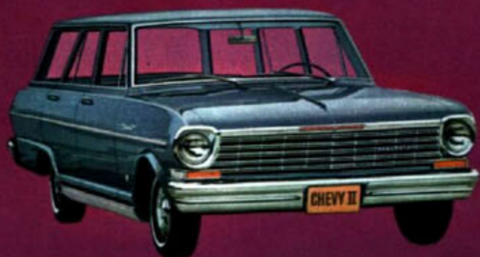
NOVA 4-DOOR 6-PASSENGER STATION WAGON IN SILVER BLUE