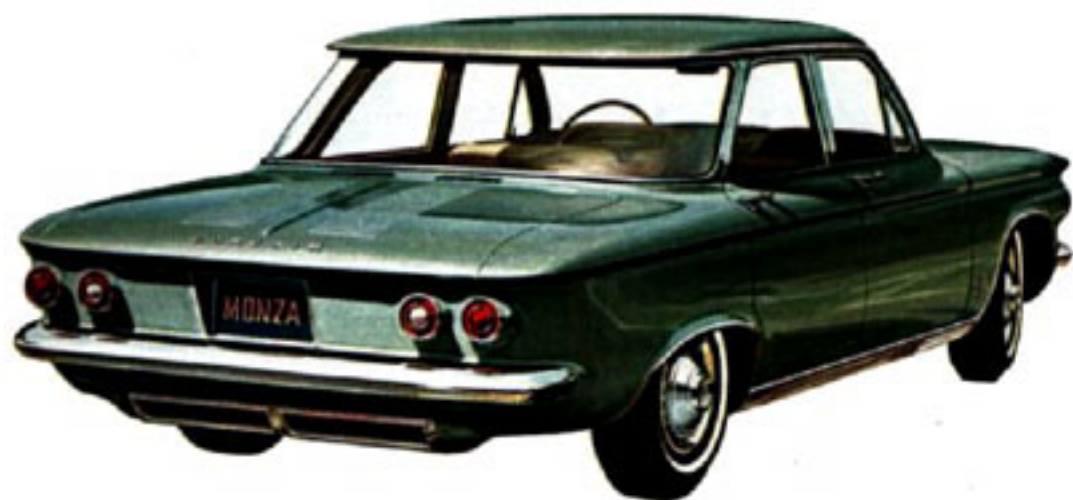
MONZA 4-DOOR SEDAN IN MEADOW GREEN

The big excitement's under the hood for Corvair '64. Up to 15 more horsepower to match its sporty style. Easy-care features to help save time and dollars: long-life exhaust system for extra miles of quiet driving; self-adjusting Safety-Master brakes. This year, put your money (you'd be surprised how little it takes) on any of seven models (all an easy-handling 180 inches long) in four series: two new Monza Spydres in Club Coupe and Convertible; three Monzas—Club Coupe, Convertible and 4-Door Sedan; a 700 4-Door Sedan; and a 500 Club Coupe. Or choose the versatile Greenbrier or Greenbrier De Luxe Sports Wagon for all-around business, pleasure or camping travel.