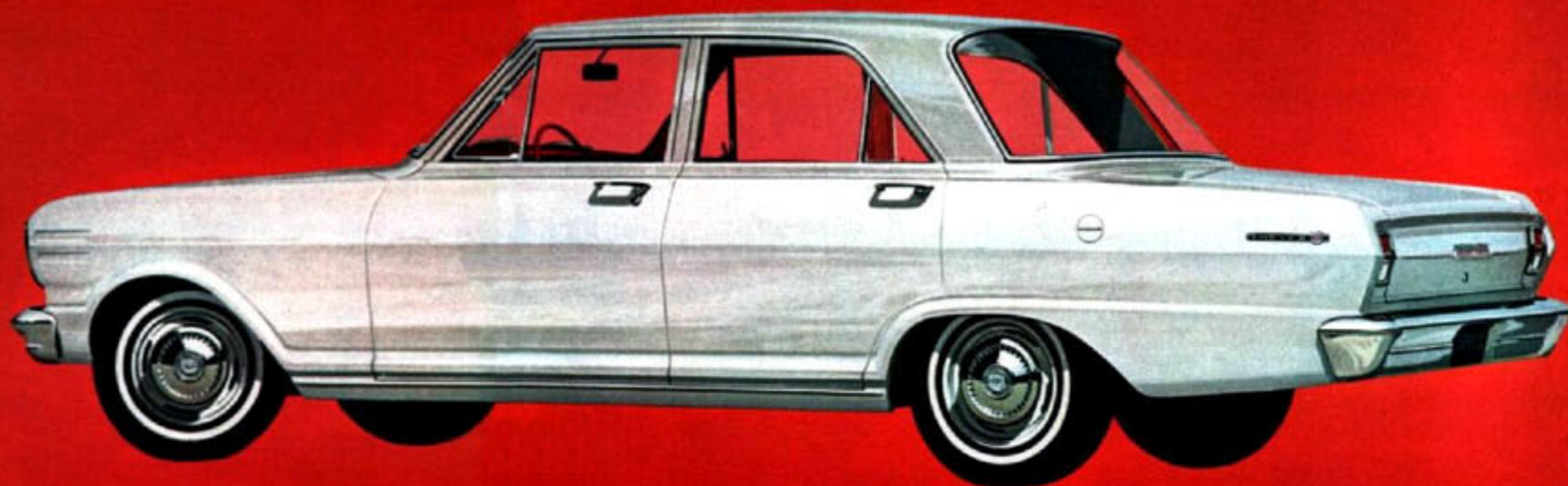
CHEVY II 100 4-DOOR SEDAN IN ERMINE WHITE