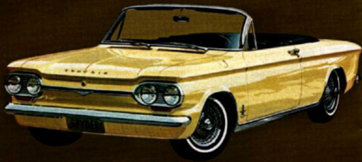
MONZA SPYDER CONVERTIBLE IN GOLDWOOD YELLOW WITH OPTIONAL WIRE WHEELS*