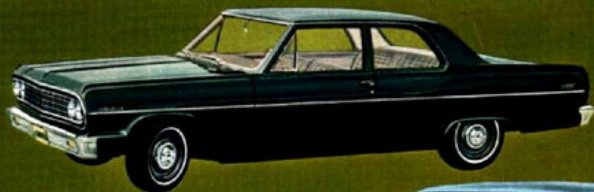
CHEVELLE 300 2-DOOR SEDAN IN BAHAMA GREEN