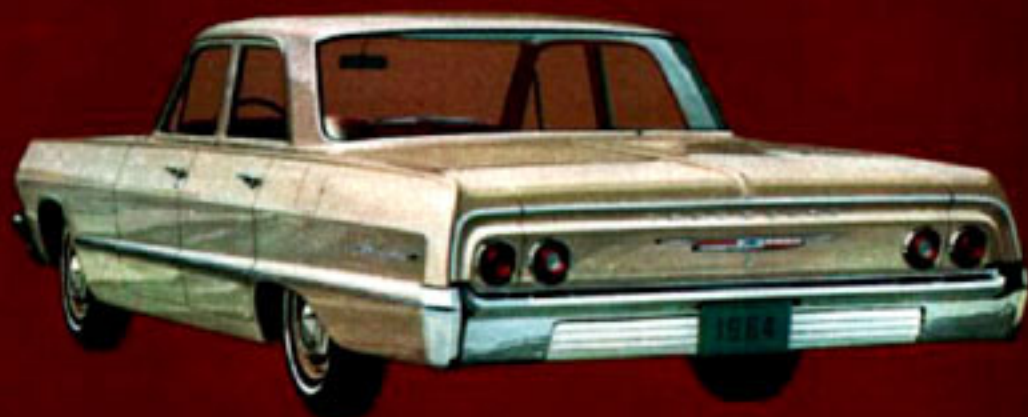
BISCAYNE 4-DOOR SEDAN IN DESERT BEIGE