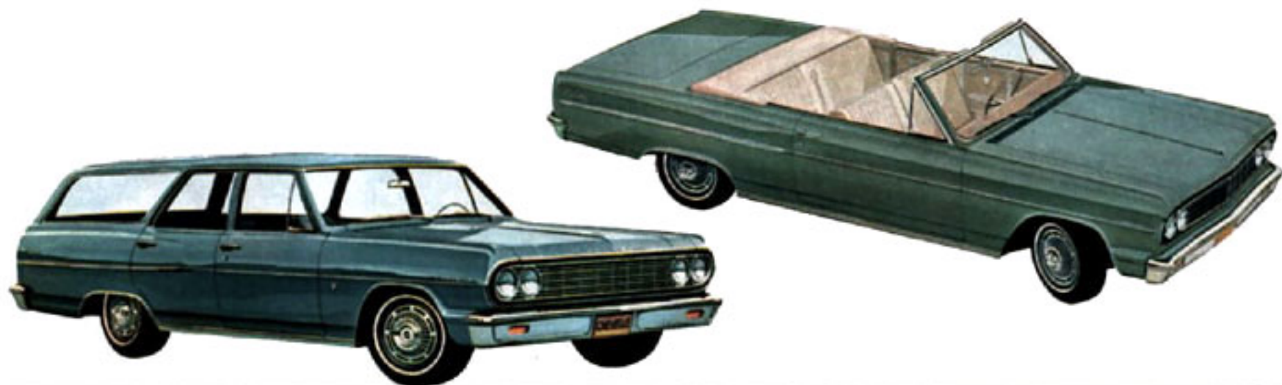
MALIBU 4-DOOR 3-SEAT STATION WAGON IN AZURE AQUA