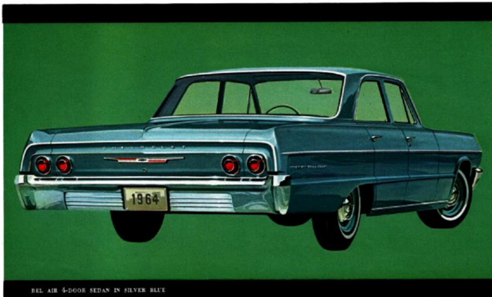
BEL AIR 4-DOOR SEDAN IN SILVER BLUE

Pin down Bel Air's popularity and value heads the list. Bel Air for '64 proves the point. Exterior styling is newly created—front, side and rear—with a stay-fresh quality in every sculptured line. Easy-care features add to your care-free driving pleasure, save on maintenance costs. Inside, Bel Air brings a full measure of good taste and expertly crafted fabric and vinyl materials. Deep-twist carpeting, foam-cushioned seats front and rear, glove box light, automatic dome light, twin rear ashtrays and easy-to-clean vinyl headlining contribute their share to Bel Air's lasting worth. More of the good things in all four Bel Airs: 2- and 4-Door Sedans, 4-Door 6- and 9-Passenger Station Wagons.