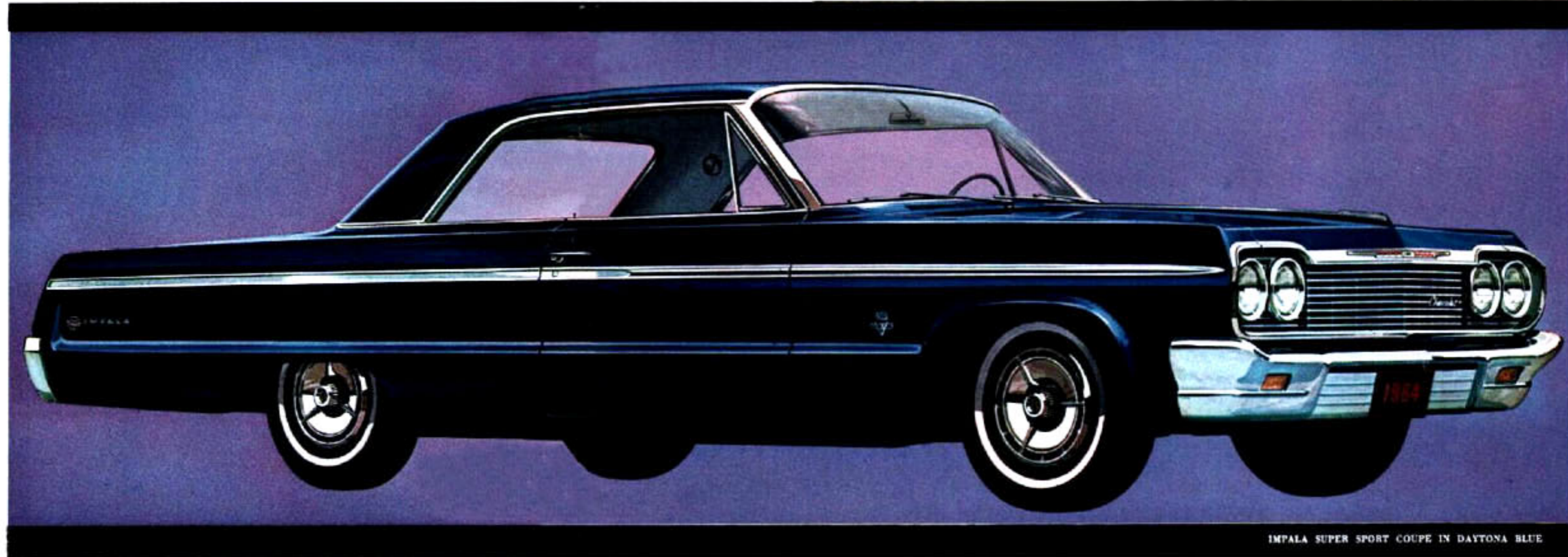
IMPALA SUPER SPORT COUPE IN DAYTONA BLUE