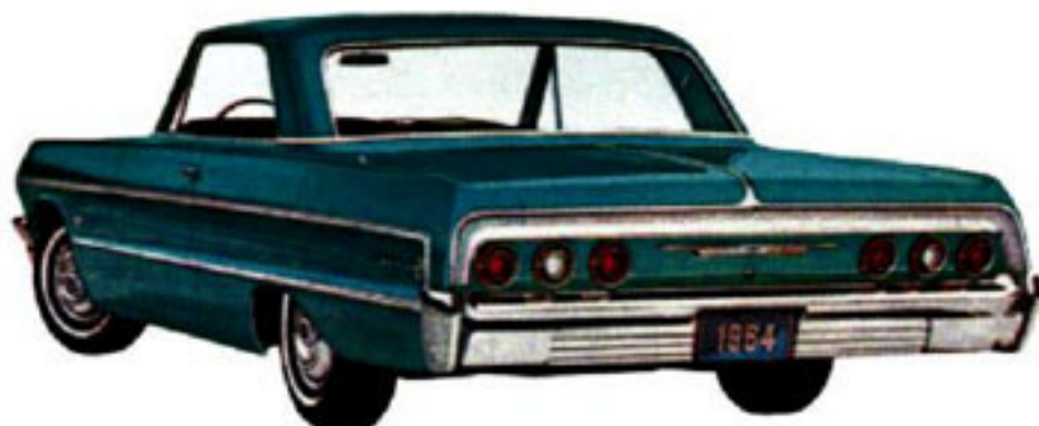
IMPALA SPORT SEDAN IN MEADOW GREEN