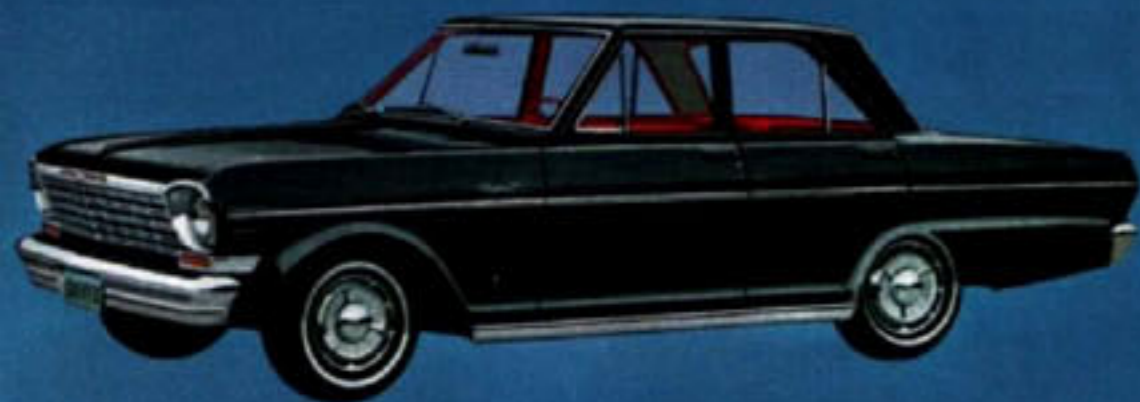
NOVAS SHOWN WITH OPTIONAL WHEEL COVERS* NOVA 4-DOOR SEDAN IN TUXEDO BLACK