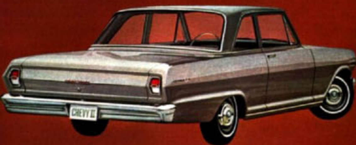
CHEVY II 100 2-DOOR SEDAN IN DESERT BEIGE