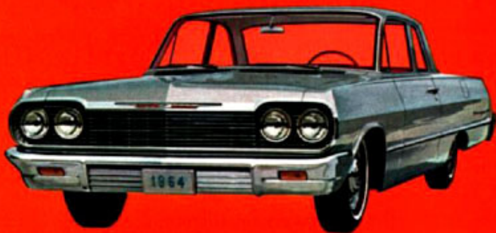
BISCAYNE 2-DOOR SEDAN IN SATIN SILVER