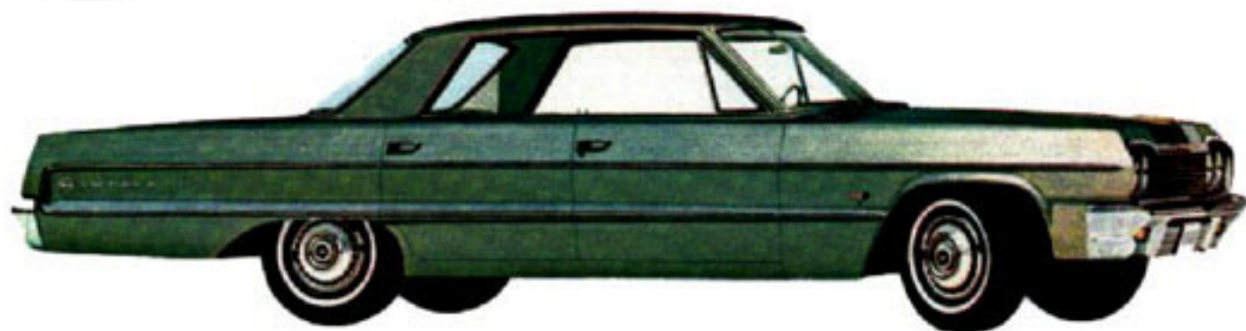
ALL IMPALA MODELS SHOWN WITH OPTIONAL WHEEL COVERS*