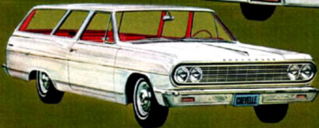
CHEVELLE 300 2-DOOR 6-PASSENGER STATION WAGON IN ERMINE WHITE