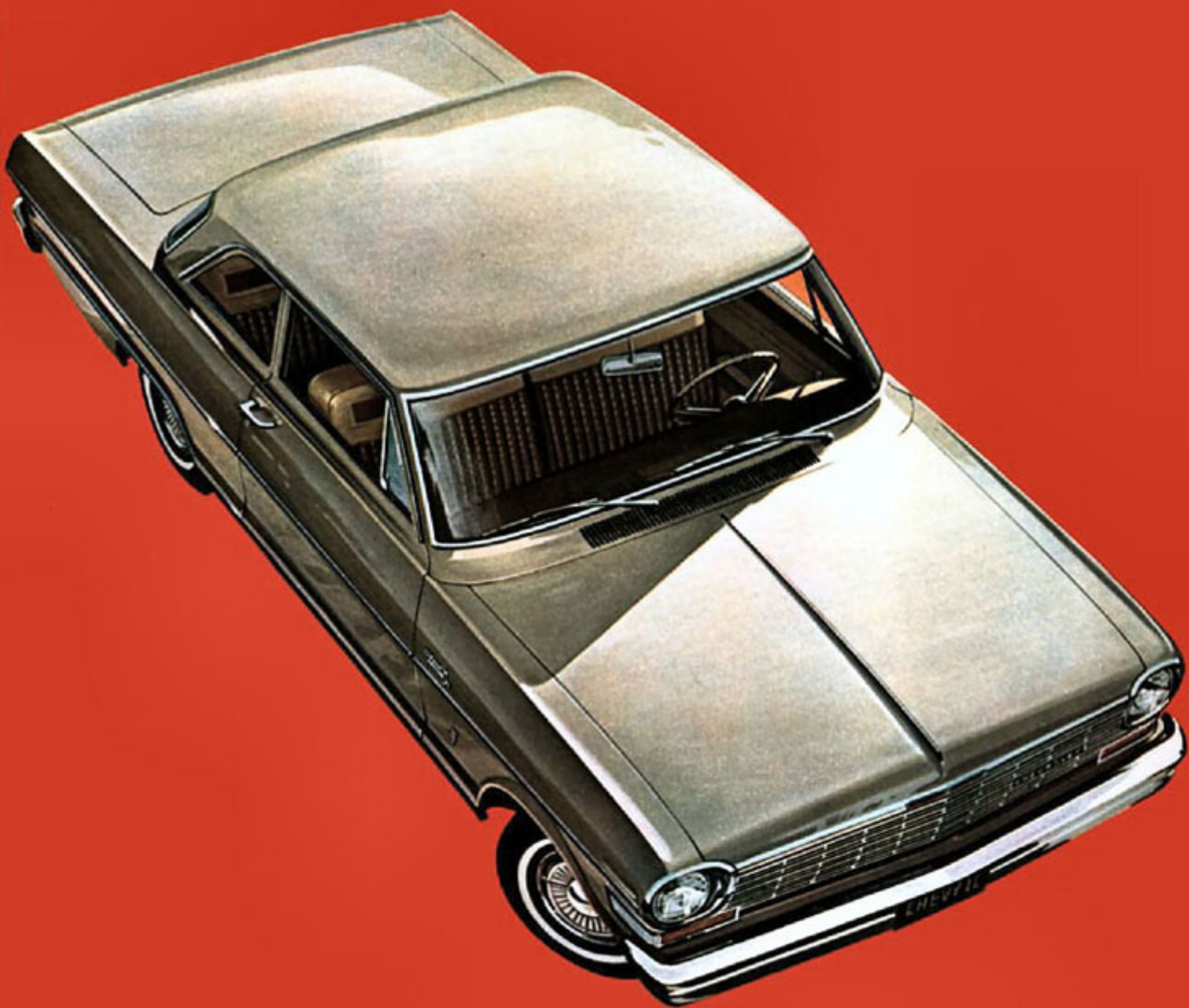
NOVA 2-DOOR SEDAN IN DESERT BEIGE WITH OPTIONAL WHEEL COVERS*