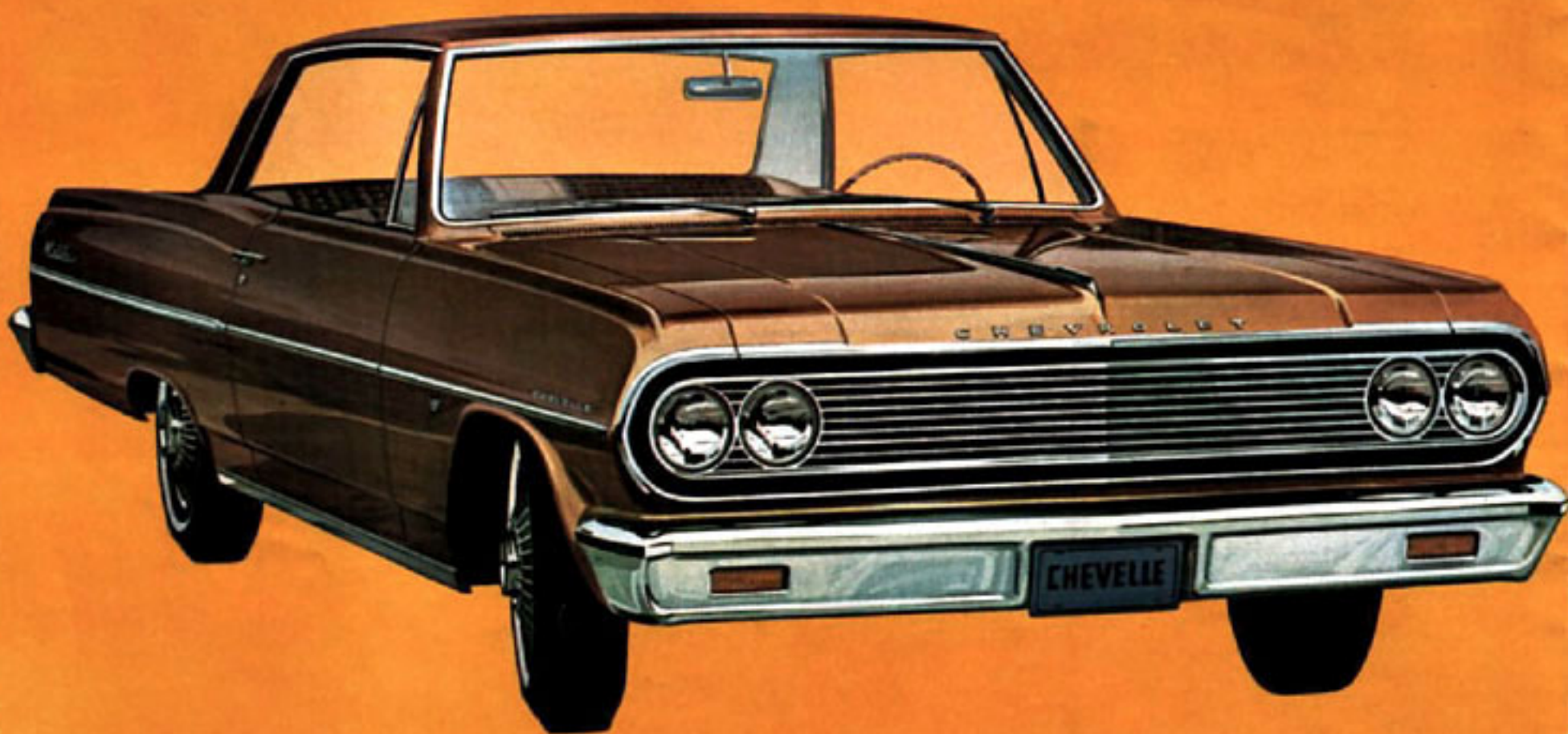
MALIBU SPORT COUPE IN SADDLE TAN