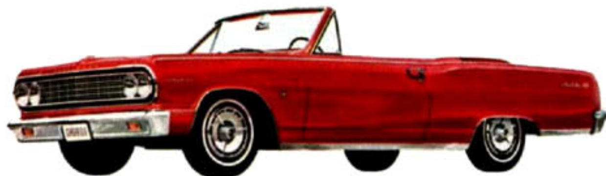
MALIBU SUPER SPORT CONVERTIBLE IN EMBER RED