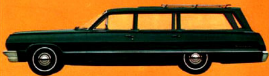
BISCAYNE 4-DOOR 6-PASSENGER STATION WAGON IN BAHAMA GREEN WITH ROOF LUGGAGE CARRIER*