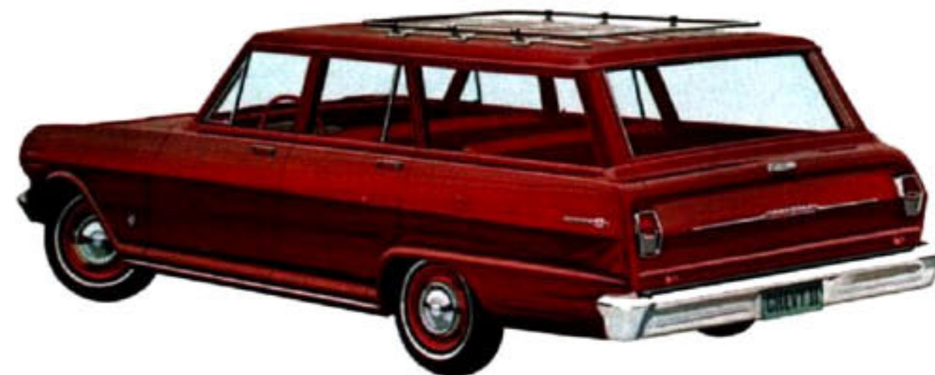
CHEVY II 100 4-DOOR 6-PASSENGER STATION WAGON IN PALOMAR RED WITH ROOF LUGGAGE CARRIER*