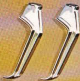
FRONT AND REAR BUMPER GUARDS