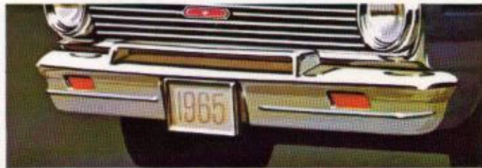
Front Grille and Rear BUMPER GUARDS for Chevy II