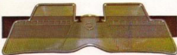
TINTED VINYL REAR MAT

Molded from a tough vinyl for long hard use. Tinted to enhance and brighten the appearance of the car carpeting.