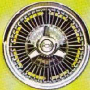
14 INCH WHEELS