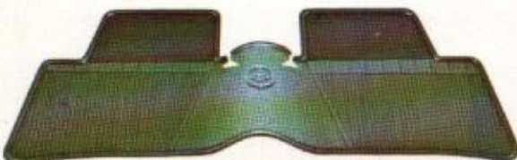
DELUXE FULL WIDTH REAR MATS

Available for Chevrolet, Chevelle, Chevy II, Corvair