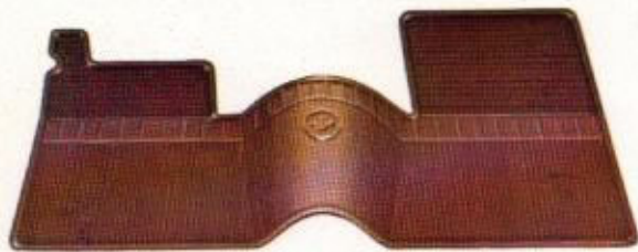
DELUXE FULL WIDTH FRONT MATS

Available for Chevrolet, Chevelle, Chevy II, Corvair