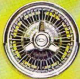
13 INCH WHEELS

Simulated wire wheel covers that are difficult to identify from real wire wheels. The deluxe knock-off spinners are included with the covers.