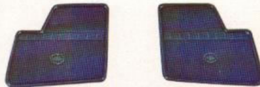
CONTOUR REAR MATS

Available for Chevrolet, Chevelle, Chevy II, Corvair