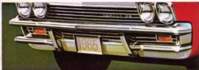
Front Bumper Rails and Rear BUMPER GUARDS for Chevrolet