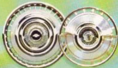
(14") CHEVY II (13")