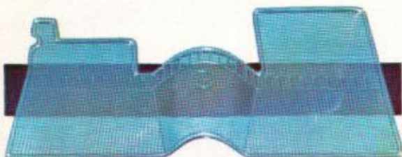
TINTED VINYL FRONT MAT