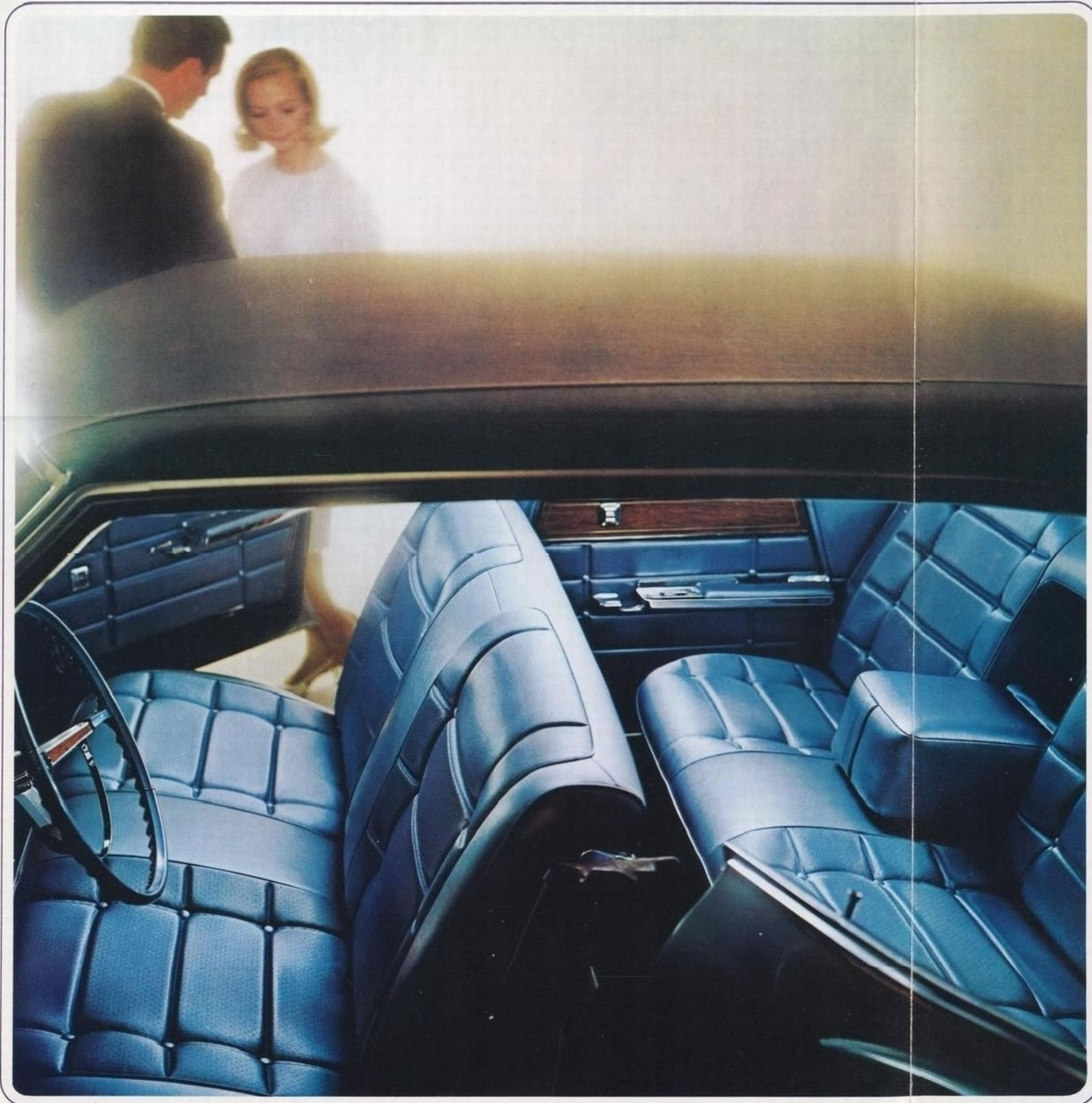
Shown on front cover: Caprice Custom Sedan in Mist Blue.