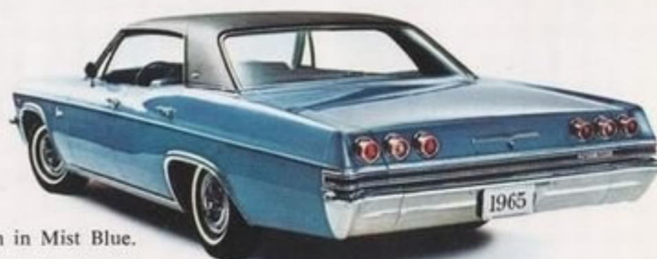
Caprice Custom Sedan in Mist Blue.

All illustrations and specifications contained in this literature are based on the latest product information available at the time of publication approval. The right is reserved to make changes at any time without notice in prices, colors, materials, equipment, specifications and models, and also to discontinue models. CHEVROLET MOTOR DIVISION, GENERAL MOTORS CORPORATION, DETROIT, MICHIGAN 48202.