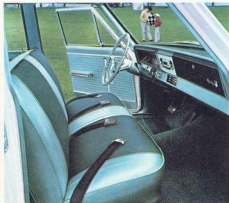
Nova 4-Door 2-Seat Wagon interior in turquoise.