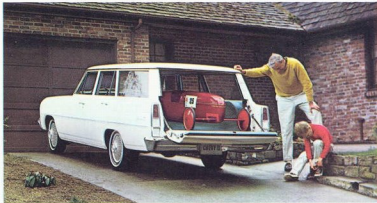
Nova 4-Door 2-Seat Station Wagon in Ermine White.