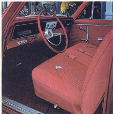
Nova 4-Door Sedan interior in red.