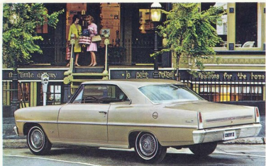
Nova Sport Coupe in Sandalwood Tan.