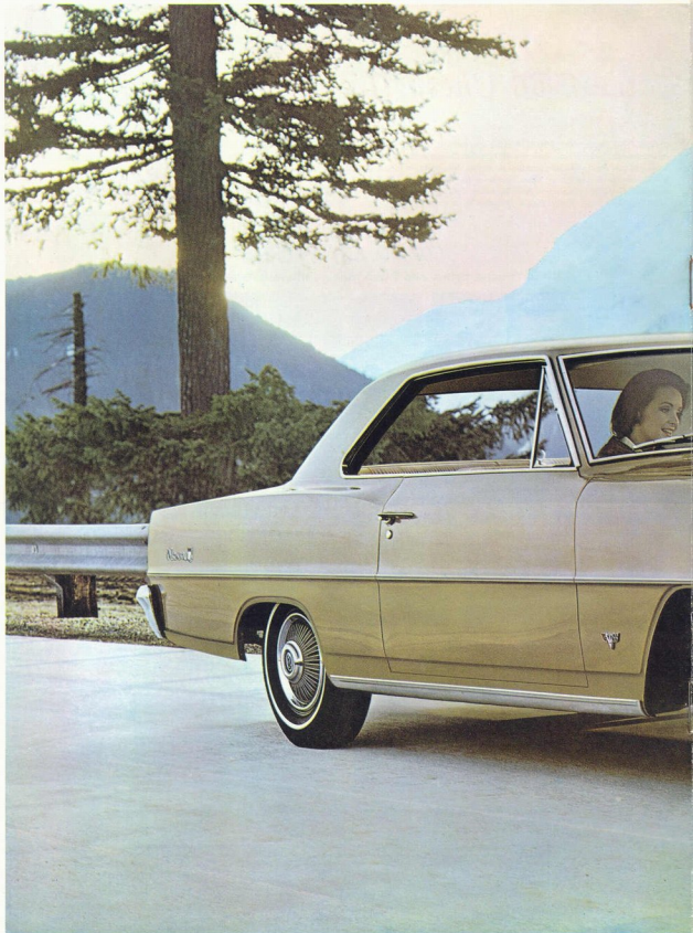
Nova Sport Coupe in Sandalwood Tan.