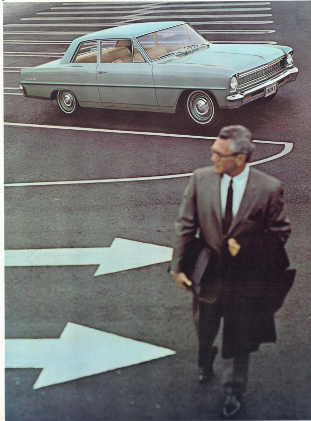
Chevy II 100 2-Door Sedan in Artesian Turquoise.