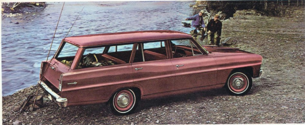
Chevy II 100 4-Door 2-Seat Station Wagon in Madeira Maroon.