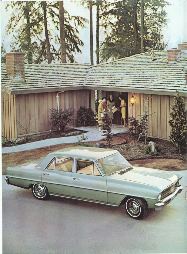
Nova 4-Door Sedan in Willow Green.