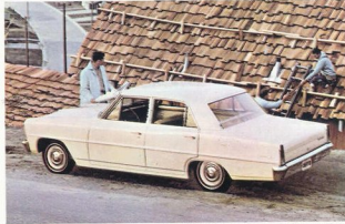
Chevy II 100 4-Door Sedan in Cameo Beige.