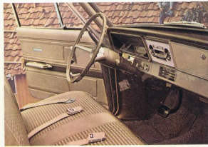
Chevy II 100 4-Door Sedan interior in fawn.