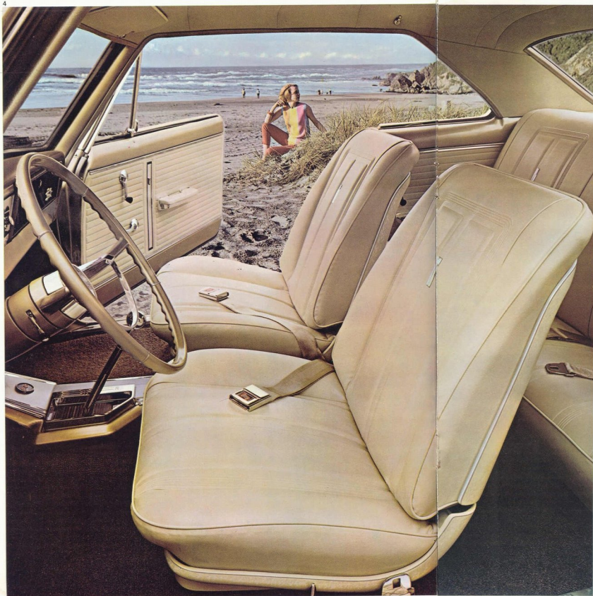
Nova Super Sport Coupe interior in fawn.