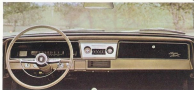
New Super Sport padded instrument panel with rally-type clock.