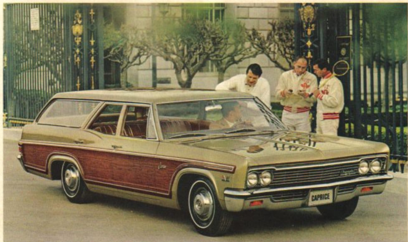
Caprice 4-Door 3-Seat Custom Wagon in Sandalwood Tan

CAPRICE WAGON. What the look of rich walnut-trimmed interiors does for our custom coupe and custom sedan, it duplicates on the outside of Caprice 2- and 3-Seat Custom Wagons. Side and tailgate panels have the same striking appearance of fine matched-grain woods. And when you swing open a door or drop the tailgate, Caprice refinement again repeats itself in the deeply cushioned, tufted vinyl seats and plush deep-twist carpeting. But with all