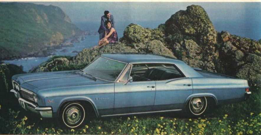
Impala Sport Sedan in Marina Blue

exterior lines are beautifully balanced inside by trim Strato-bucket front seats bracketing a convenient center console. Thick padded carpeting and foam-filled all-vinyl upholstery are color-keyed to 15 Magic-Mirror colors.