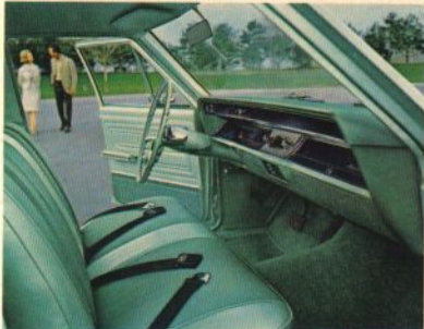
Malibu 4-Door Sedan interior in turquoise

MALIBU INTERIOR. You'd expect to find a Malibu interior as exciting as the outside, wouldn't you? No need to be disappointed. You get deep-twist carpeting, pattern cloth and vinyl seats backed by foam cushioning, vinyl sidewalls. Center console and Strato-bucket seats are available for sport coupe and convertible. And, depending on model selected, all-vinyl interiors can be installed.