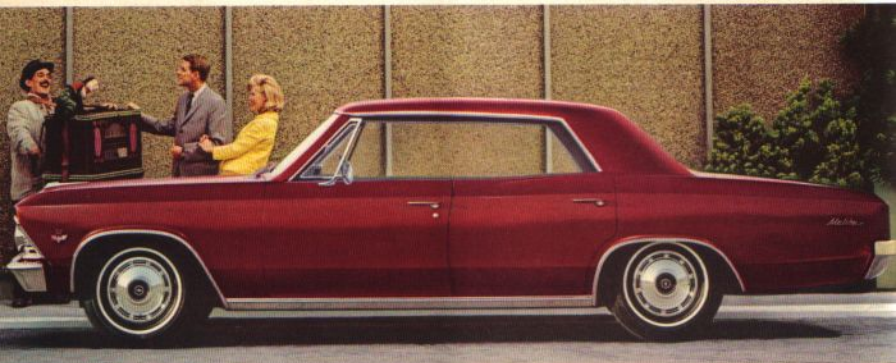
Malibu Sport Sedan in Madeira Maroon

chronized transmission with shift lever mounted sports-car fashion . . . on the floor, easy to reach. Fully synchronized 4-Speed and Powerglide automatic are obtainable. And special instrumentation (including ammeter and tachometer) and sports-styled steering wheel may be specified. Completing the SS 396's sporty looks are red-stripe tires, checkered-flag emblems, tasteful bright metal moldings and simulated hood air-scoops.