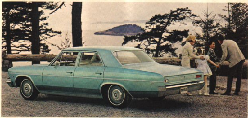
Chevelle 300 Deluxe 4-Door Sedan in Artesian Turquoise

MALIBU INTERIOR. You'd expect to find a Malibu interior as exciting as the outside, wouldn't you? No need to be disappointed. You get deep-twist carpeting, pattern cloth and vinyl seats backed by foam cushioning, vinyl sidewalls. Center console and Strato-bucket seats are available for sport coupe and convertible. And, depending on model selected, all-vinyl interiors can be installed.