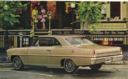
Nova Sport Coupe in Sandalwood Tan

sweeping roof line, redesigned hood and fenders. Inside the same sunny story. Front Strato-bucket seats, deep-twist carpet throughout passenger compartment, sporty steering wheel and instrument panel.