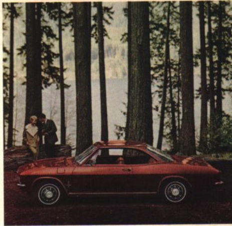
Monza Sport Coupe in Aztec Bronze

3 MONZAS. The most popular Corvair series. Sport coupe, sport sedan and convertible are kin to the Corsa with all-vinyl interiors and foam-cushioned front bucket seats. Engines come in three sizes: standard with 95 horses or the 110-hp and 140-hp versions you can designate. A fully synchronized 3-Speed gearbox is standard; 4-Speed and Powerglide also available.