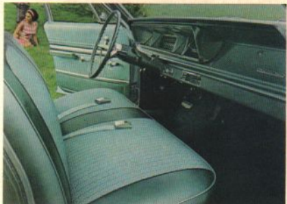
Bel Air 4-Door Sedan interior in turquoise

BEL AIR INTERIOR. People still find it hard to believe such a smart interior costs so little to own. However, they're quickly converted by fully fashioned pattern cloth and vinyl upholstery (all-vinyl in the wagons), curved glass side windows, all-vinyl sidewalls and headlining, color-keyed deep-twist carpeting. Notwithstanding standard items like the glove box light and lock, blended-air heater-defroster, foot-operated parking brake and cigarette lighter that point up the extra value.