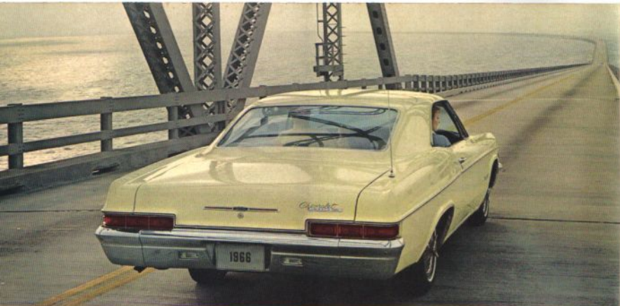
Impala Super Sport Coupe in Lemonwood Yellow

2 IMPALA SUPER SPORTS. Rakish looking from any angle, both the Impala Super Sport Coupe and Convertible never let you (or anyone else, for that matter) forget you're driving a man's machine. The lean-muscled