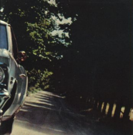
SS 396 Sport Coupe in Ermine White