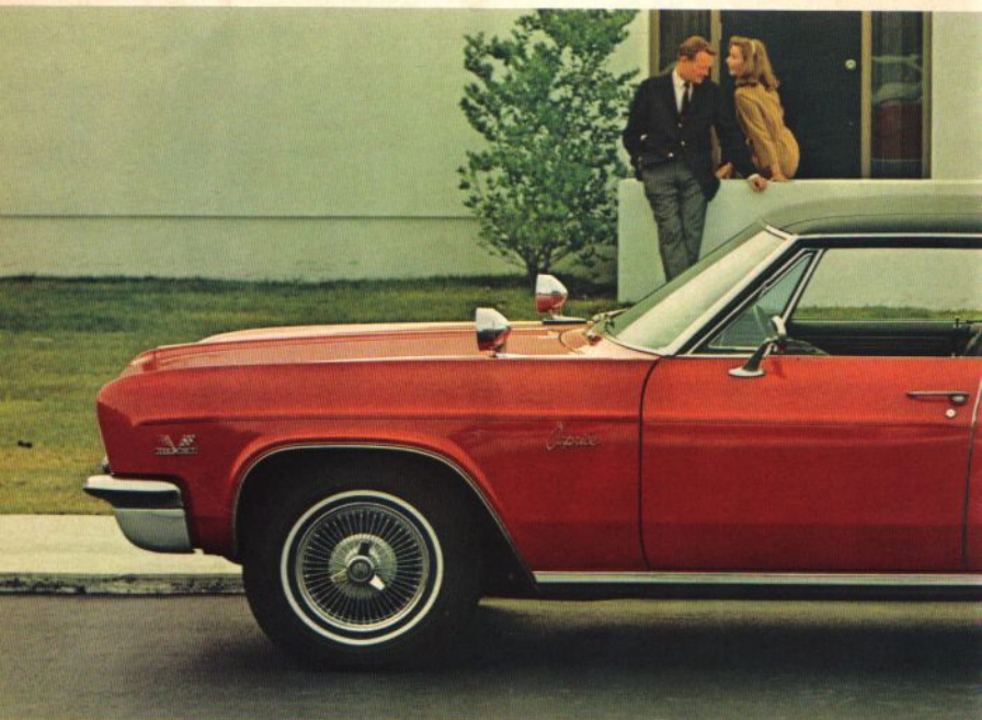
Caprice Custom Sedan in Regal Red shown with some of the many distinguishing extras available

TURBO-JET 427 V8 ENGINE. Two horsepower ratings available — 390 and 425. The 390-hp version features a four-barrel carburetor with automatic choke, high-lift camshaft and hydraulic lifters, dual exhaust system with resonators and a compression ratio of 10.25:1. The 425-hp Turbo-Jet engine has a larger four-barrel carburetor, special camshaft, mechanical valve lifters, dual exhaust system and special air cleaner. Compression ratio is 11:1. This engine can be specified for all full-size Chevrolets and Corvettes. 4-SPEED TRANSMISSION. Fully synchronized in all forward gears for smooth up- and downshifting