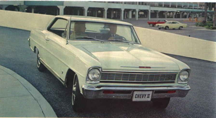
Nova Super Sport Coupe in Ermine White