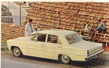
Chevy II 100 4-Door Sedan in Cameo Beige

3 NOVAS. Surprise, again. Here's additional testimony that great looks and practicality can go together hand in glove. Sport coupe, 4-door sedan and 4-door 2-seat wagon are past masters at mixing them up, only better than ever in 1966. Catch the forward-swept front fenders and smart roof line on this Nova Sport Coupe, for example. And the fresh stock of cloth and vinyl fabrics created especially for Nova. (Station wagon comes all-vinyl.) Depending on model, the standard power plant is a 120-hp Hi-Thrift Six or 195-hp Turbo-Fire V8. Or order from four others,