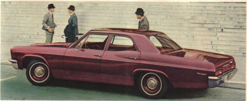
Biscayne 4-Door Sedan in Madeira Maroon

3 BISCAYNES. Anyone who thinks a budget price has to reflect bargain basement features just isn't aware of the Chevrolet Biscayne. That goes for all three 1966 models — 2-door sedan, 4-door sedan and 4-door 2-seat wagon. On the outside, advanced styling is unmistakable in the new