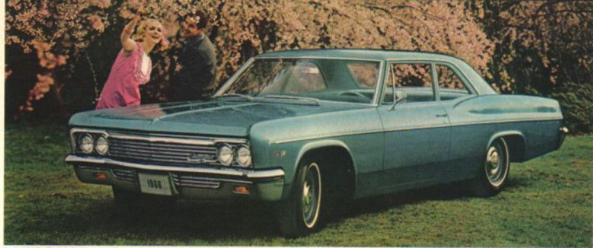
Bel Air 2-Door Sedan in Tropic Turquoise

BEL AIRS. Year after year, Bel Air continues to combine traditional Chevrolet value with contemporary good looks. Four models — 2- and 4-door sedans, 2- and 3-seat wagons — blend crisp '66 styling, plenty of minimum-maintenance features and a price tag that won't throw your wallet out of joint. But, as you know, this is all part of the Chevrolet way.