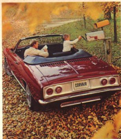
Corsa Convertible in Madeira Maroon