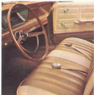
Caprice Custom Wagon Interior in Fawn. Seat belts standard front and rear.

☐ Included in the car descriptions and shown in the illustrations throughout this catalog are some of the many Options and Custom Features available for your new Chevrolet. They add much to your driving pleasure, yet are moderately priced. A more complete list is on page 14 of this folder.