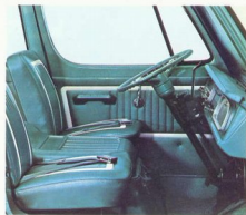
Deluxe Sportvan Interior in Turquoise.

You haven't heard it all yet. Just use your imagination, no telling how many uses you can put your Sportvan to. For one thing, you can fit it out with all manner of available camping and sleeping facilities. You'll have your own vacation motel on wheels. Ask at your Chevrolet dealer's about all the versatile Sportvan possibilities and the unique options you can order. Be different and shrewd; be a Sportvan goer.