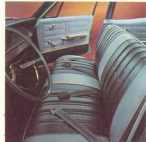
Impala Wagon Interior in Blue. Deep-twist carpeting matches interior colors.

□ You'll have no problem choosing between luxury and utility. Impala has both in generous helpings. Standard items include carpeting, color - matching seat