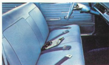
Chevelle 300 Deluxe Wagon Interior in Blue.

□ Standard equipment (really deluxe) includes an all-vinyl interior in fawn, blue or red, depending on exterior color; padded instrument panel; padded sun visors; armrests front and rear; cigarette lighter; electric two-speed glare-reducing parallel action windshield wipers and washer; blended-air heater and defroster; easy roll-down tailgate window; color-matched vinyl-coated rubber load floor mat; seat belts front and rear; shatter-resistant inside rear-view mirror. Want more? There is. You benefit from the many Chevrolet-engineered easy-care features like Delco-tron generator.