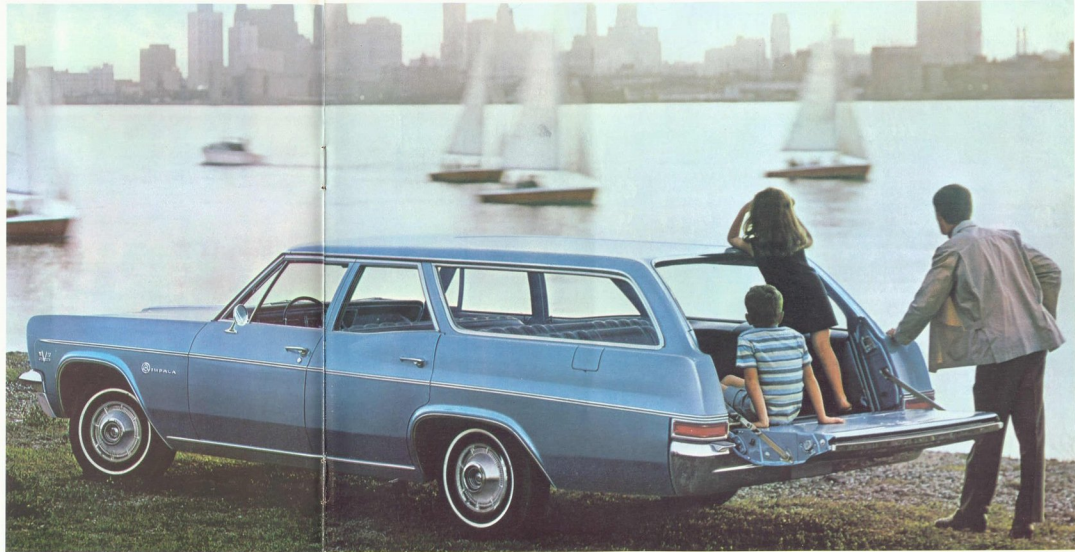
Impala 4-Door 3-Seat Station Wagon in Marina Blue.