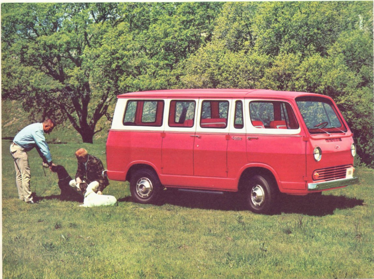
Deluxe Sportvan in Red and Off-White.