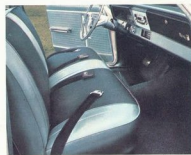
Nova Wagon Interior in Turquoise.

□ Illustrations on these pages show some of the extra-cost Options and Custom Features available on Chevy II wagons. You'll find a comprehensive list on page 15.