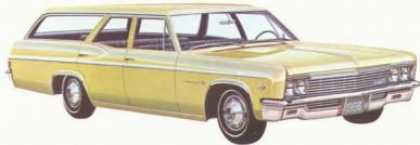
Impala 4-Door 2-Seat Station Wagon in Lemonswood Yellow.

belts front and rear (third seat, too), all-vinyl interiors, padded sun visors, backup and glove box lights, electric clock and power-operated tailgate window on the 3-seat wagon. Six interior colors are keyed to 15 exterior hues (six brand-new) and eight available two-tones. □ Impala wagon utility begins with wide-opening doors. Second seat folds flat in an easy manner; so does the third seat. A useful secret storage compartment is located under the rear cargo floor. The spare tire and wheel are carried upright in the right side panel wall. □ A great new comfort idea you can specify this year is the tilt-telescopic steering wheel. Rear window air deflectors are another, designed especially for wagons. Many more, of course. Make this your year to go wagoning in high style... Impala style. □ You may wish to personalize your new Impala wagon by ordering from the long list of moderately priced Options and Custom Features available. Some are shown on the car illustrations in this catalog, some are included in the descriptions. All of these are mentioned on page 14 of this folder.