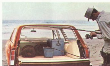
86 cu. ft. of load space with second seat folded down.