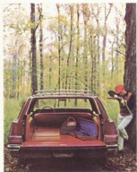
Load space so wide it takes 4' x 8' materials in an easy flat fashion.

□ Chevrolet's wide range of power teams makes real wagon news for '66. Standard, depending on the model, are a new 150-hp six and a 195-hp V8. Five more. You can order from the smooth new 220-hp V8 up to the new 425-hp V8. These transmissions mate up: a fully synchronized 3-Speed shift now standard or specify (depending on model) the Turbo Hydra-Matic with three fully automatic forward speeds; Overdrive; famous automatic Powerglide; or sporty 4-Speed.