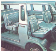
Roomy, comfortable Deluxe Sportvan, showing two removable rear seats facing forward.