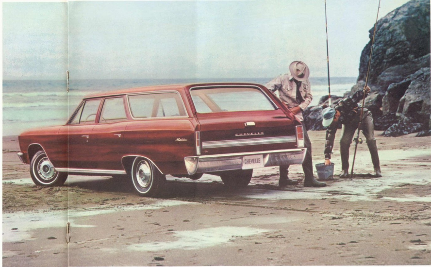
Malibu 4-Door 2-Seat Station Wagon in Aztec Bronze.