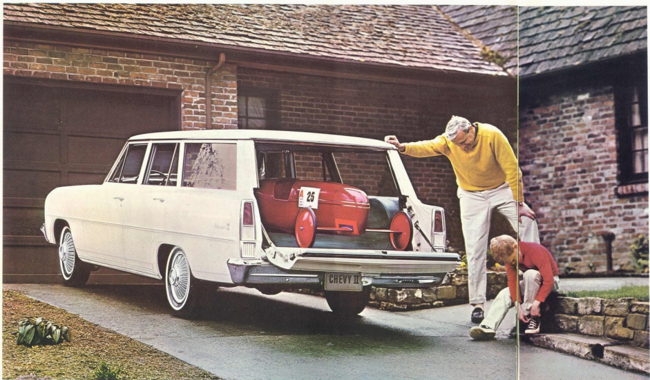
Nova 4-Door 2-Seat Station Wagon in Ermine White.