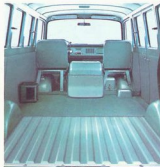
Big, long, wide, flat floor with wide-opening doors . . . can take nearly a ton in weight.

Shown in illustrations and covered in descriptions on these pages are some of the extra-cost Options and Custom Features for Sportvan models. A more complete list appears on page 15.