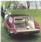
Caprice Custom Wagon in Madeira Maroon with carpeted cargo floor.