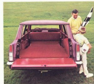
7-ft. cargo length from back of front seat to tailgate.