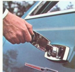
Crank-operated tailgate window on 2-seat wagons (power-operated on 3-seat).

belts front and rear (third seat, too), all-vinyl interiors, padded sun visors, backup and glove box lights, electric clock and power-operated tailgate window on the 3-seat wagon. Six interior colors are keyed to 15 exterior hues (six brand-new) and eight available two-tones. □ Impala wagon utility begins with wide-opening doors. Second seat folds flat in an easy manner; so does the third seat. A useful secret storage compartment is located under the rear cargo floor. The spare tire and wheel are carried upright in the right side panel wall. □ A great new comfort idea you can specify this year is the tilt-telescopic steering wheel. Rear window air deflectors are another, designed especially for wagons. Many more, of course. Make this your year to go wagoning in high style... Impala style. □ You may wish to personalize your new Impala wagon by ordering from the long list of moderately priced Options and Custom Features available. Some are shown on the car illustrations in this catalog, some are included in the descriptions. All of these are mentioned on page 14 of this folder.