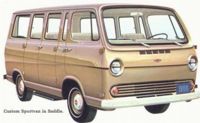
Custom Sportvan in Saddle.

Opens new doors to wagon-going pleasure for work or play.