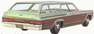
Shown on cover: Caprice 4-Door 3-Seat Custom Wagon in Sandalwood Tan.