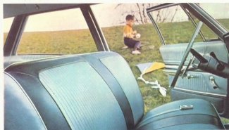
Bel Air Wagon Interior in Blue.

□ Cross country or across town, this wagon makes good traveling sense. In fact, any '66 Chevrolet wagon does. Consider the remarkable choice this year: Seven big Jet-smooth Chevrolet wagons. Whichever you choose, you get a sizable number of extra-value features that are common to all Chevrolet wagons. To point up a few: each has an all-vinyl interior, molded plastic cowl side panels, carpeted floors, blended-air heater and defroster, a refined ignition switch that isolates the accessory position, backup lights, two-speed glare-reducing windshield wipers and washer.