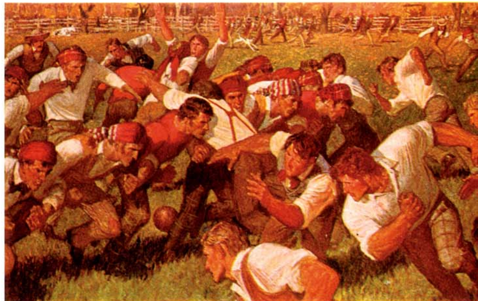
"The First Game." In early days, the object was to outshove and outclaw the foe. Strategy was simple. Survive.

The Greeks did it and called it harpaston . Roman soldiers copied the game, and Italians played it as calcio . England got it from the conquering Romans, and eventually produced two games: Association football ("soccer" from the