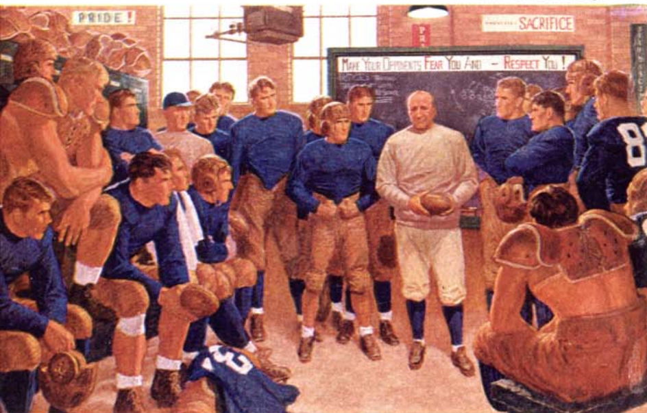
"Knute Rockne—The Coach." As the rules grew more sophisticated, men like Knute Rockne won their way to wide-spread fame.