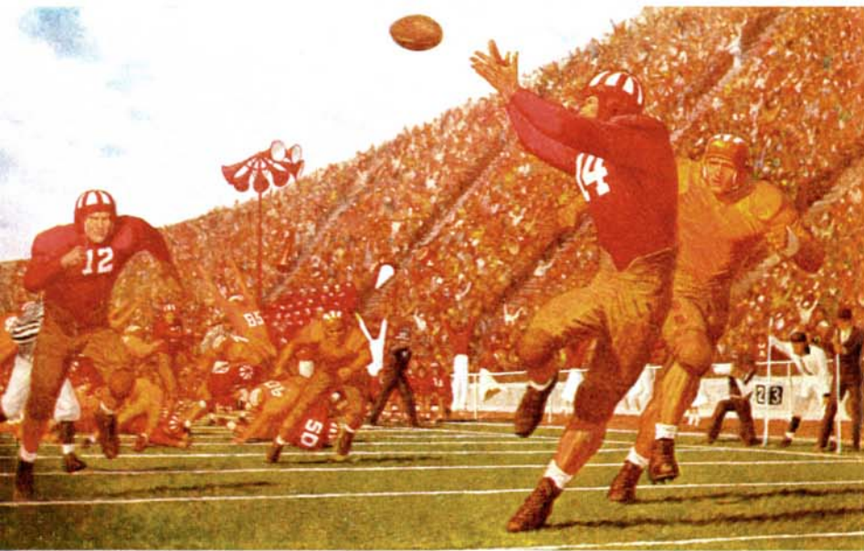
"Howell to Hutson—The Passing Game." Passing and receiving were to become refined arts, and no one ever caught quite like Don Hutson.