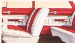
Colony Park station wagon interior shown in White and Red Crinkle-Grain vinyl—one of four all-vinyl combinations. Three vinyl and Shadow Weave fabric interiors are also available.