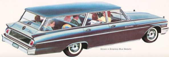
Shown in Empress Blue Metallic

Both Commuter models feature Mercury's new standard Super-Economy "6" that lets you go 15% farther on regular gas. As in all station wagon models, the chassis is pre-lubricated to go 30,000 miles without additional lubrication.