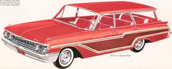
Shown in Signal Red

not over the tailgate. "Below-deck" mounting of station wagon spare tire conceals it beneath the hinged floor panel, yet it is easily accessible. Standard roll-down rear window is power operated by remote control from the driver's seat.