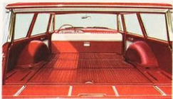
Extra-wide cargo opening, nearly two inches wider for '61, makes loading big cargo area easier than ever. Tailgate opens level with interior floor, giving you a smooth loading platform to slide cargo in or out. Easily-accessible spare tire is mounted out of the way, below hinged rear floor panel.