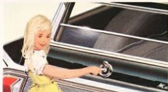
Roll-down back window lowers into the tailgate, adjusts easily and quickly to any height you wish. Completely replaces inconvenient lift-gate; provides continuous, flow-through ventilation for all passengers. Remote-control power operation standard on Colony Park models; operation is manual on Commuter models, with power optional.

Mercury gives you seven self-servicing features to help keep your station wagon newer, longer, cut your operating costs, and protect future resale value. Gone, for example, is much of the bother and expense of conventional "lube" jobs . . . the '61 Mercury chassis is pre-lubricated for the first 30,000 miles with sealed joints that are dirt-free, water-tight. Full-flow oil filter lets you drive 4,000 miles between oil changes under normal operating conditions. Mufflers are aluminized for double the life. Even the brakes are self-adjusting . . . save on periodic mechanical adjustments. Anti-rust-treated body, including galvanized rocker panels, protects itself. You save too, with self-cleaning spark plugs that conserve gasoline. And its long-lasting Super-Enamel finish never needs wax—yet keeps its showroom beauty longer.