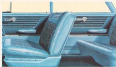
Commuter station wagon interior shown in Blue Crinkle-Grain vinyl and Blue Country Tweed fabric—one of three such combinations. Four all-vinyl interiors are optional at slight extra cost.