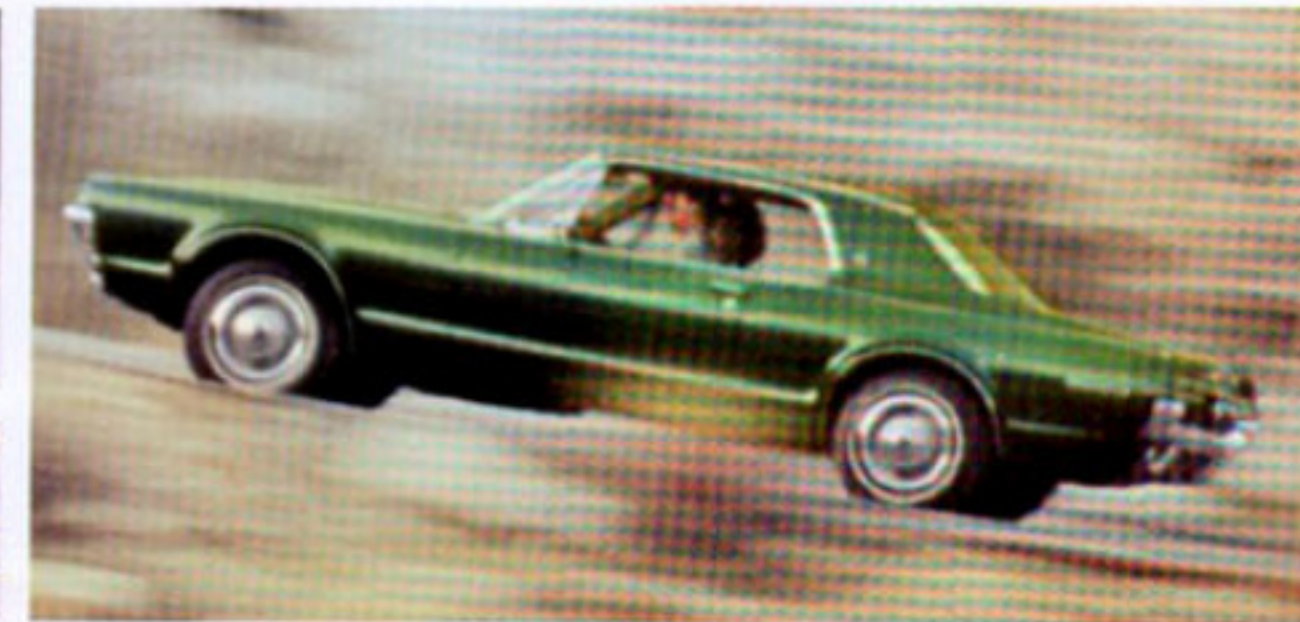
Spirited, sports car performance is very much a part of the Cougar personality with the Cougar 289 V-8 standard.