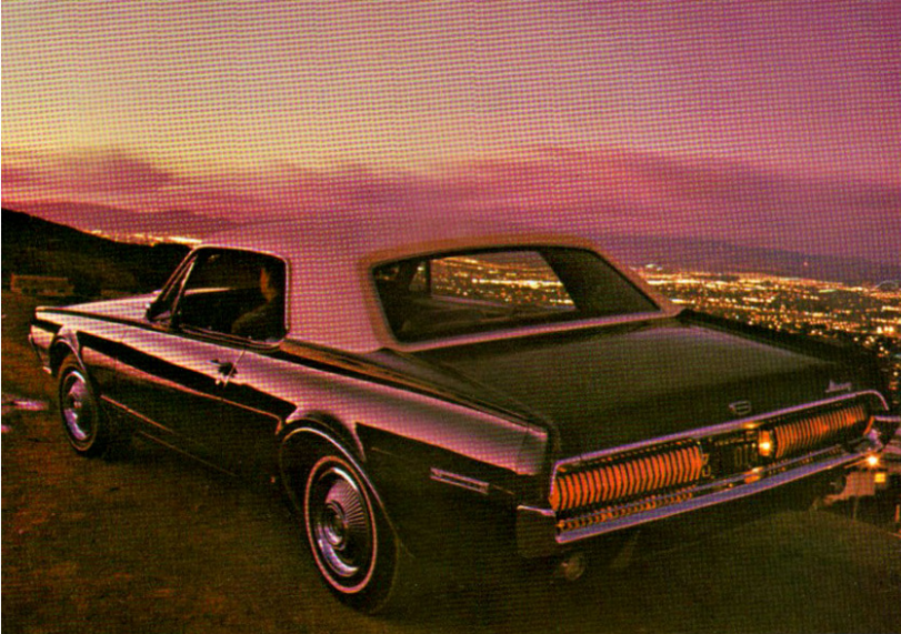
Cougar shown with optional vinyl-covered Oxford Roof.