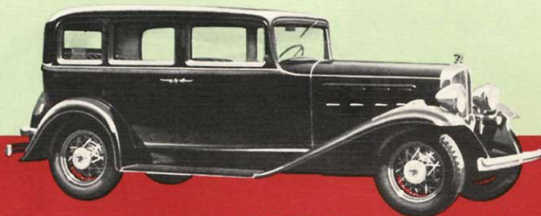
THE NEW PONTIAC SIX

You owe it to yourself to keep abreast of the latest developments in performance, beauty, comfort, safety and economy in automobiles. Take the wheel of the new Pontiac Six and discover how much its new, modern features add to the pleasure of motoring. Or if you want to know the extra thrill of brilliant V-Eight performance, drive the Pontiac V-Eight. In either case, you will appreciate why Pontiac is known as Chief of Values for 1932.