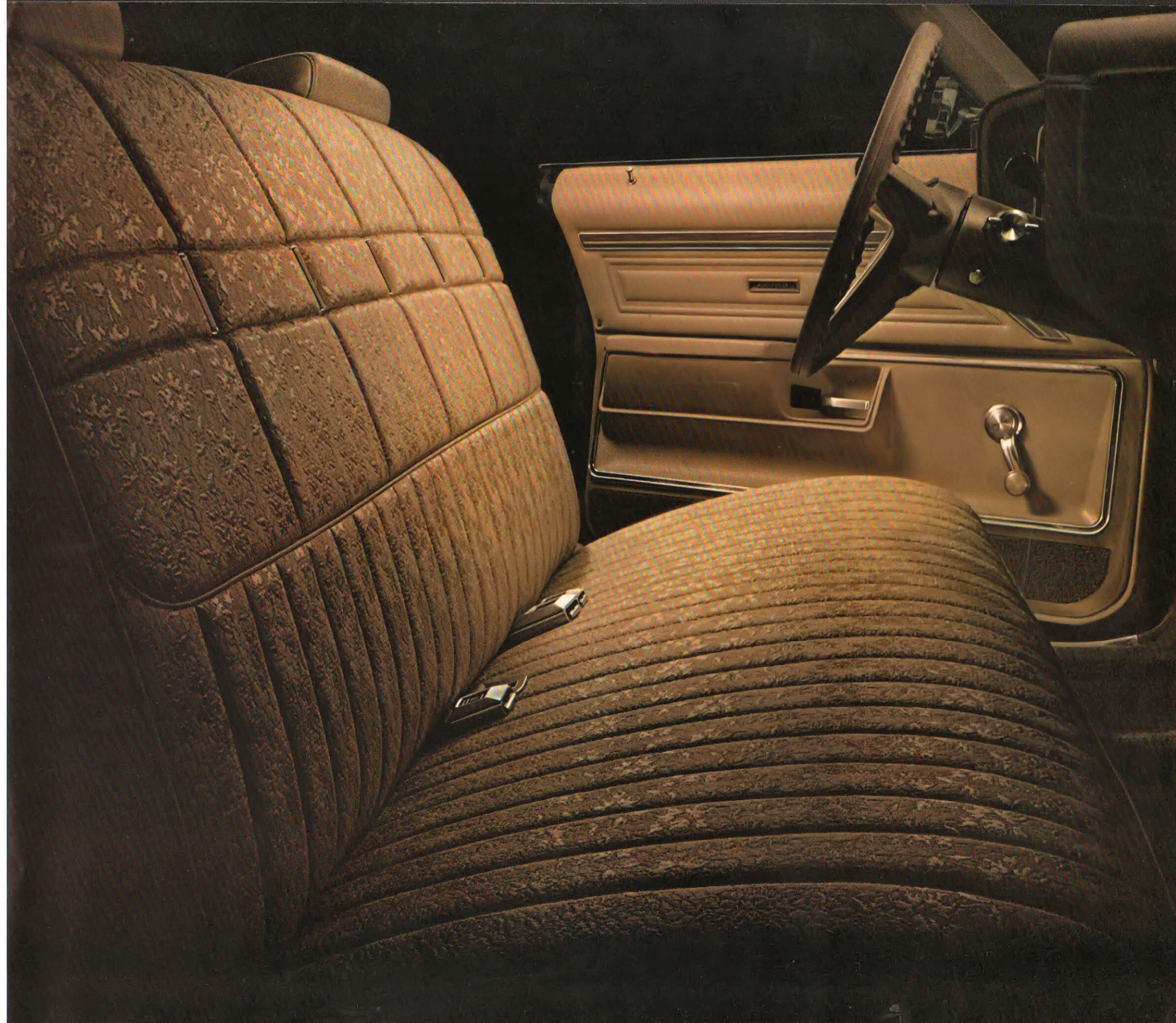
Cloth upholstery trimmed in Morrokide. Shown in beige—also available in blue and green.