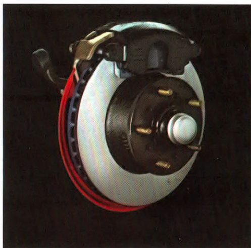
Bonneville's standard power front disc brakes.