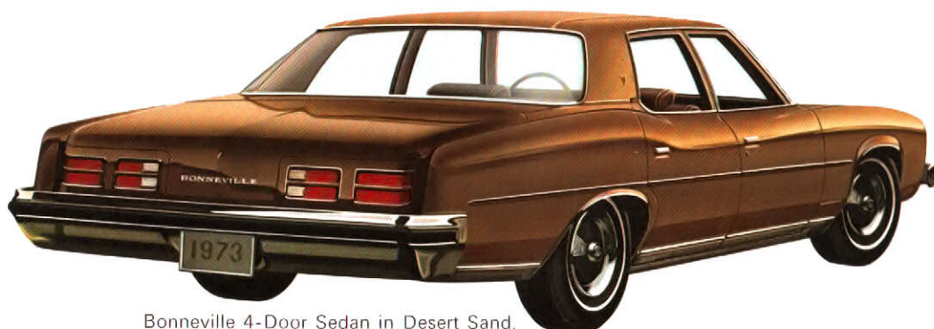
Bonneville 4-Door Sedan in Desert Sand.

Pontiac Motor Division, General Motors Corporation. One Pontiac Plaza, Pontiac, Michigan 48053.