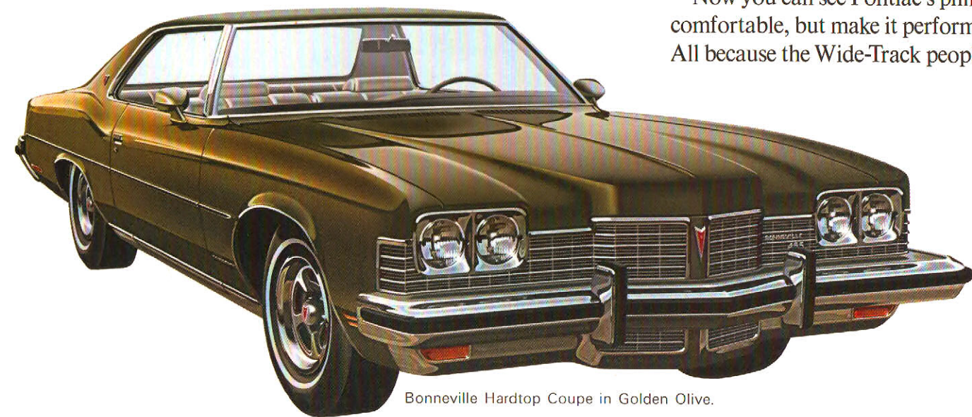
Bonneville Hardtop Coupe in Golden Olive.

Now you can see Pontiac's philosophy for Bonneville. Make it comfortable, but make it perform. It's a philosophy that works. All because the Wide-Track people have a way with cars.