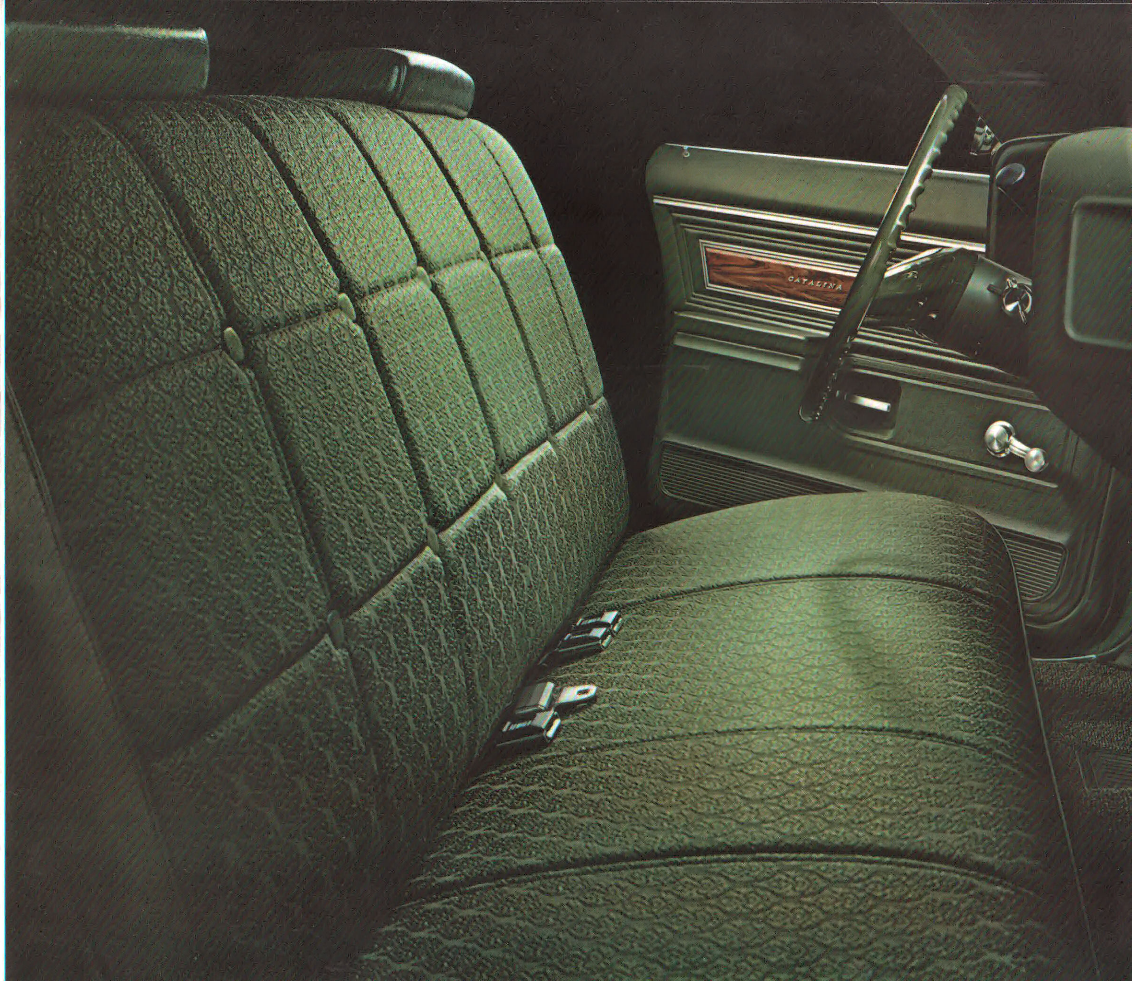
Cloth upholstery trimmed in Morrokide. Shown in green—also available in blue, black and beige.