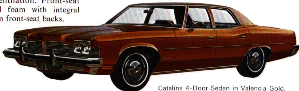
Catalina 4-Door Sedan in Valencia Gold.

Variable-ratio power steering. Power brakes with front discs/rear drums. G78—15 black sidewall glass-belted tires. 4-wheel, coil-spring suspension. Computer-selected springs. Improved body mount system. Added acoustical insulation. New engine mount insulation.