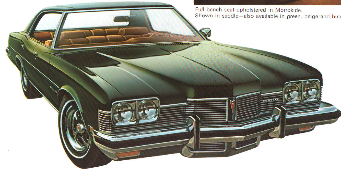
Catalina 4-Door Hardtop in Brewster Green.