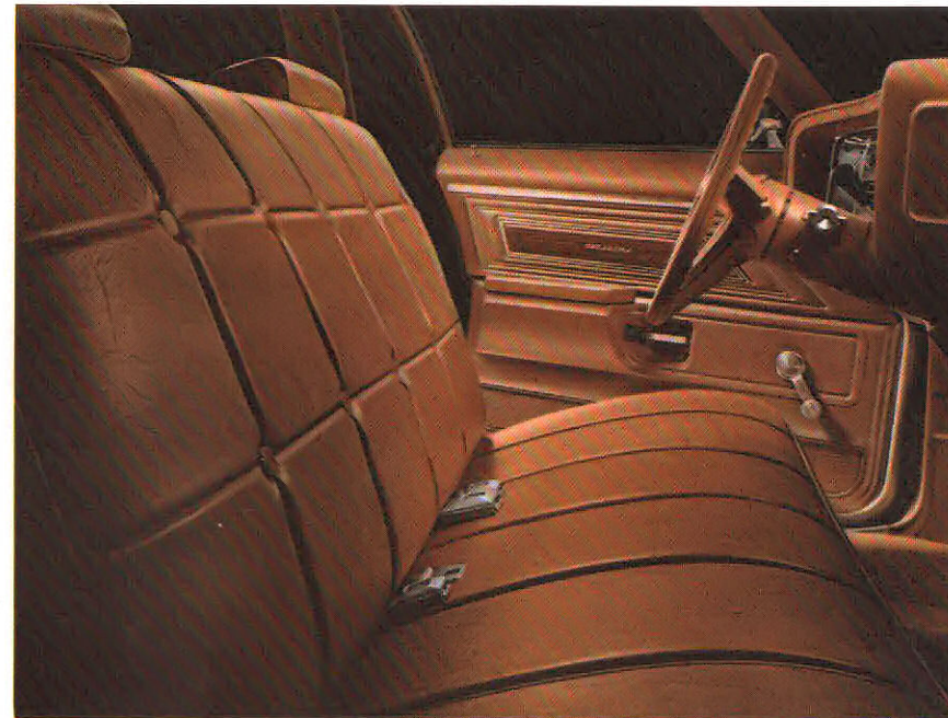
Full bench seat upholstered in Morrokide. Shown in saddle—also available in green, beige and burgundy.

Knowing we put all that in our lowest priced full-sized car should help you understand Pontiac's way with cars. It should also help you understand why Catalina's our most popular Pontiac.