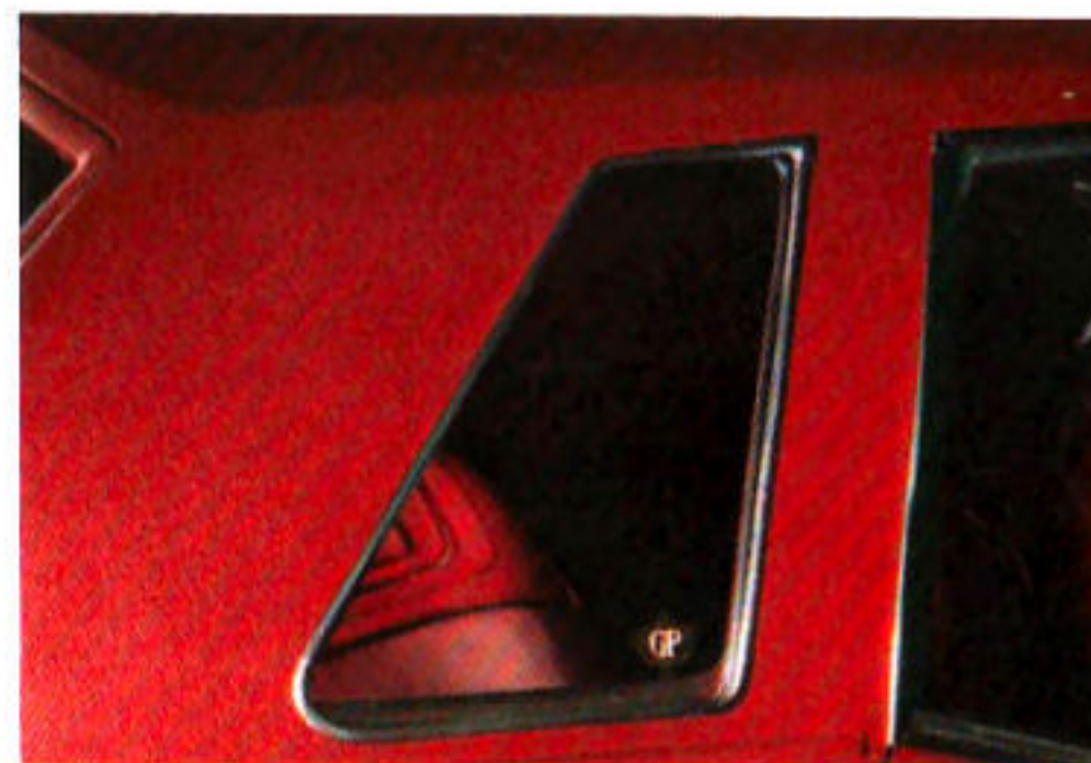
Grand Prix rear quarter window.