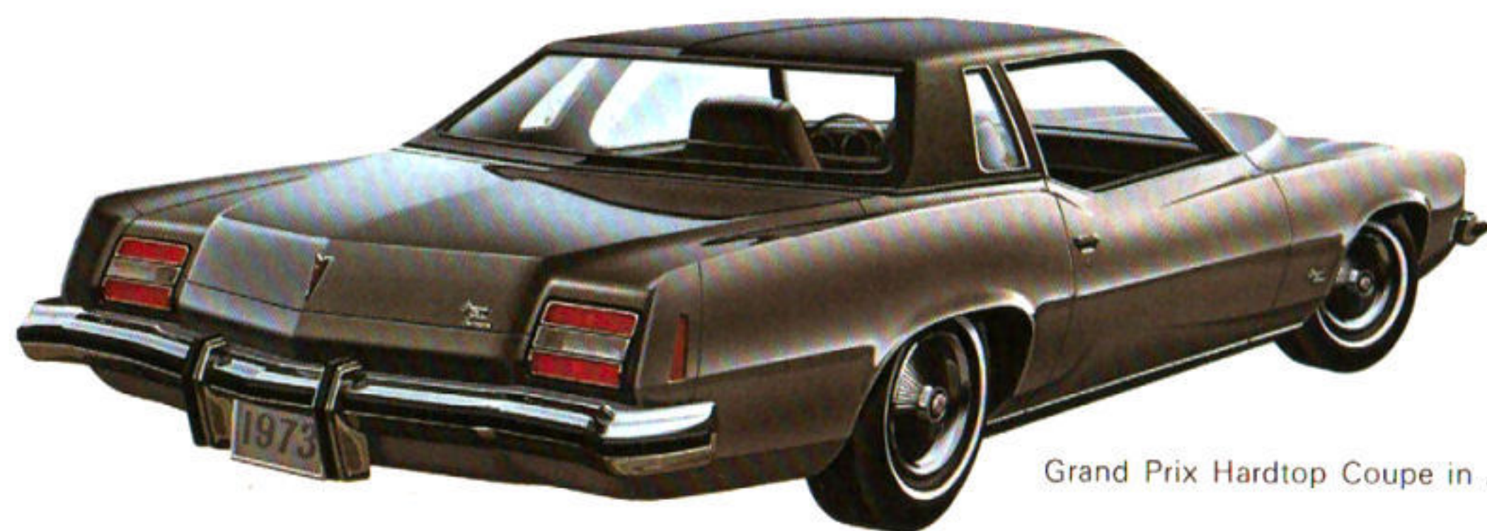
Grand Prix Hardtop Coupe in Ascot Silver.

New improved front and rear bumpers. Wide rocker panel moldings with black accents. Formal roof line with monogrammed rear quarter windows. Longer doors for easier entry. Deluxe wheel covers. Windshield radio antenna. Concealed wipers. Bright moldings on roof, windshield, quarter window, rear window, windowsill, hood rear edge and wheel openings.