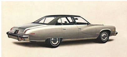
Catch a likeness to more expensive luxury sedans? It's the Grand LeMans 4-Door Colonnade Hardtop Sedan.