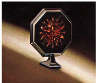
The crowning touch. Grand LeMans' distinctive new spring-loaded stand-up hood ornament.