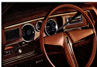
Instrument panel with available new fuel economy gauge. It can help you save power and gain economy.

Distinctive new grille, hood ornament and tail lamp styling. Body colored door handle inserts. Deluxe wheel covers. Formal rear quarter windows on 2-door. Parking lamps in grille.