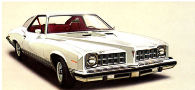
Add the GT option and get the sportiest LeMans Coupe or Sport Coupe (shown above) going this year.