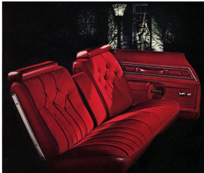
Sort of makes you feel right at home. Grand LeMans' standard cloth and Morrokide notchback seat. Shown in burgundy—also available in saddle and blue.

LeMans means quality. And sportiness. And value. But this year, it also means an elegant new top-of-the-line mid-sized car ... Grand LeMans.