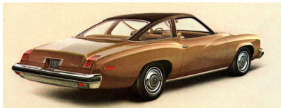
LeMans 2-Door Colonnade Hardtop Coupe, featuring the available new cordovan vinyl top.