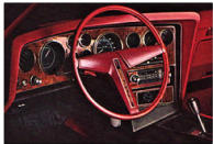
Looking for something? With this new cockpit-style instrument panel, everything's at a moment's glance. Shown with available rally gauge cluster.