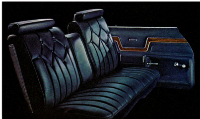
Your new LeMans 4-Door will become very luxurious by ordering this cloth and Morrokide custom full-width notchback seat with pull-down center armrest. Shown in blue—also available in saddle, green and burgundy.

We put a lot into our lowest priced 1975 LeMans. And made it one of the best LeMans values ever to come down the pike.