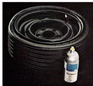
Available space-saver spare tire. It really does.