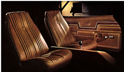
These bucket seats are standard on LeMans Sport Coupe. Shown sitting tall in saddle—also available in black, white, blue, green and burgundy.