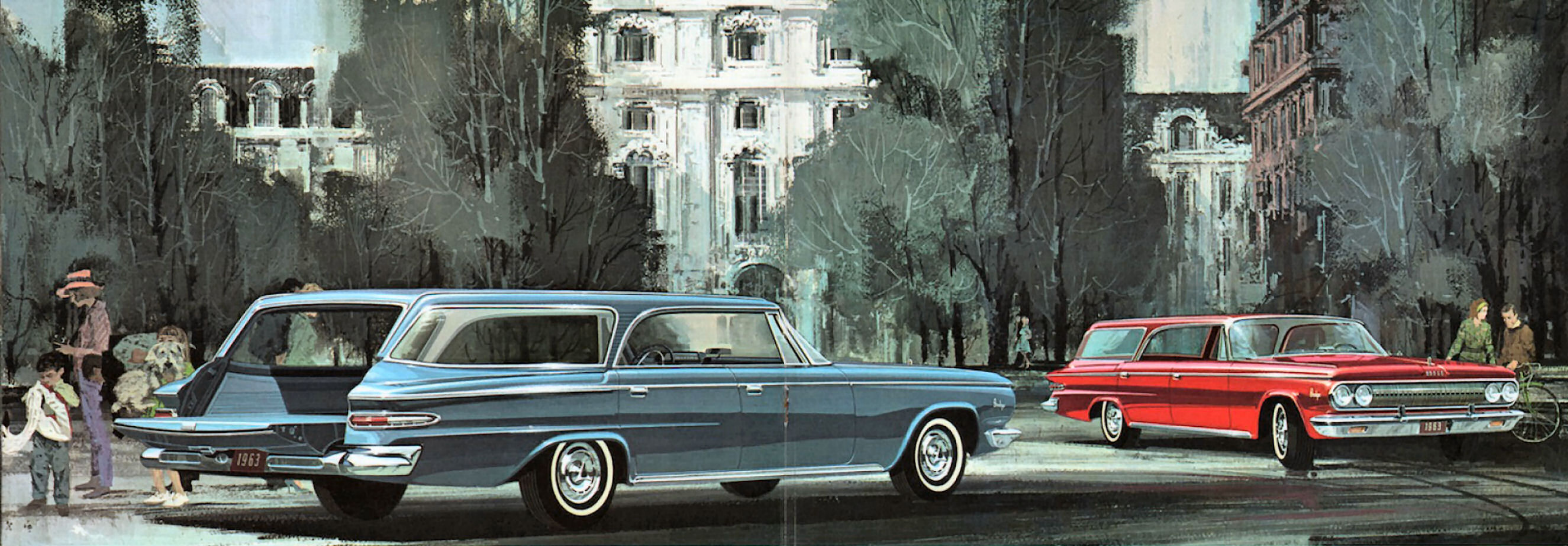
CUSTOM 880 8-PASSENGER STATION WAGON