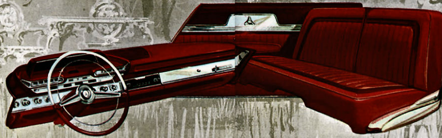
CUSTOM 880 INSTRUMENT PANEL