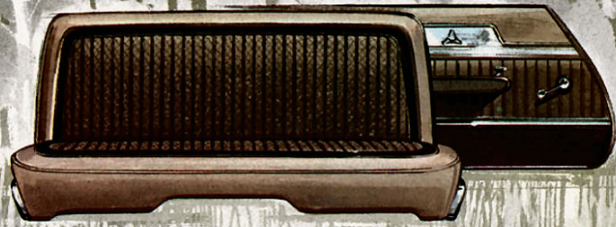
CUSTOM 880 CLOTH AND VINYL TRIM