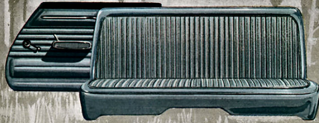
DODGE 880 CLOTH AND VINYL TRIM

THE BIG AUTOMOBILE WITH A STRONG SENSE OF VALUE! The luxury of the big Dodge is available in two elegant series for '63: Dodge 880 and Dodge Custom 880. In size and mechanical equipment they are practically identical. The wheelbase is a long, road-smoothing 122 inches. Overall length is almost 18 feet. The spacious interiors accommodate comfortable chair-high seats that let you sit up and take notice or stretch out and relax as you see fit. The most significant series differences are found in interior trim designs (illustrated above).