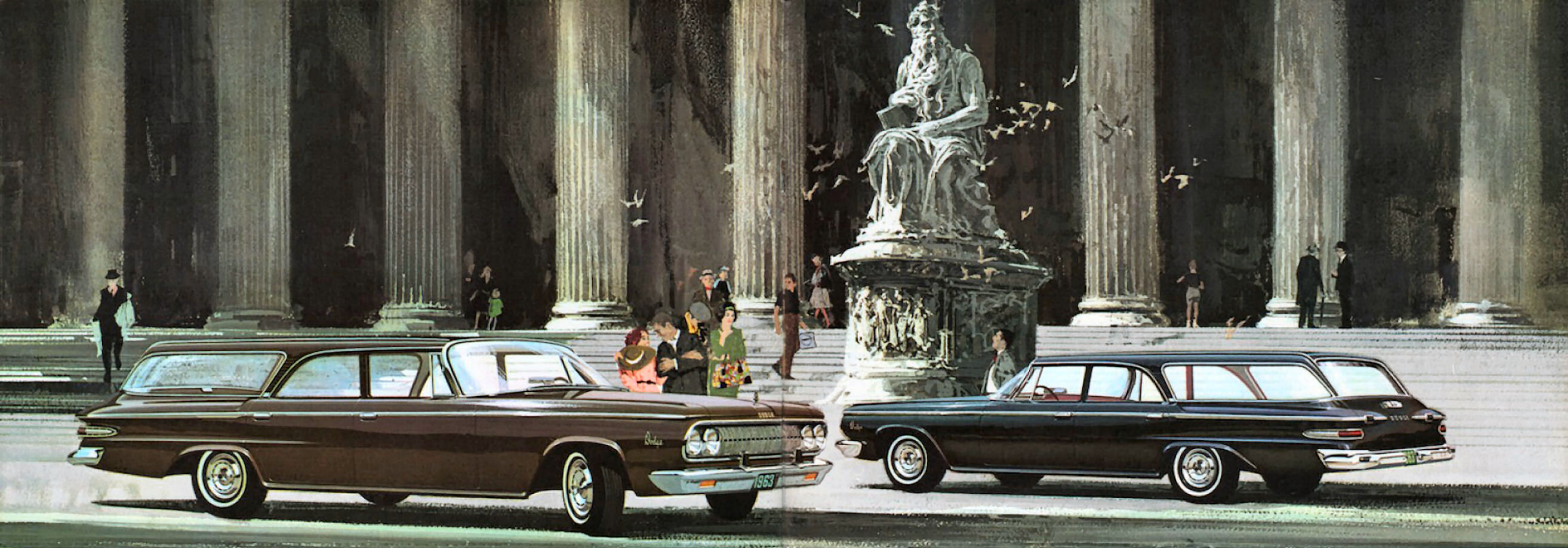
DODGE 880 4-DOOR HATCHBACK WAGON