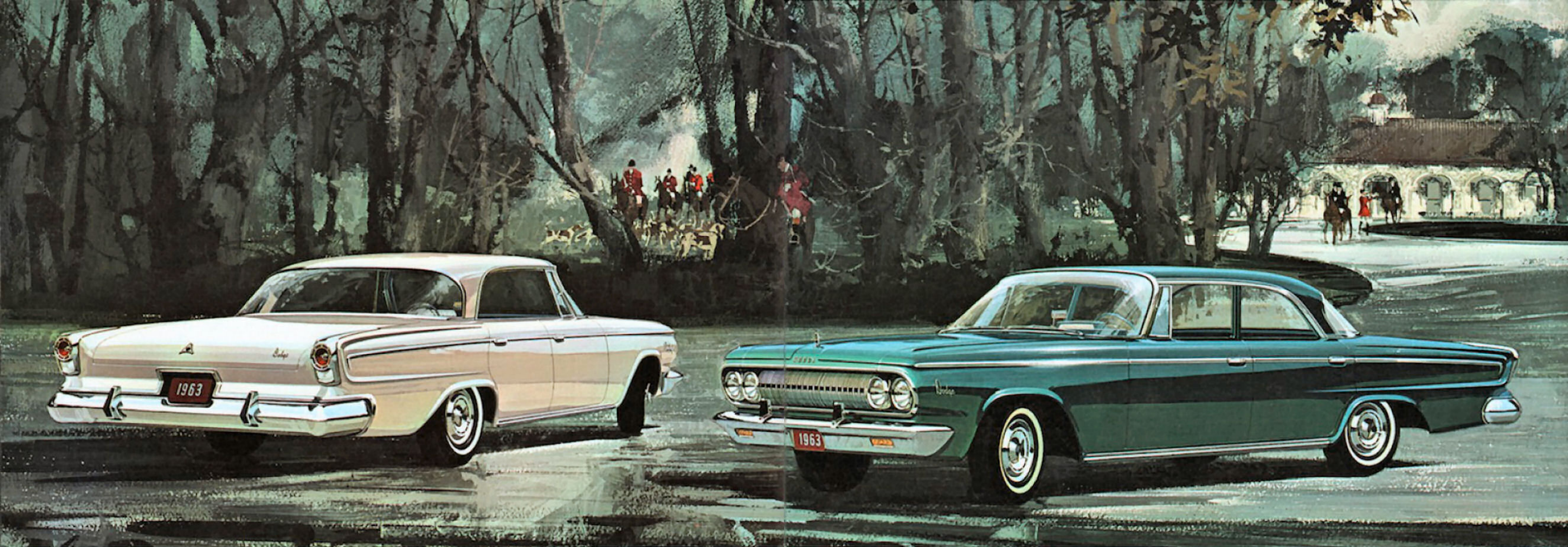
CUSTOM 880 4 DOOR HARDTOP