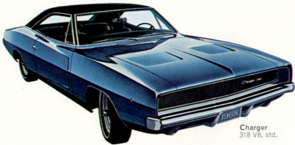
Charger 318 V8, std.