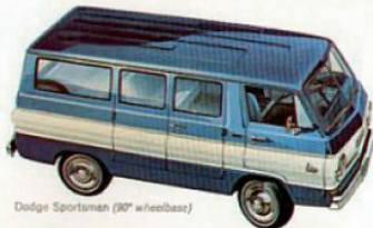
Dodge Sportsman (90" wheelbase)