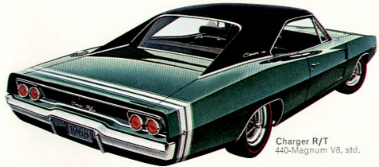
Charger R/T 440-Magnum V8, std.