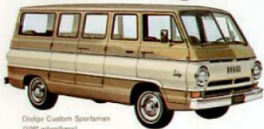
Dodge Custom Sportsman (108" wheelbase)