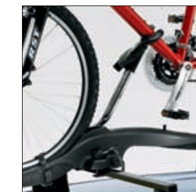
You won't have to remove your bike's front wheel to use this lockable bike carrier.