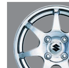
Inspire true rally looks with Suzuki Works Techno (SWT) aluminum-alloy wheels. Available in gunmetal, white and chrome.