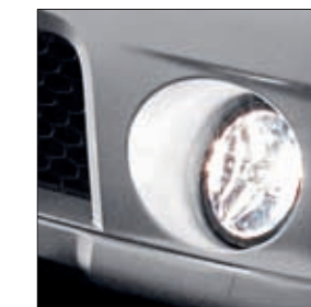
Fog lamps help give you more visibility and make you more visible to the other drivers on that misty or rainy road.