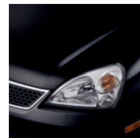
Black Onyx Pearl ●