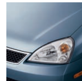
Ice Blue ●