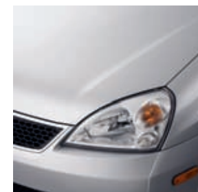
Silky Silver Metallic ●

See your Suzuki dealer for a full lineup of accessories to add to your ride. Make sure to go to suzukiauto.com for the latest specification information.