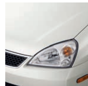
White Pearl ●●