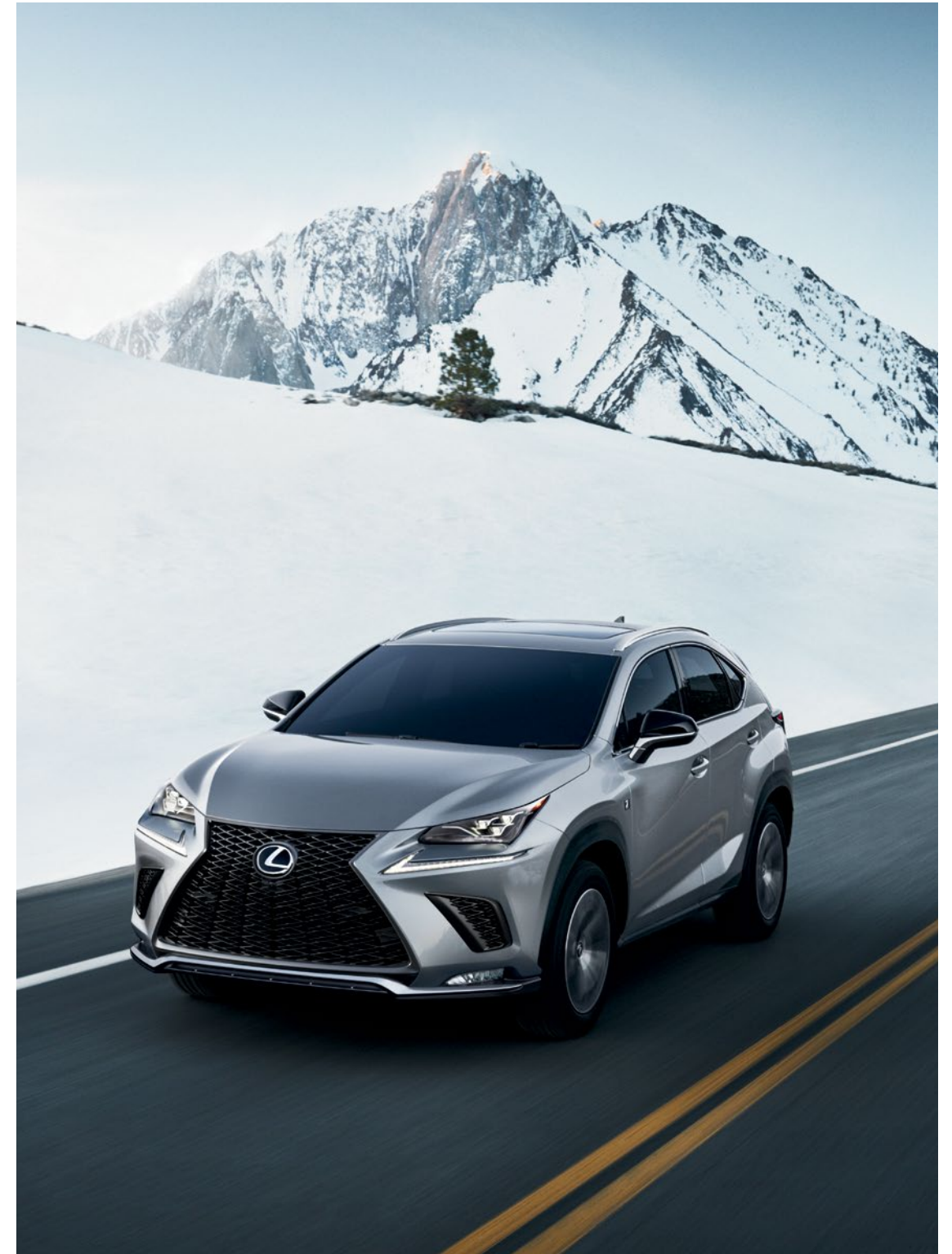
NX F SPORT shown in Atomic Silver