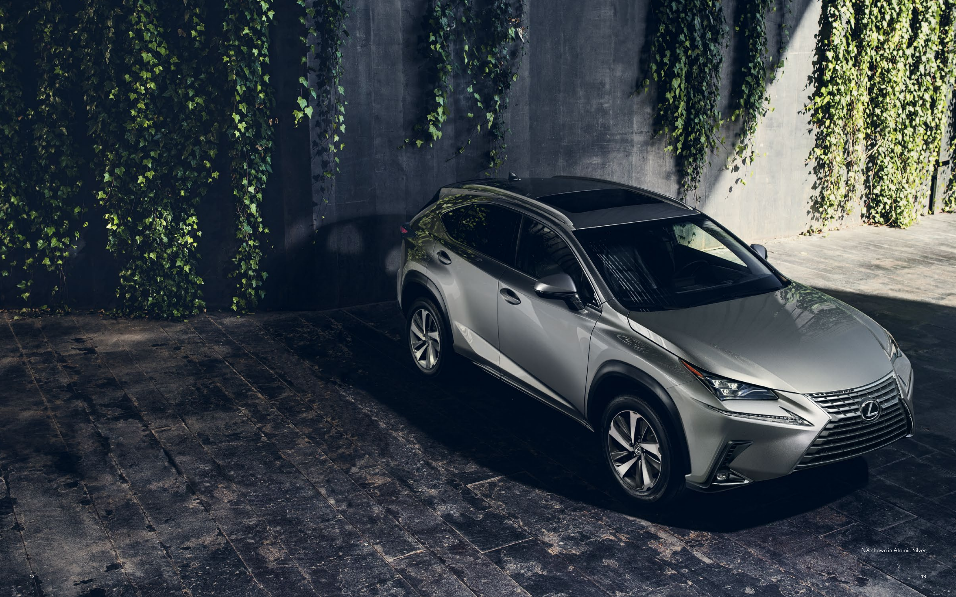
NX shown in Atomic Silver.