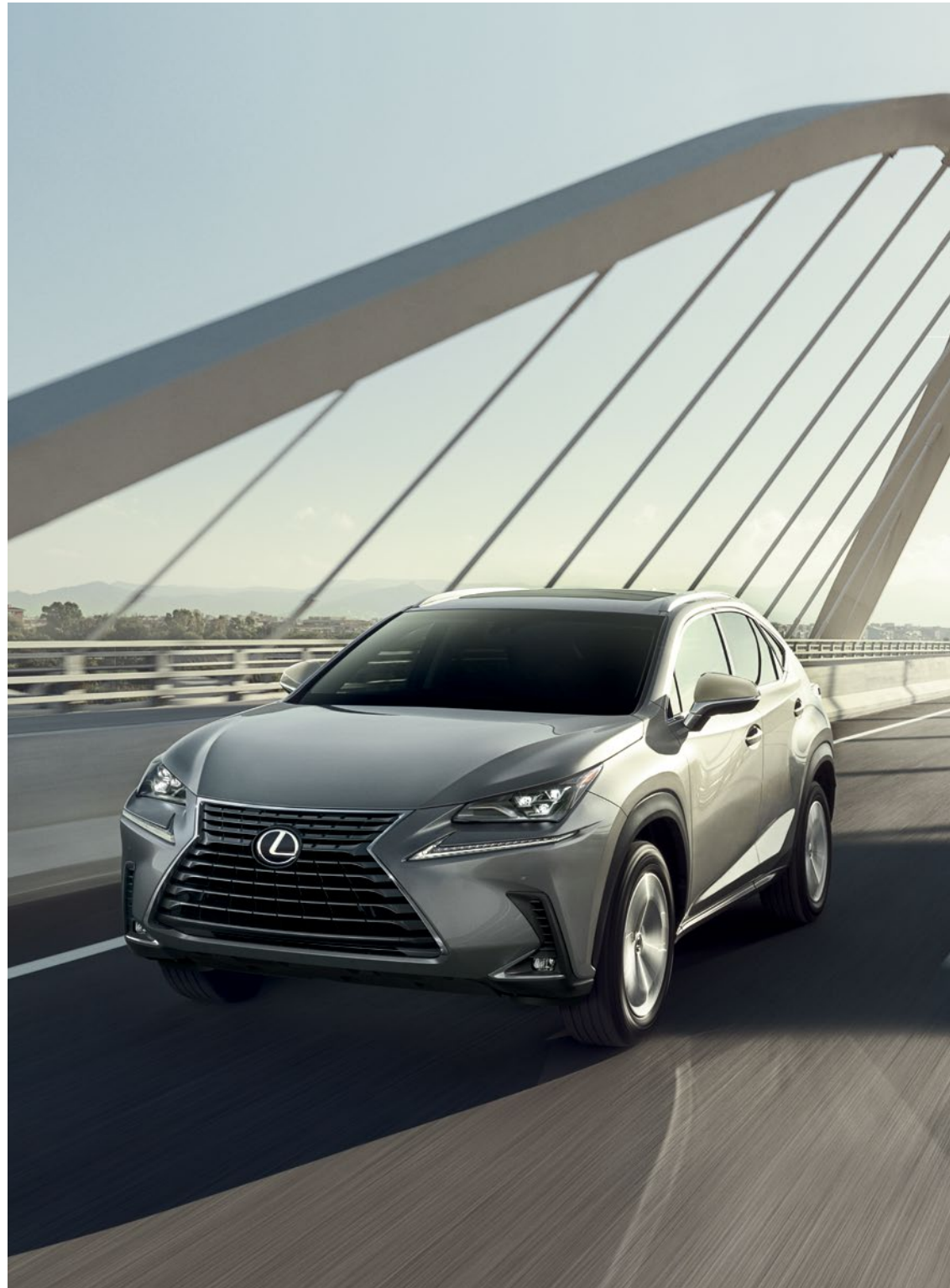
NX shown in Atomic Silver