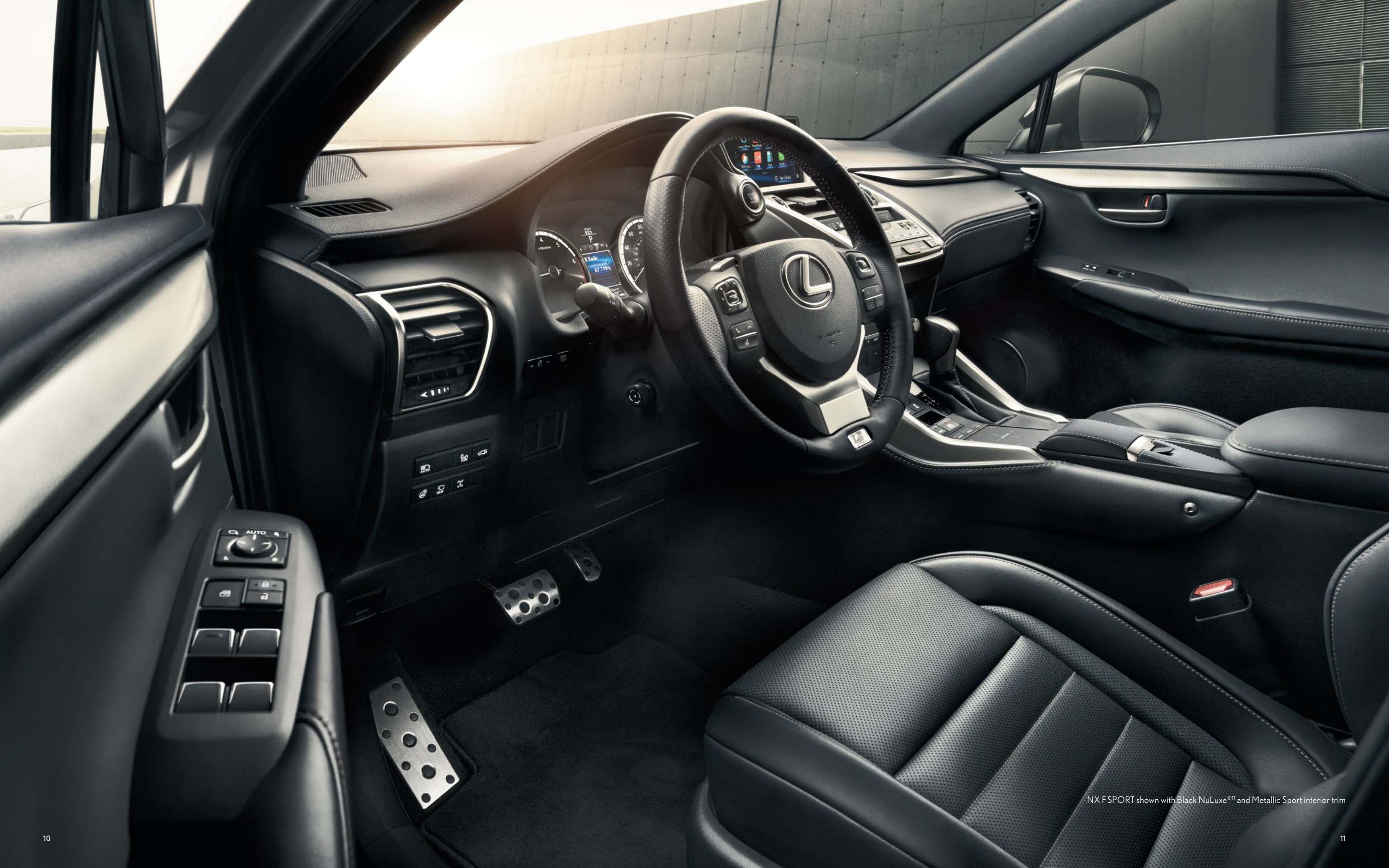
NX F SPORT shown with Black NuLuxe SM and Metallic Sport interior trim