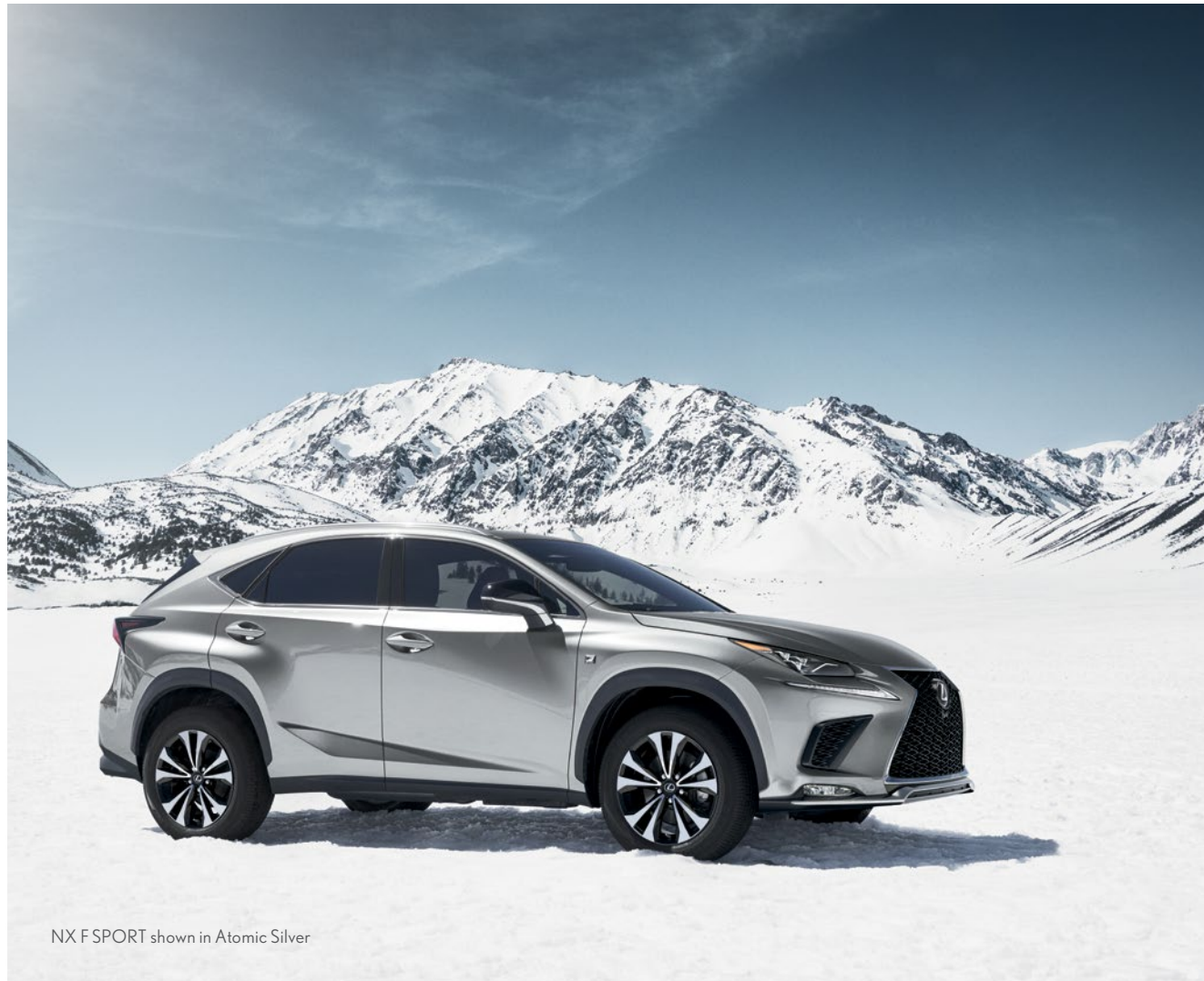
NX F SPORT shown in Atomic Silver

The NX F SPORT doesn't just look the part—it feels it. From its aggressive exterior styling to deeply bolstered front sport seats that hug you through the turns, this luxury crossover brings exhilaration to every drive. Circuit Red NuLuxe ®11 and new Arctic White NuLuxe interior trims boldly reflect its performance roots. And impeccable contrast stitching completes the experience of pure invigoration for all the senses.