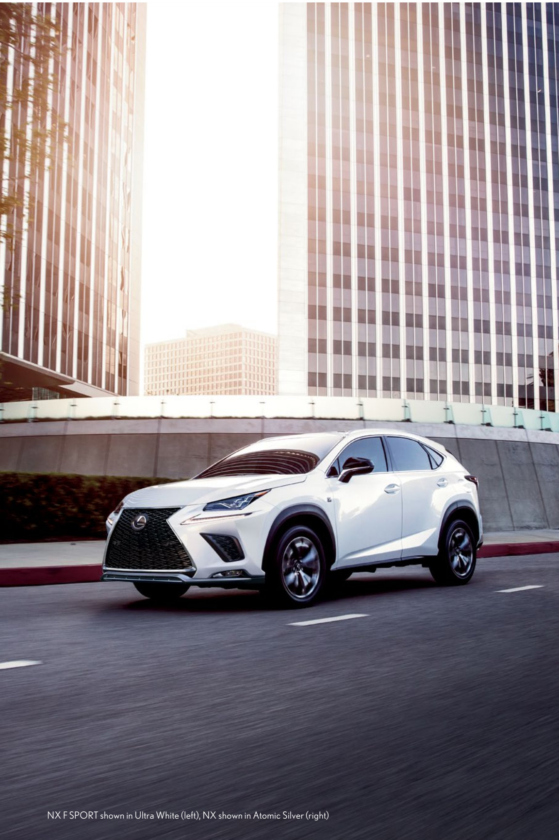
NX F SPORT shown in Ultra White (left), NX shown in Atomic Silver (right)