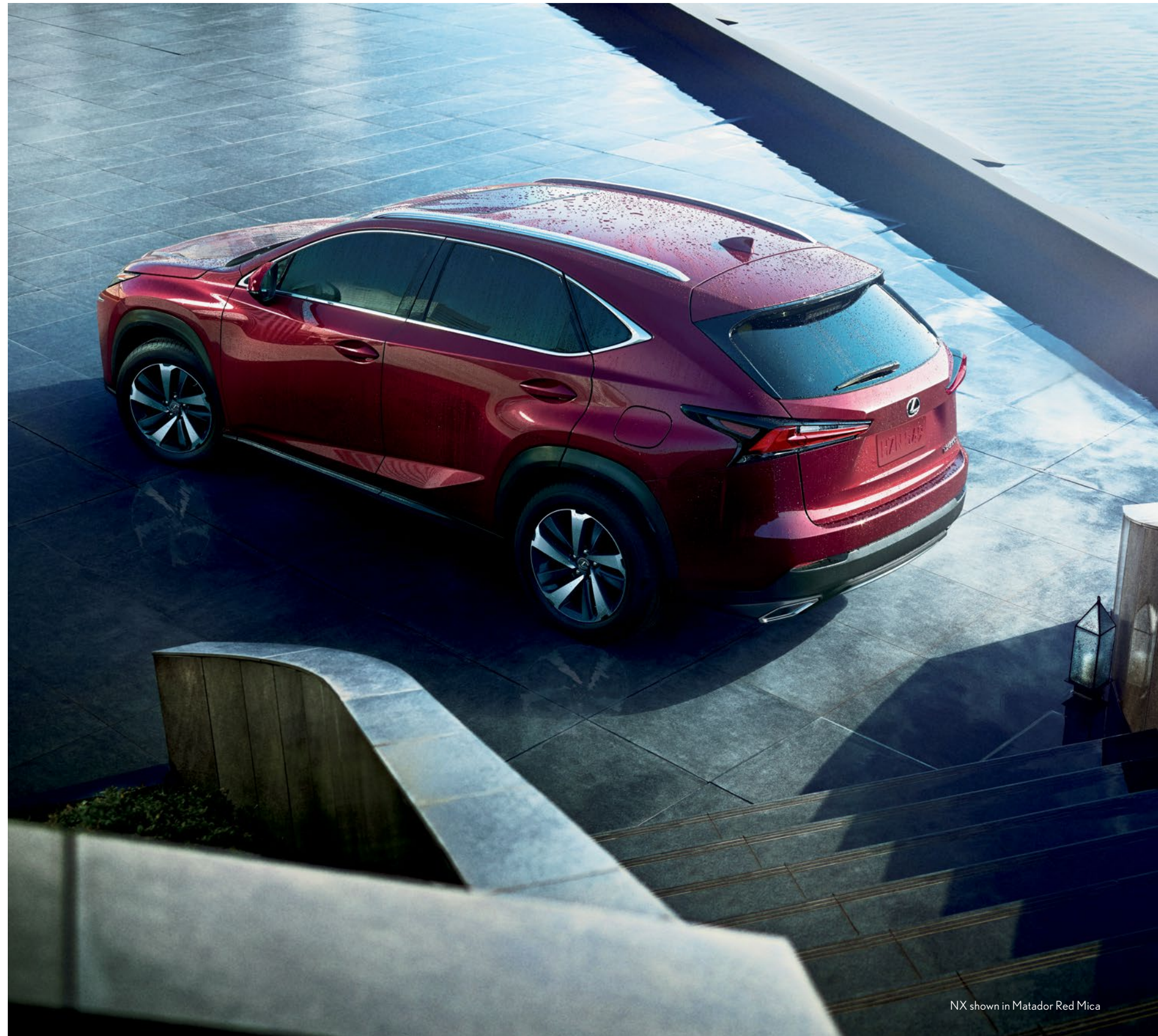
NX shown in Matador Red Mica

Split-five-spoke alloy wheels with Gloss Black and machined finish and all-season tires 14 NX F SPORT