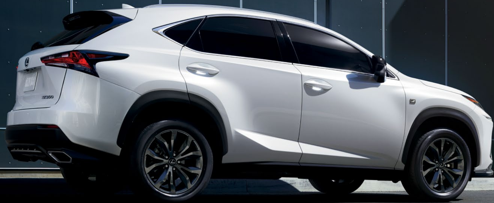
NX F SPORT shown in Ultra White