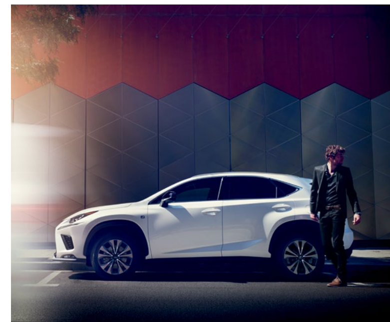
NX F SPORT shown in Ultra White

Multifaceted LED illumination puts scintillating design in razor-sharp focus.