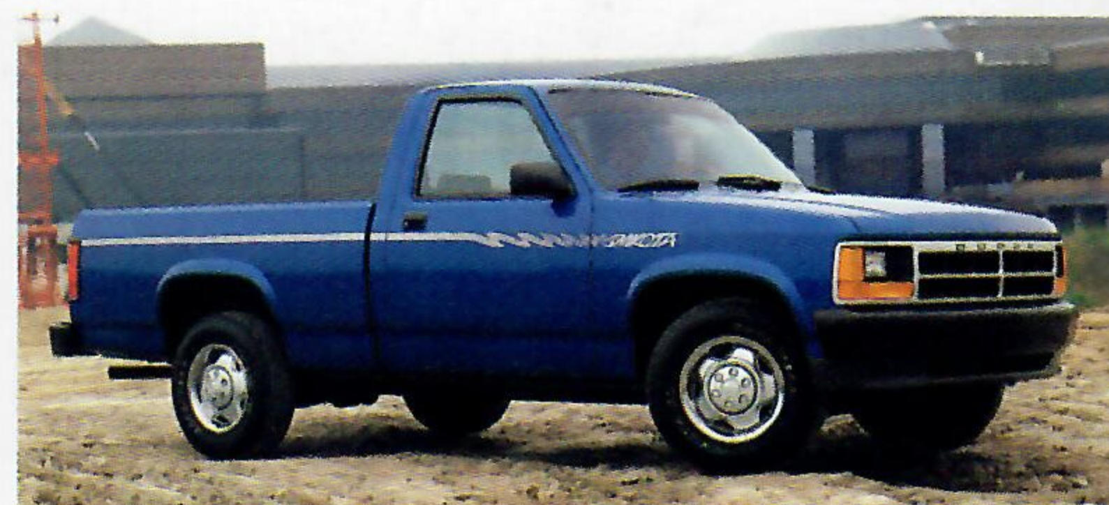
The Dakota "S," shown in Electric Blue Clear Coat, offers rugged pickup performance at a low base price.

Consult your dealer for information regarding necessary equipment and driveline combinations for proper trailer towing applications.