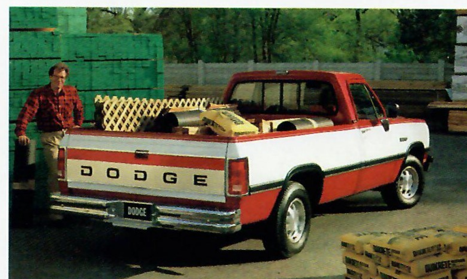
The Ram 150 LE 4x2, shown in Colorado Red Clear Coat and Bright White Clear Coat.

More payload. Dodge Ram Pickup is America's hardest working full-size pickup with a higher base payload than any of its 1/2-, 3/4-, or one-ton comparable two-wheel drive Regular Cab competitors.