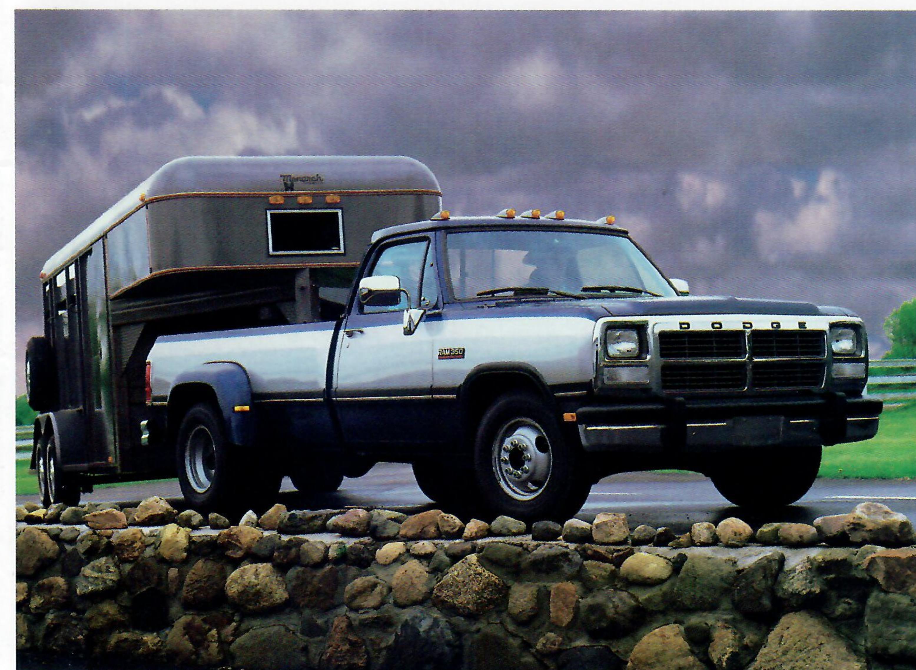
The Ram 350 LE Dually is shown in Dark Spectrum Blue Metallic Clear Coat and Silver Star Metallic Clear Coat.