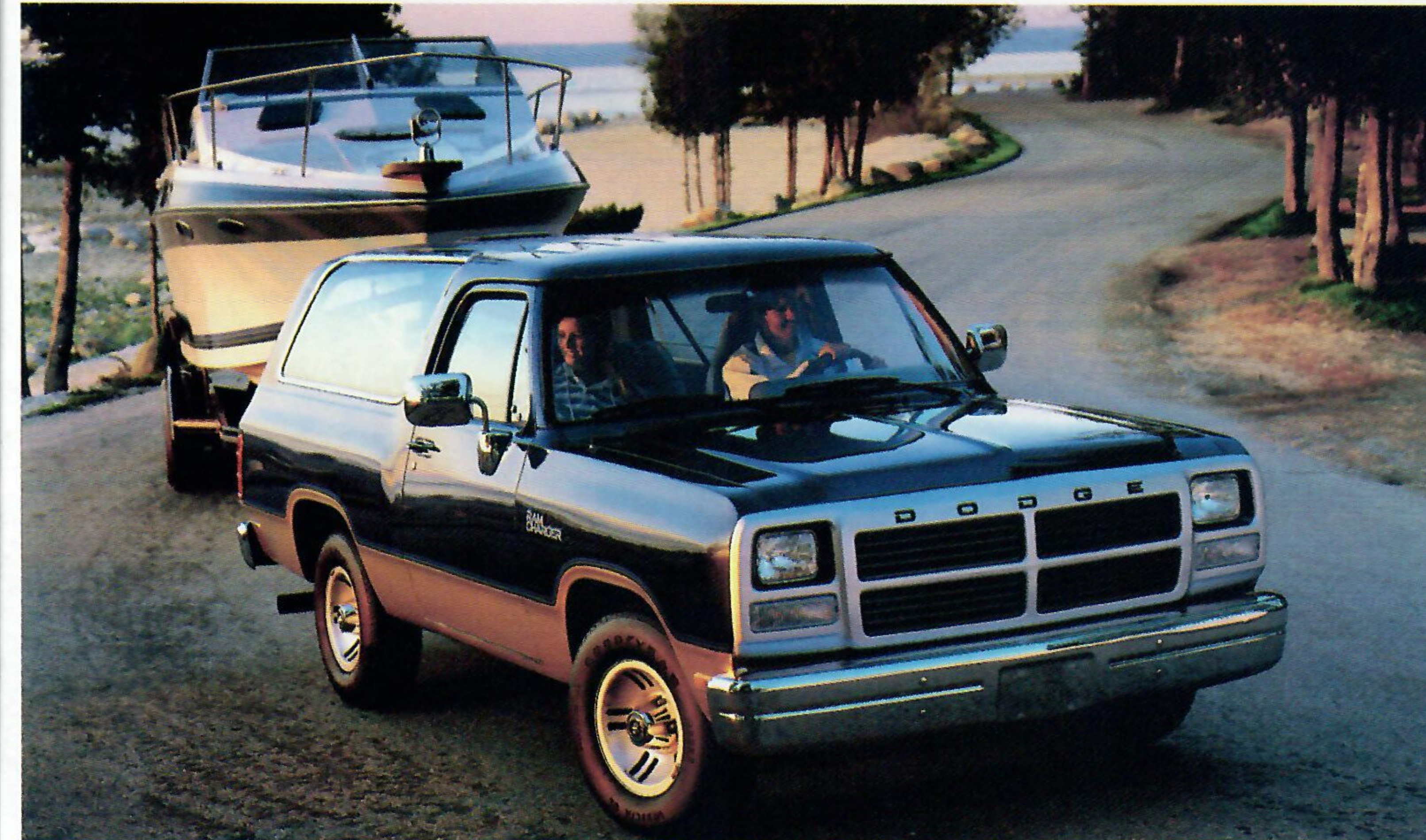
The Ramcharger 4x2, shown in Dark Spectrum Blue Metallic Clear Coat and Sand Metallic Clear Coat.

More value. Dodge Ramcharger offers a choice of two new Customer-Preferred Advantage Packages that provide big discounts on valuable equipment and allow you to tailor your sport utility to your specific needs.