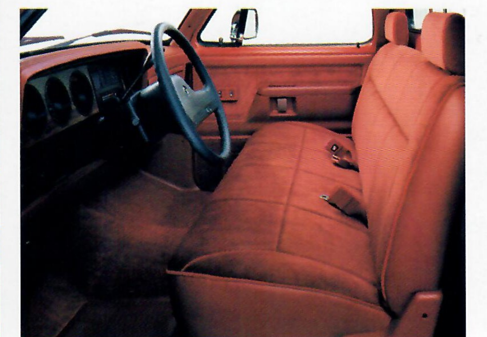
The Ram 150 LE Regular Cab interior, shown in Crimson Red, features a cloth-and-vinyl-trim bench seat.