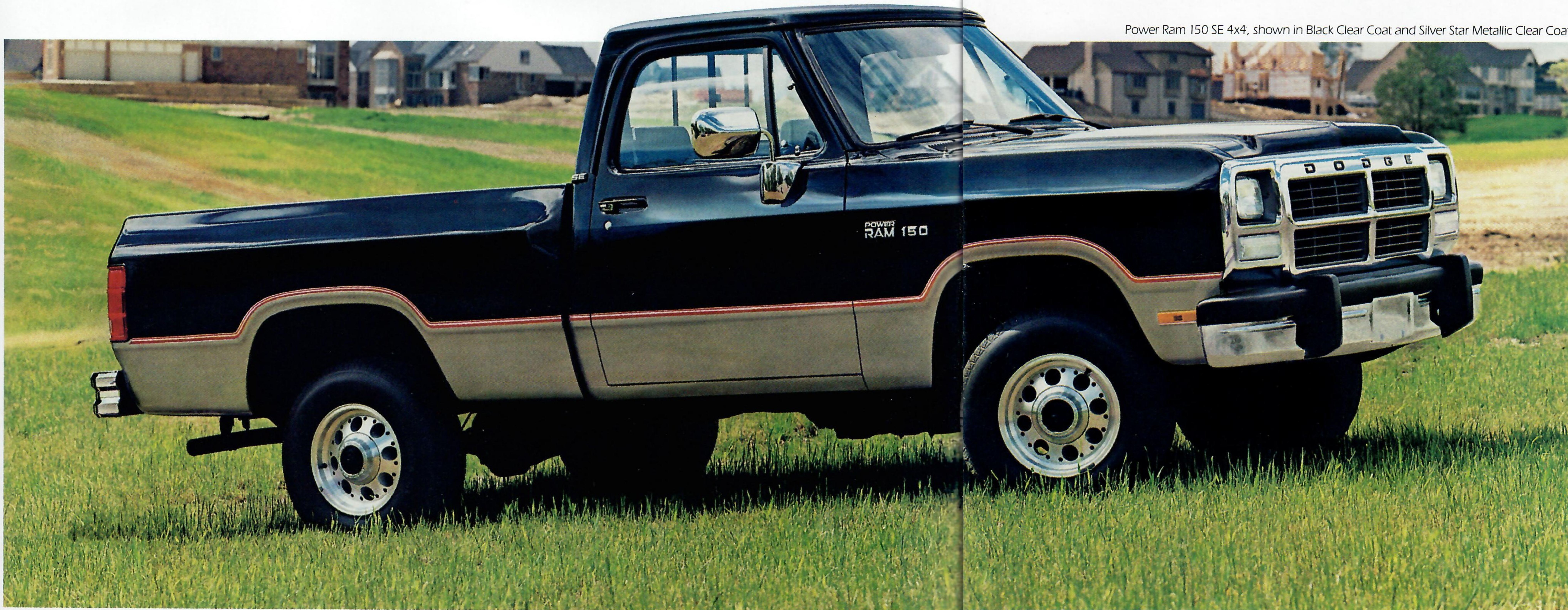
Power Ram 150 SE 4x4, shown in Black Clear Coat and Silver Star Metallic Clear Coat.