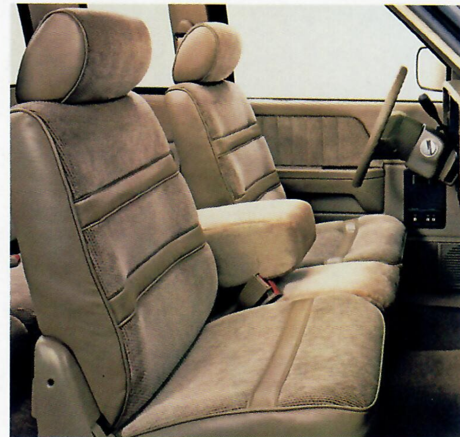
The Dakota LE Club Cab interior, shown in Tundra, features a 60/40 split bench seat.

Longer warranty. Backed by Dodge's 7/70 Power Train and 7/100 Anticorrosion Limited Warranties,** Dakota offers the longest standard warranty protection of any pickup truck.