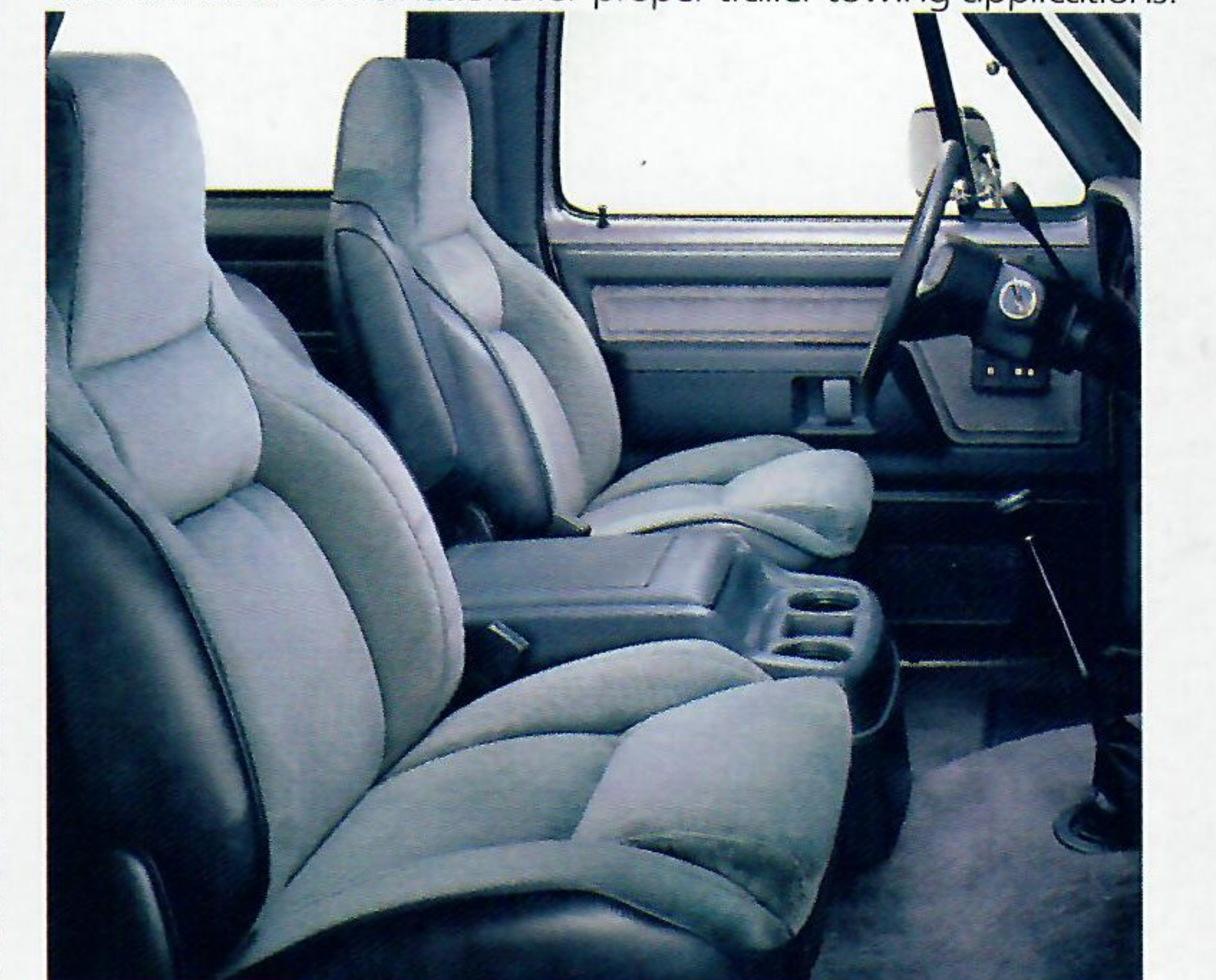
The Ramcharger LE interior, shown in Charcoal.

Consult dealer for information regarding necessary equipment and driveline combinations for proper trailer towing applications.