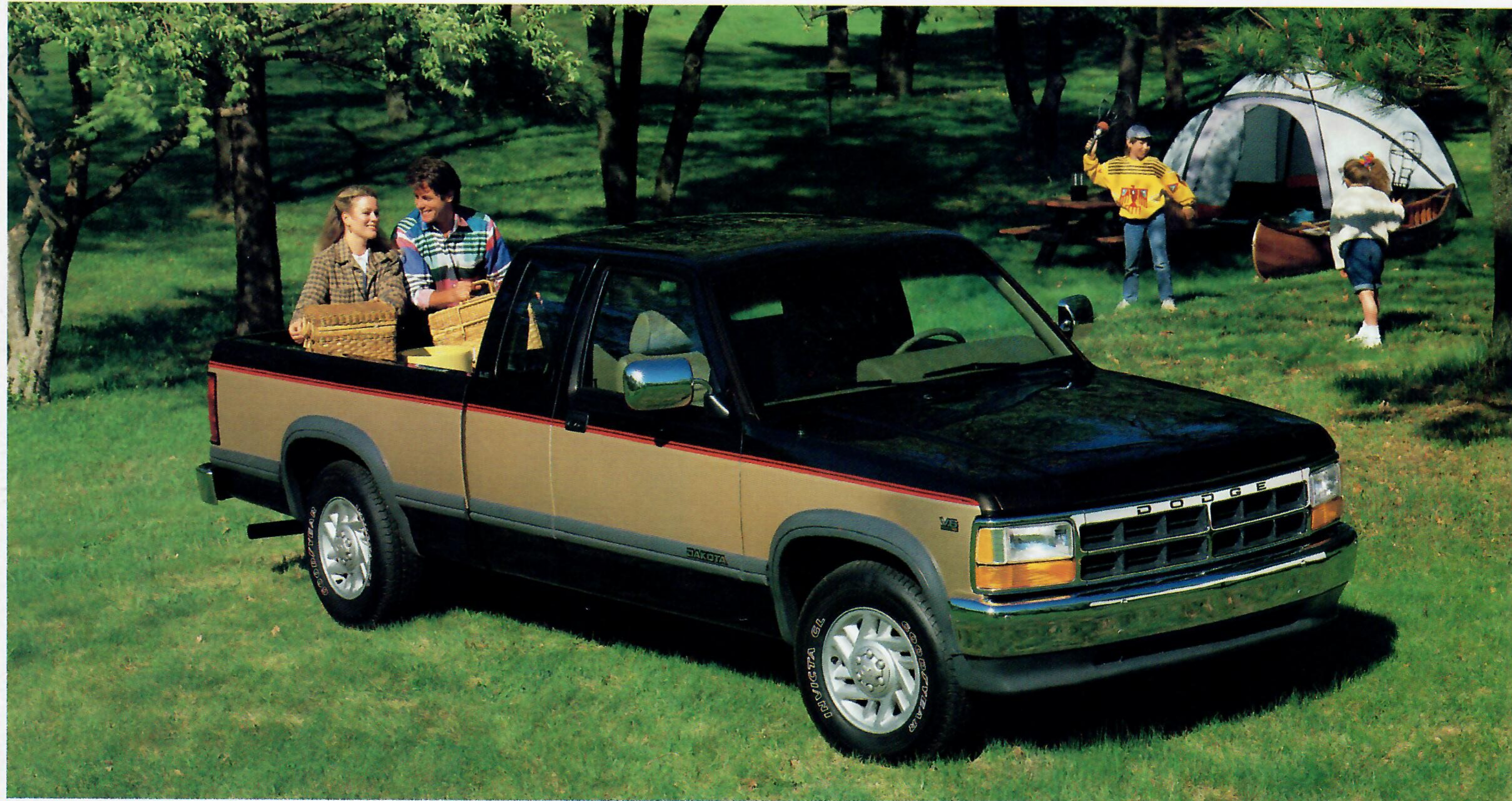
Dakota LE Club Cab shown in Dark Tundra Metallic Clear Coat and Sand Metallic Clear Coat.

More value. Dakota offers a choice of four new Customer-Preferred Advantage Packages that provide big discounts on valuable equipment and allow you to tailor your pickup to your specific needs.