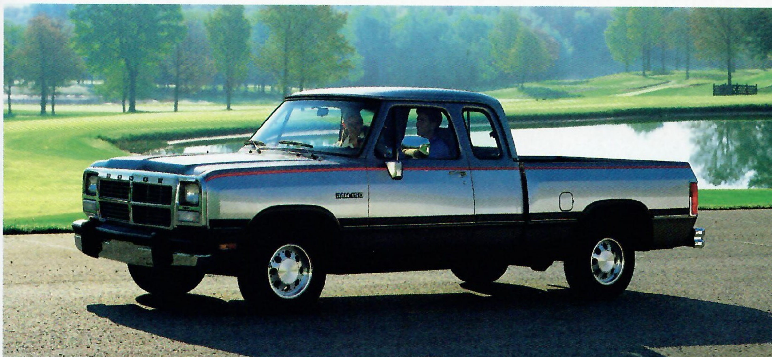
The Ram 150 LE Club Cab 4x2, shown at left in Sabre Gray Metallic Clear Coat and Silver Star Metallic Clear Coat.

Consult your dealer for information regarding necessary equipment and driveline combinations for proper trailer towing applications.