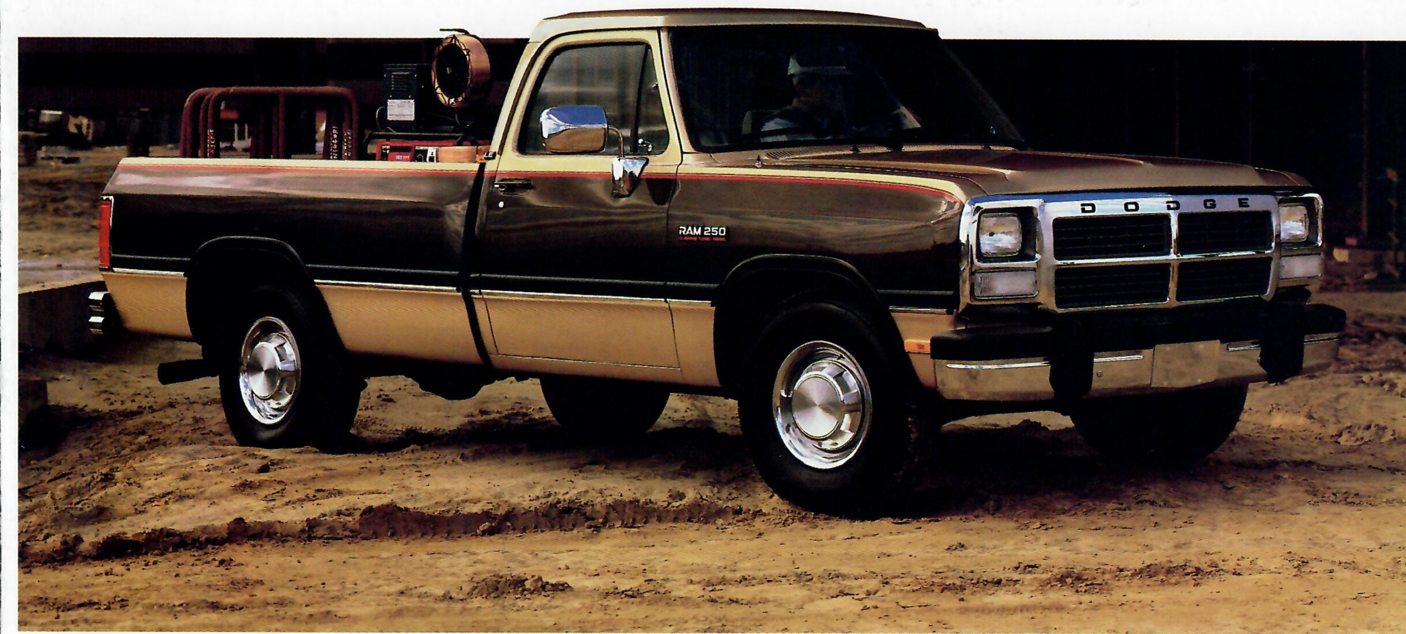
The Ram 250 LE with Cummins diesel power, shown in Sand Metallic Clear Coat and Dark Tundra Metallic Clear Coat.