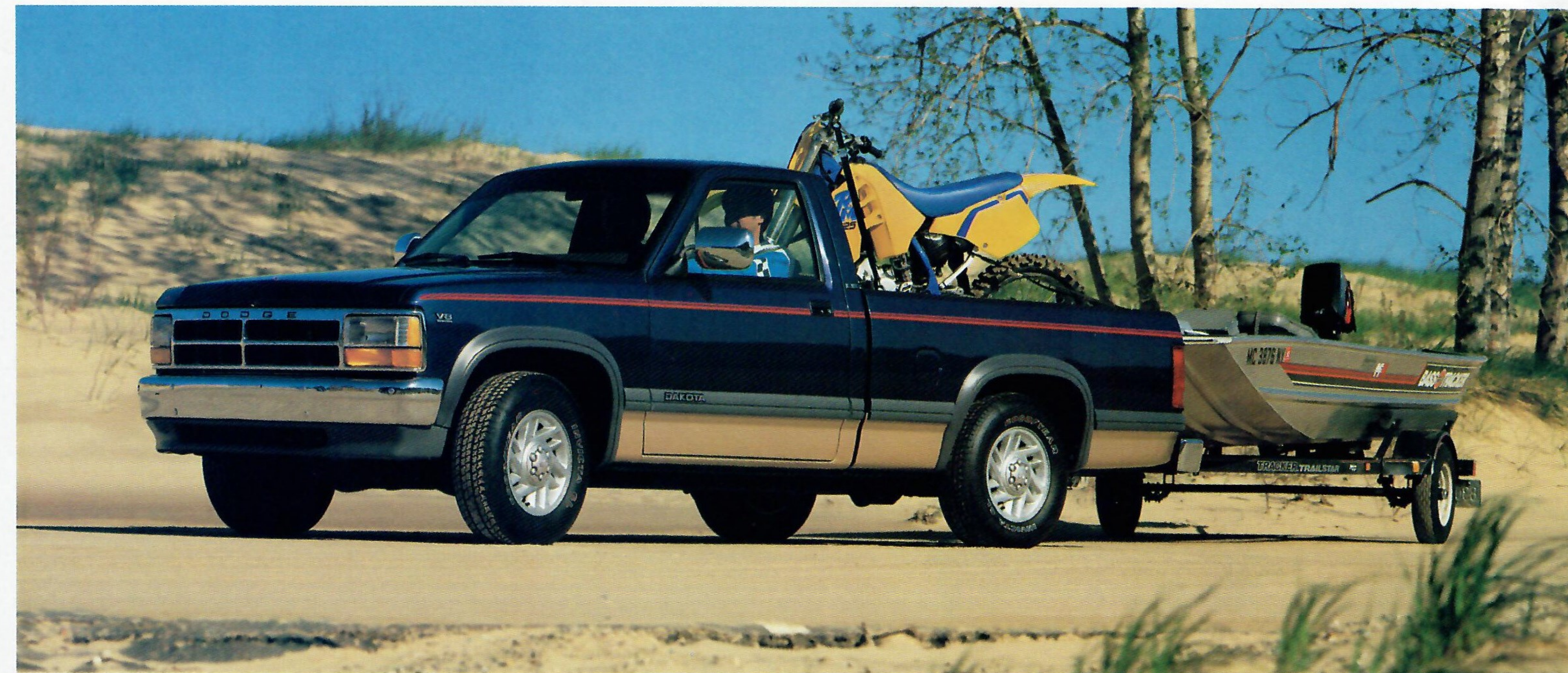
Dodge Dakota with V8 power shown in Dark Spectrum Blue Metallic Clear Coat and Sand Metallic Clear Coat.