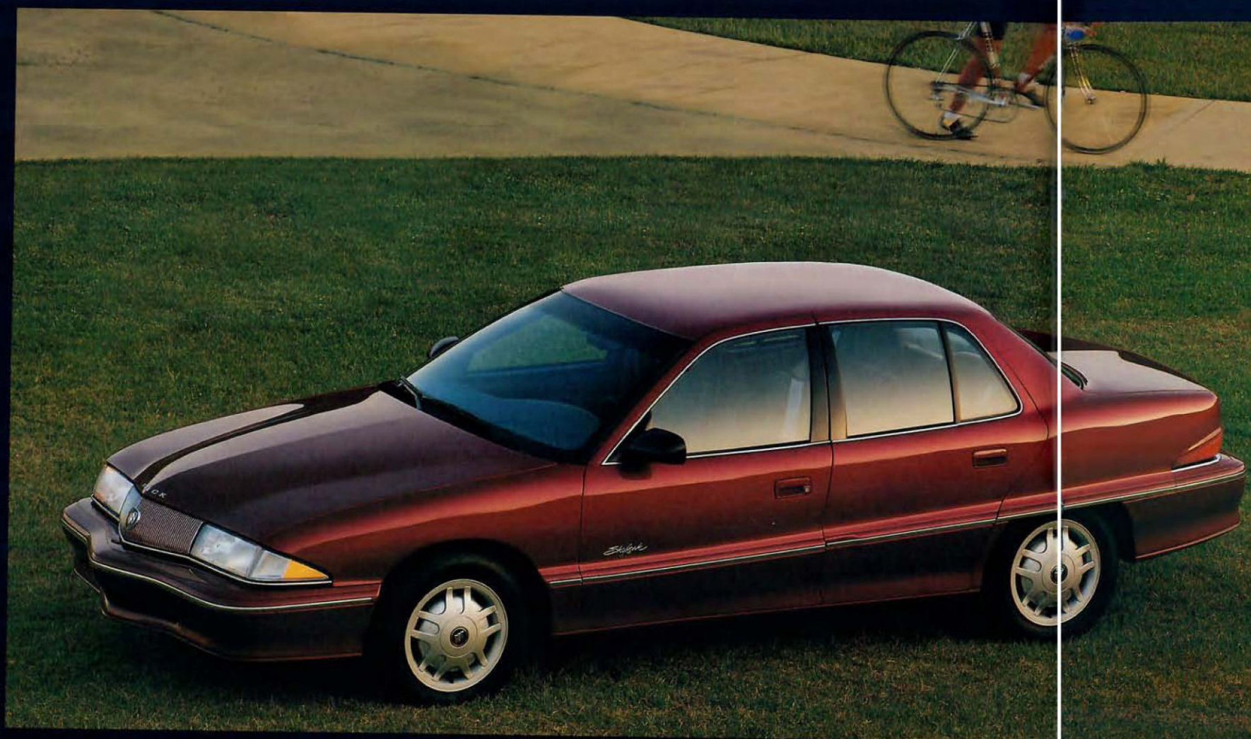
The expressively styled, all-new Skylark Sedan.