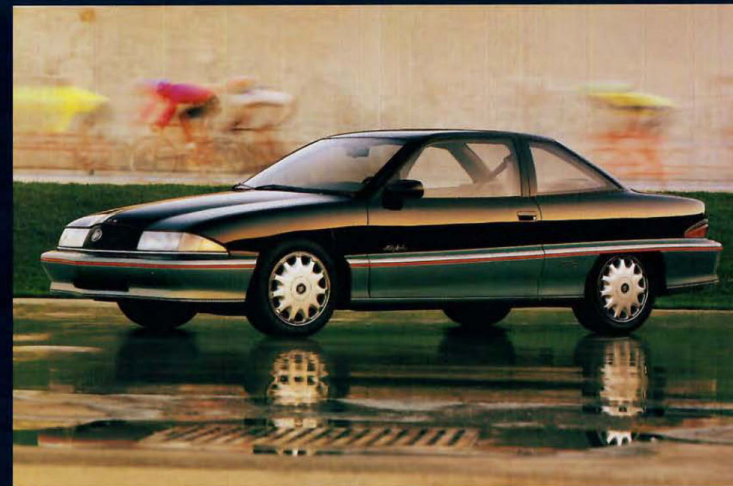
Skylark Gran Sport Coupe features 16-inch wheels and tires.