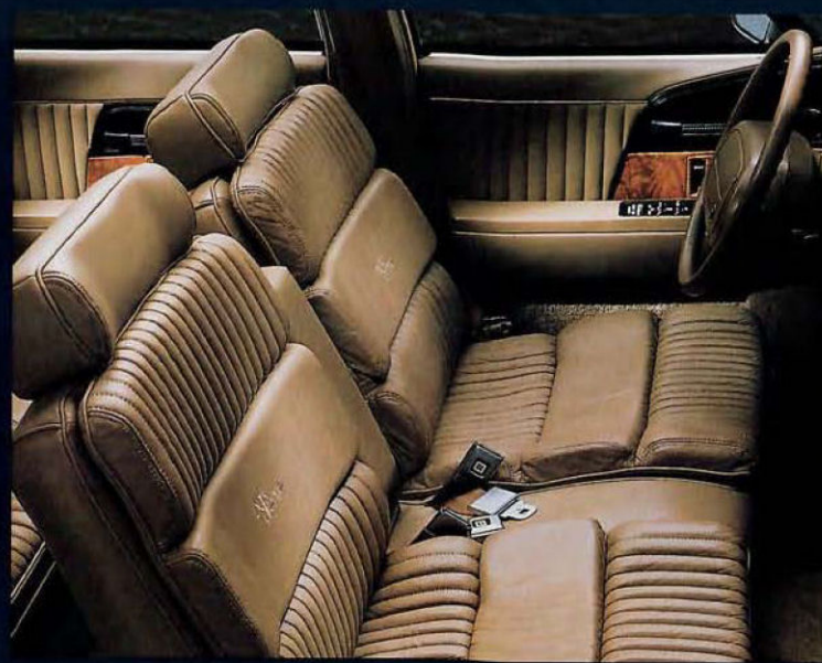
Park Avenue interior in the available Sierra grain Ultra Soft leather and doeskin vinyl.