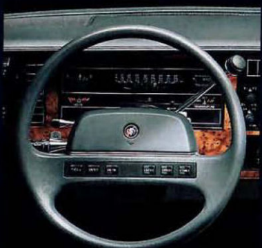
The Century offers available steering wheel radio controls.