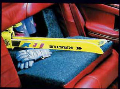
The standard split, folding rear seat allows you to carry long, bulky items.