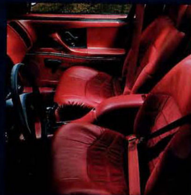
Standard Gran Sport trim features cloth and leather in the seating areas.