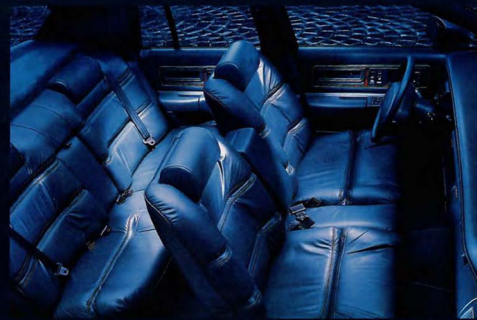
These Ultra Soft leather seats are available with your Roadmaster.