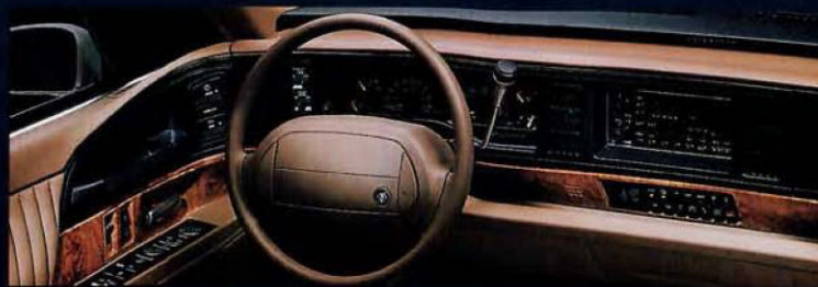
Instrument panel offers optional backlit analog gages and well-placed switches. The driver air bag is standard.