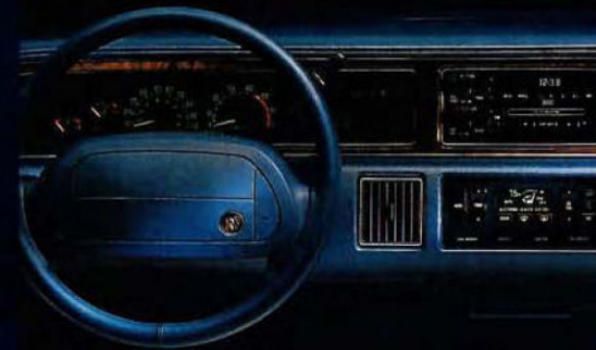
The analog instrument panel provides quick and complete information for oil, coolant temperature, volts and a trip odometer.