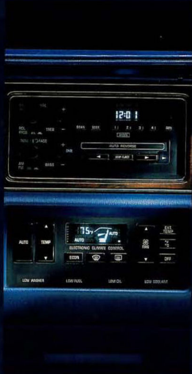
Delco Electronics - Optional CD player and electronic touch climate control air conditioning system; easy listening in cool comfort.