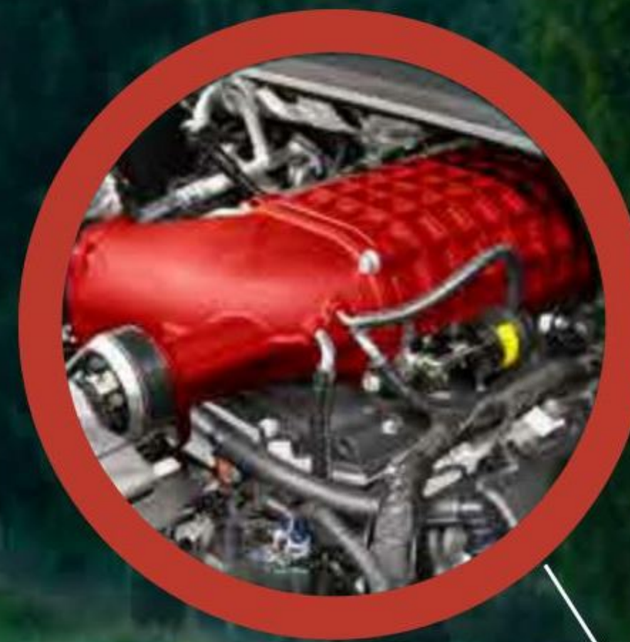
High/Output Supercharger comes standard in black with custom colors optional. Shown here in red.

NOW, IN THE SPIRIT OF THE LEGENDARY YENKO® CAMAROS AND CORVETTES, SPECIALTY VEHICLE ENGINEERING INTRODUCES THE 2018 LIMITED EDITION YENKO/SC® SILVERADO. AVAILABLE IN 2WD AND 4WD WITH STANDARD CAB/SHORT BED ONLY AND WITH AN 800 HORSEPOWER SUPERCHARGED 416 C.I.D. LT-1 POWERPLANT, THEY'LL GO FAST... LITERALLY!