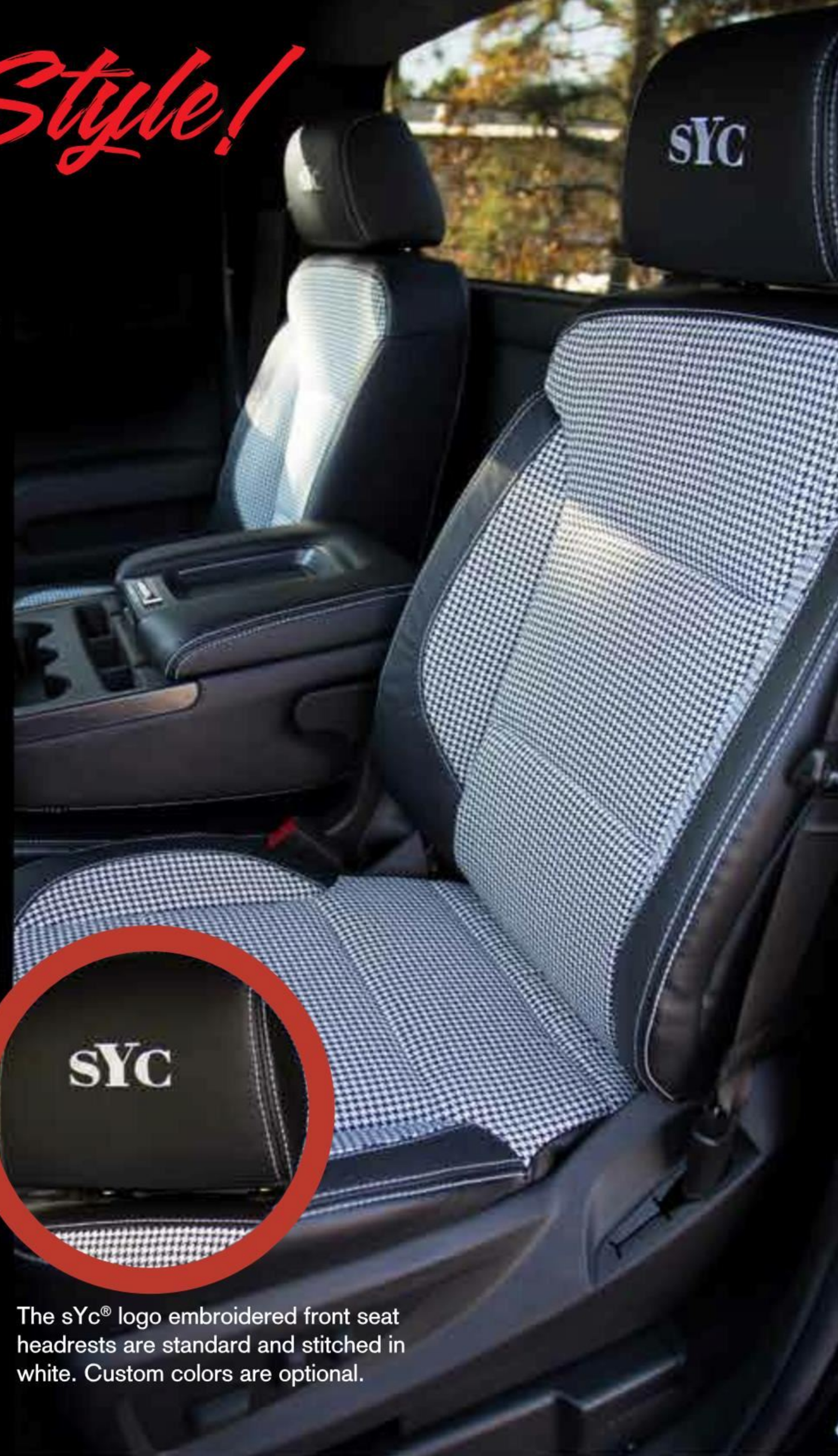
The sYc® logo embroidered front seat headrests are standard and stitched in white. Custom colors are optional.

Every 2018 YENKO/SC® Supercharged Silverado includes 2 keyfobs and a power badge. Each shows the YENKO® Crest with horsepower and torque numbers and are sequentially numbered (1-25).