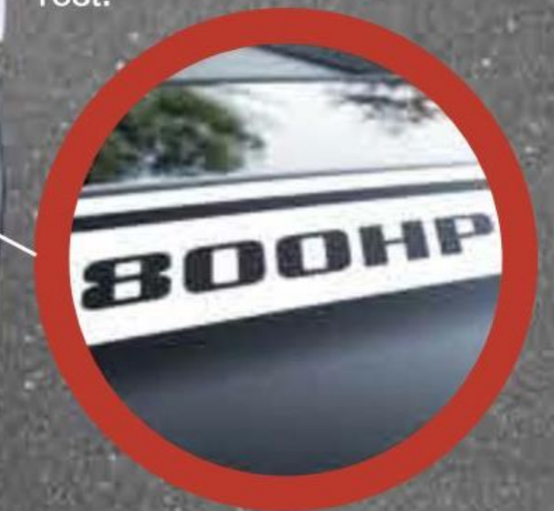
800HP cowl stripes, SYC® hood graphics, and YENKO/SC® side stripes are made from OE-quality vinyl that's resistant to fading, cracking, and peeling. Available in gloss black, flat black, white, yellow, hugger orange, red, or silver (custom colors optional)