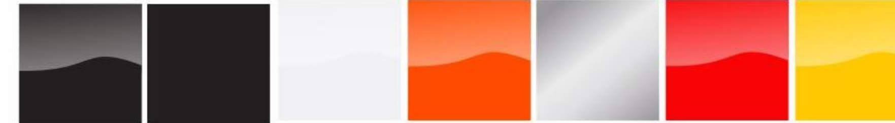
GLOSS BLACK FLAT BLACK WHITE HUGGER ORNG. SILVER RED YELLOW