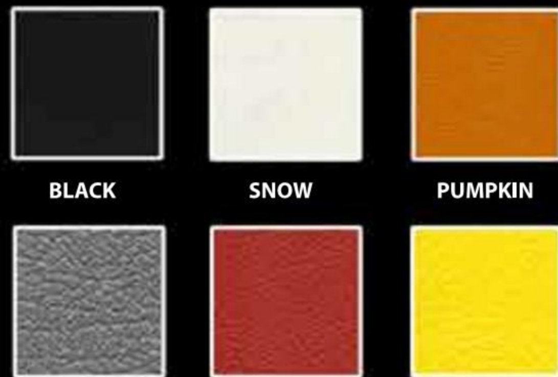
BLACK SNOW PUMPKIN SILVER RED CANARY