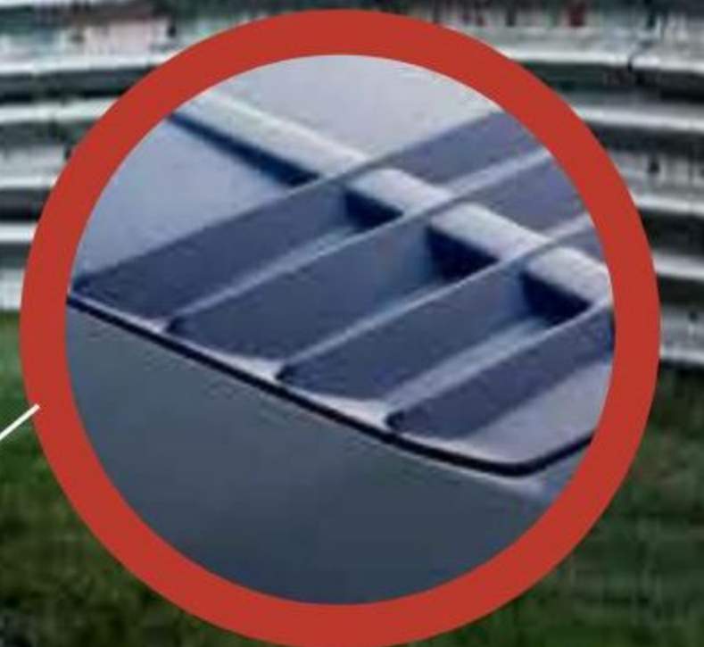
Our unique hood insert is made from durable OE-quality composite material and features a unique four louver design. Only available in flat-black finish, this hood insert makes the YENKO/SC® Silverado stand out from the rest.

*Not emission legal in California and can only be legally used while participating in sanctioned motorsports racing events.