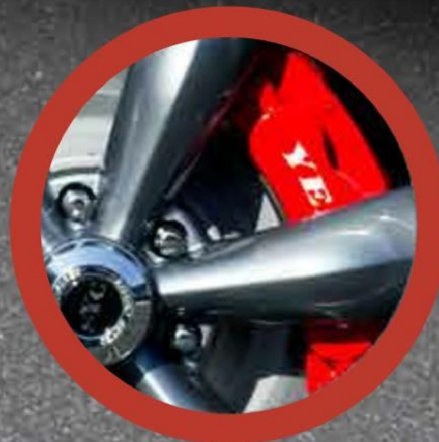
YENKO® badged 6-piston Brembo brake calipers come standard in red with custom colors optional and 16.1" vented rotors. NOTE: DEALER MUST ORDER BIG FRONT BRAKE PACKAGE FROM GMPP AND SHIP TO SPECIALTY VEHICLE ENGINEERING.