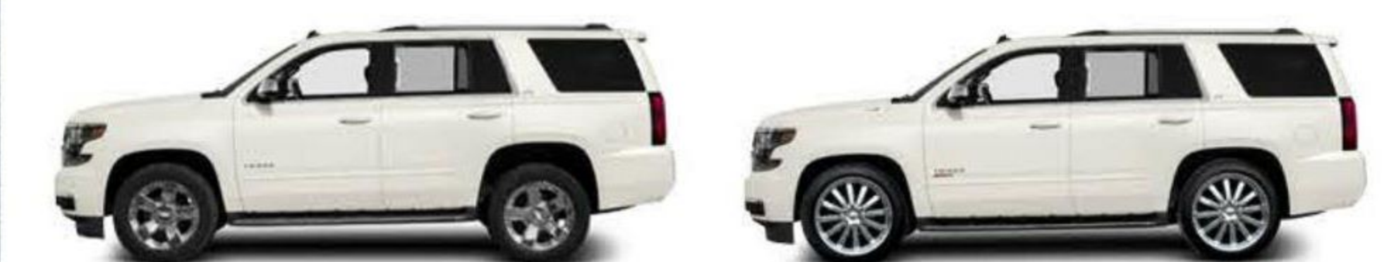
Stock Ride Height Lowered Ride Height with Specialty Vehicle Engineering Optional Sport Suspension Package

With the addition of our optional Sport Suspension Package, your Tahoe or Suburban stays firmly planted on the road. By lowering it 2" in front and 3" in the rear with our progressive rate springs, this package provides improved handling and gives the vehicle a more aggressive stance.