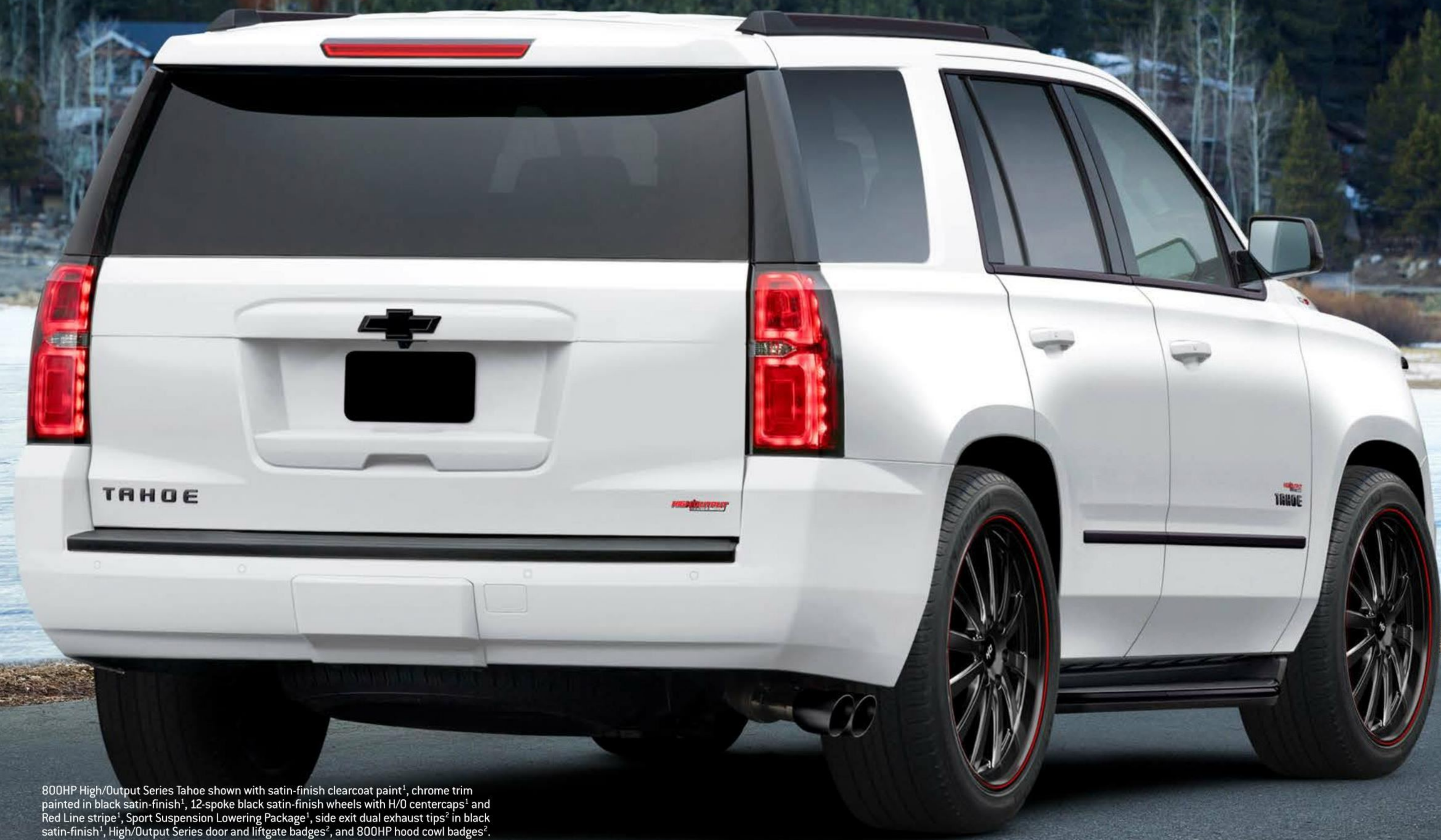
800HP High/Output Series Tahoe shown with satin-finish clearcoat paint 1 , chrome trim painted in black satin-finish 1 , 12-spoke black satin-finish wheels with H/O centercaps 1 and Red Line stripe 1 , Sport Suspension Lowering Package 1 , side exit dual exhaust tips 2 in black satin-finish 1 , High/Output Series door and liftgate badges 2 , and 800HP hood cowl badges 2 . 1 OPTIONAL 2 STANDARD

This optional paint treatment uses an OE-quality satin-finish clearcoat paint over the factory exterior paint of the Tahoe or Suburban giving it a unique satin-finish appearance while maintaining the vehicle's stock factory body color. Looks great over all factory colors. Available for both High/Output Series and Sport Edition Supercharged Specialty Vehicles.