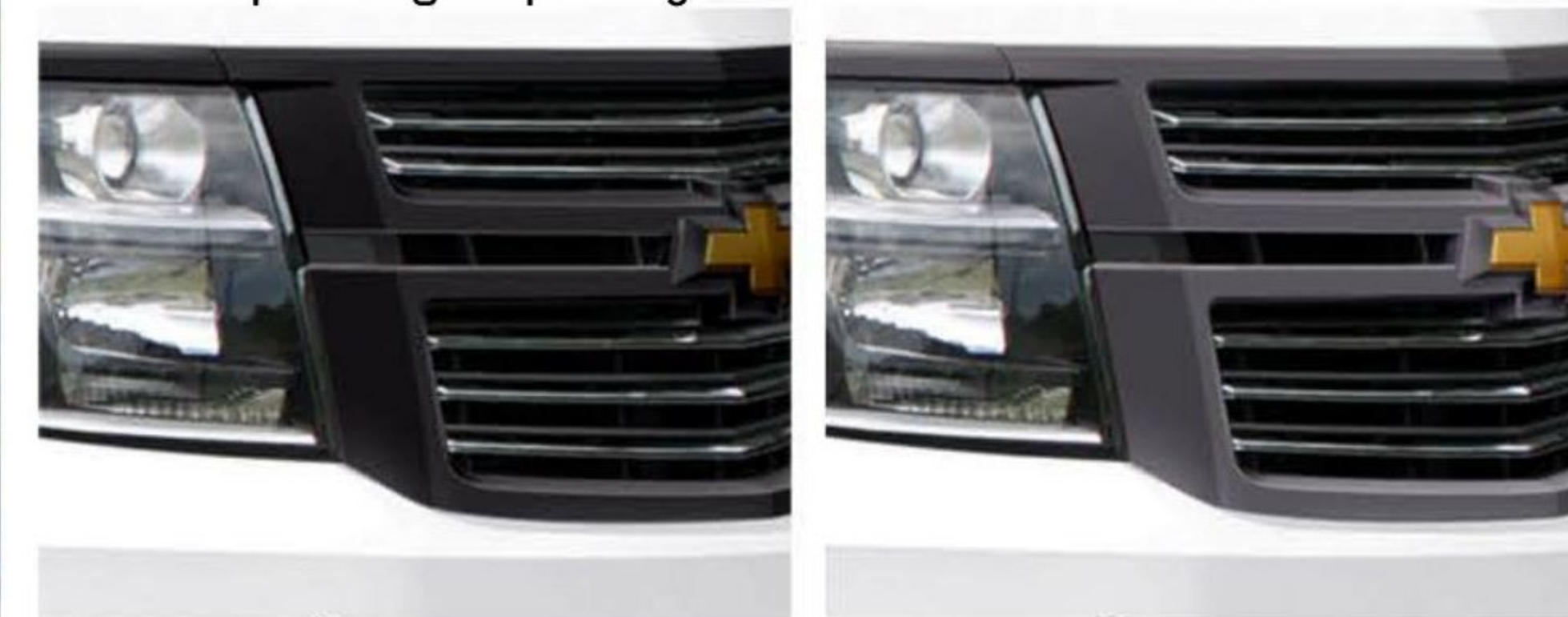
CHROME TRIM PAINT TREATMENT IN BLACK SATIN-FINISH CHROME TRIM PAINT TREATMENT IN CHARCOAL SATIN-FINISH

To give your Specialty Vehicle Tahoe or Suburban an even more unique appearance, our optional chrome trim paint treatment is available in charcoal satin-finish or black satin-finish. All of the vehicle's exterior chrome trim is finished with this satin-finish paint and when combined with the optional satin-finish exterior paint, this Tahoe or Suburban looks like no other on the road! Available for both High/Output Series and Sport Edition Supercharged Specialty Vehicles.