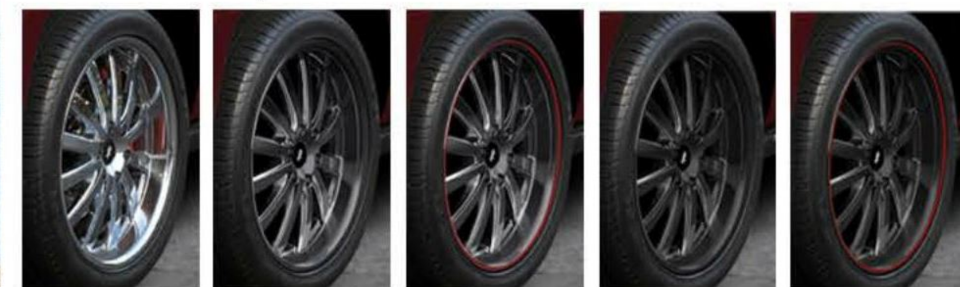
CHROME FINISH CHARCOAL SATIN-FINISH CHARCOAL SATIN-FINISH W/OPTIONAL RED-LINE STRIPE BLACK SATIN-FINISH BLACK SATIN-FINISH W/OPTIONAL RED-LINE STRIPE

Our 12-spoke wheels provide an attractive alternative to the factory wheels available from your Chevy dealer. These wheels are available in chrome-finish, charcoal satin-finish, or black satin-finish with H/O or SE centercaps and include a set of Falken STZ05 305 40/R22 tires. Optional red line wheel stripes are available.