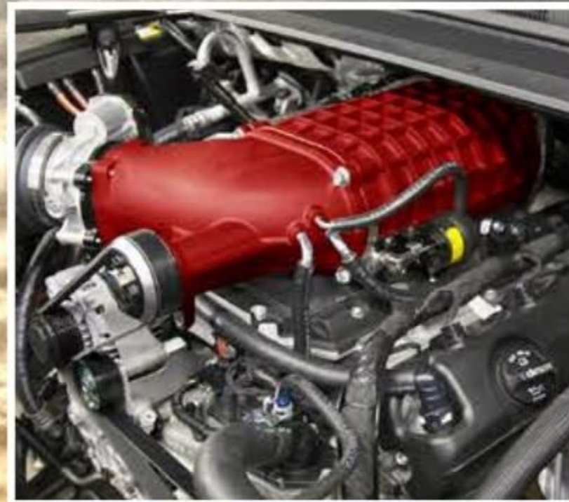
Specialty Vehicle Engineering's High/Output Series supercharged LT-1 engine with 800 horsepower and 750 lb.-ft. of torque makes this 2018 Tahoe/Suburban one of the fastest SUVs on the road.

Our HIGH/OUTPUT SERIES 416 C.I.D. (6.8L) LT-1 engine and supercharger assembly (on Tahoes and Suburbans equipped with GM's RST Performance Package) represents the latest in state-of-the-art race engine technology. This powerhouse engine and supercharger assembly delivers 800 horsepower with 750 lb.-ft. of torque, and features a blueprinted LT-1 aluminum block, race-quality computer-balanced rotating assembly, including forged 4340 steel crankshaft and forged steel H-beam rods, forged aluminum pistons, CNC-ported LT-1 cylinder heads, and a custom supercharger. Neck-snapping performance not for the faint-at heart.