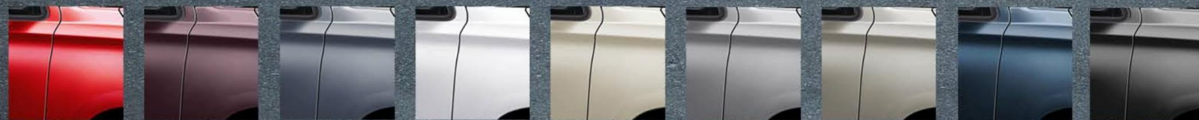
SATIN-FINISH OVER SIREN RED TINTCOAT SATIN-FINISH OVER BLACK CURRANT METALLIC SATIN-FINISH OVER TUNGSTEN METALLIC SATIN-FINISH OVER SUMMIT WHITE SATIN-FINISH OVER CHAMPAGNE SILVER METALLIC SATIN-FINISH OVER SILVER ICE METALLIC SATIN-FINISH OVER PEPPERDUST METALLIC SATIN-FINISH OVER BLUE VELVET METALLIC SATIN-FINISH OVER BLACK