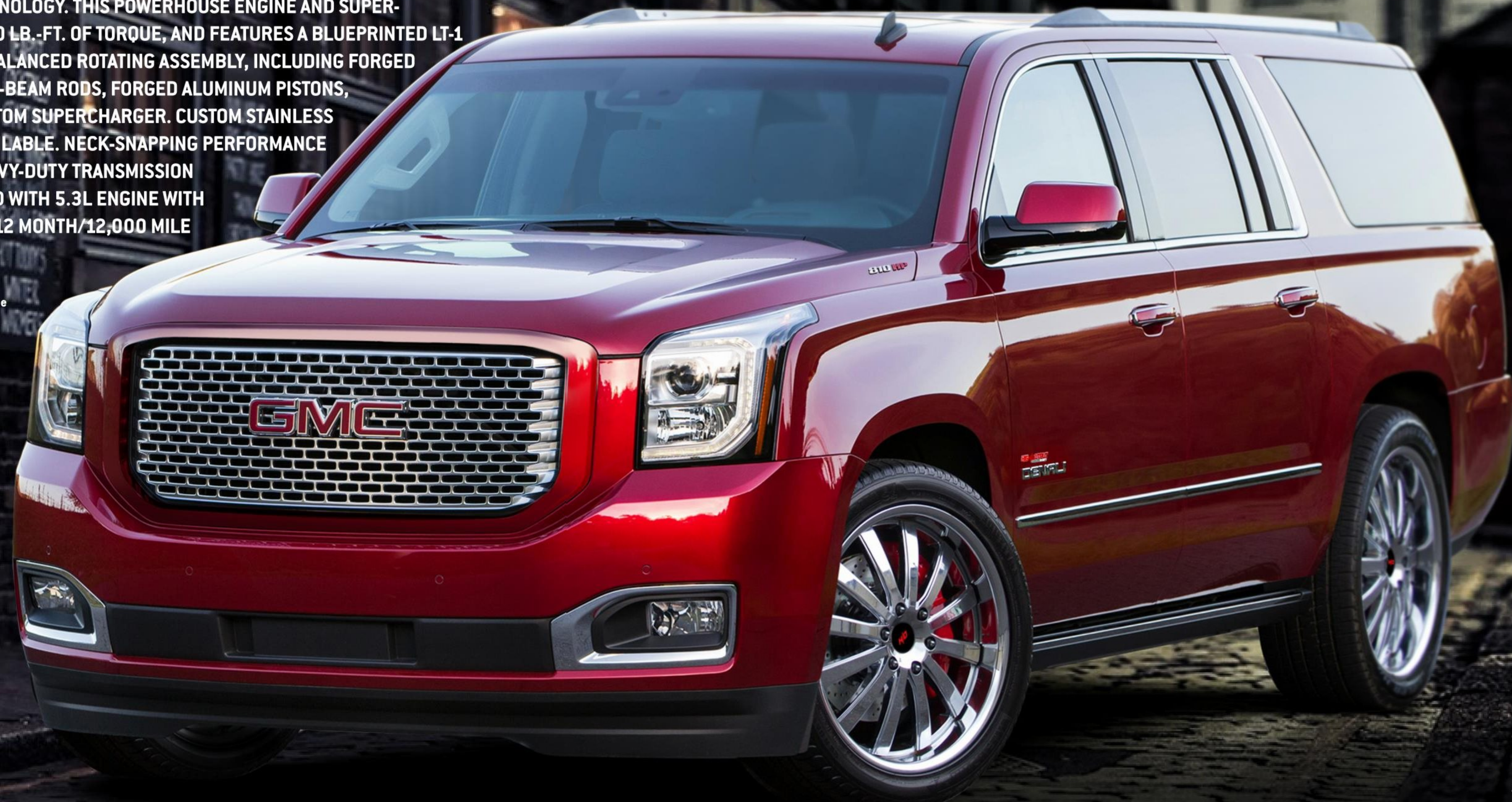
2019 810HP High/Output Series Yukon Denali shown with chrome-finish 12-spoke wheels with H/O centercaps 1 , Sport Suspension Lowering Package with 2" front and 3" rear lowering springs 1 , body color painted front grille surround 1 , 810HP hood cowl and liftgate badges 2 , High/Output Series door and liftgate badges 2