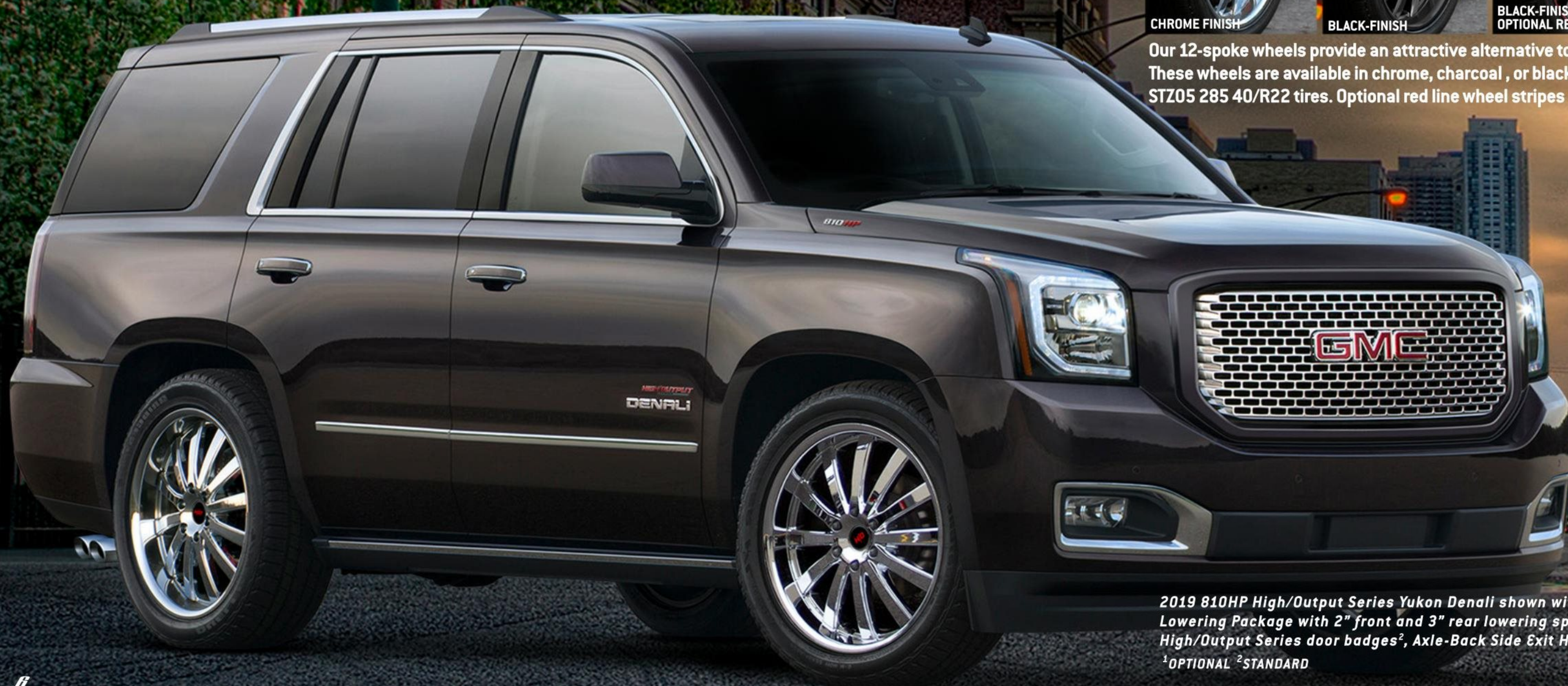
2019 810HP High/Output Series Yukon Denali shown with Chrome-finish 12-spoke wheels with H/O centercaps 1 , Sport Suspension Lowering Package with 2" front and 3" rear lowering springs 1 , 810HP hood cowl badges 2 , body color painted front grille surround 1 , High/Output Series door badges 2 , Axle-Back Side Exit High-Polished Dual Exhaust Tips 2