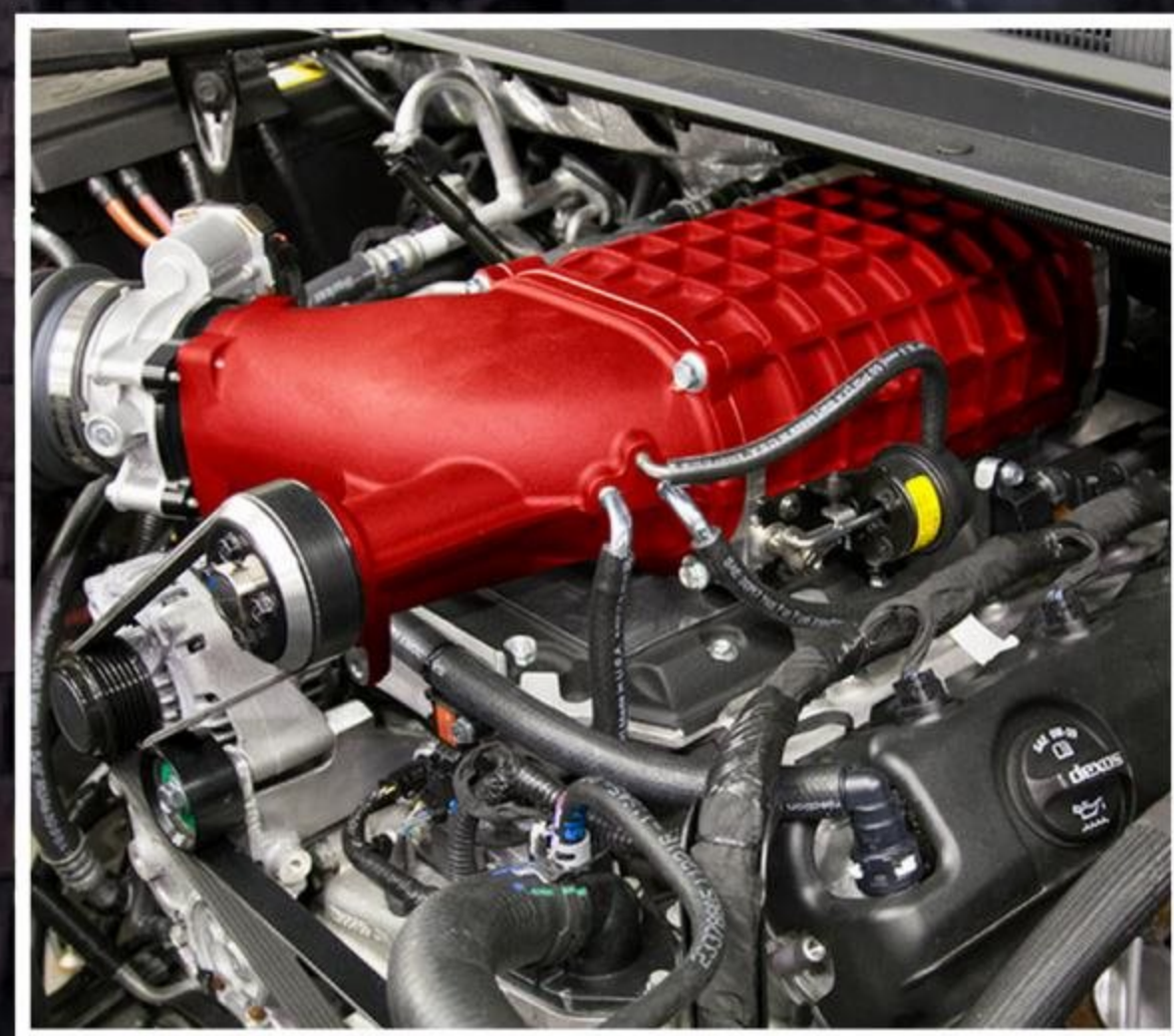
Specialty Vehicle Engineering's High/Output Series supercharged engine with 810 horsepower and 750 lb.-ft. of torque makes this 2019 Yukon one of the fastest SUVs on the road. Shown with optional supercharger paint (black is standard).

*Not emission legal in California and can only be legally used while participating in sanctioned motorsports racing events.