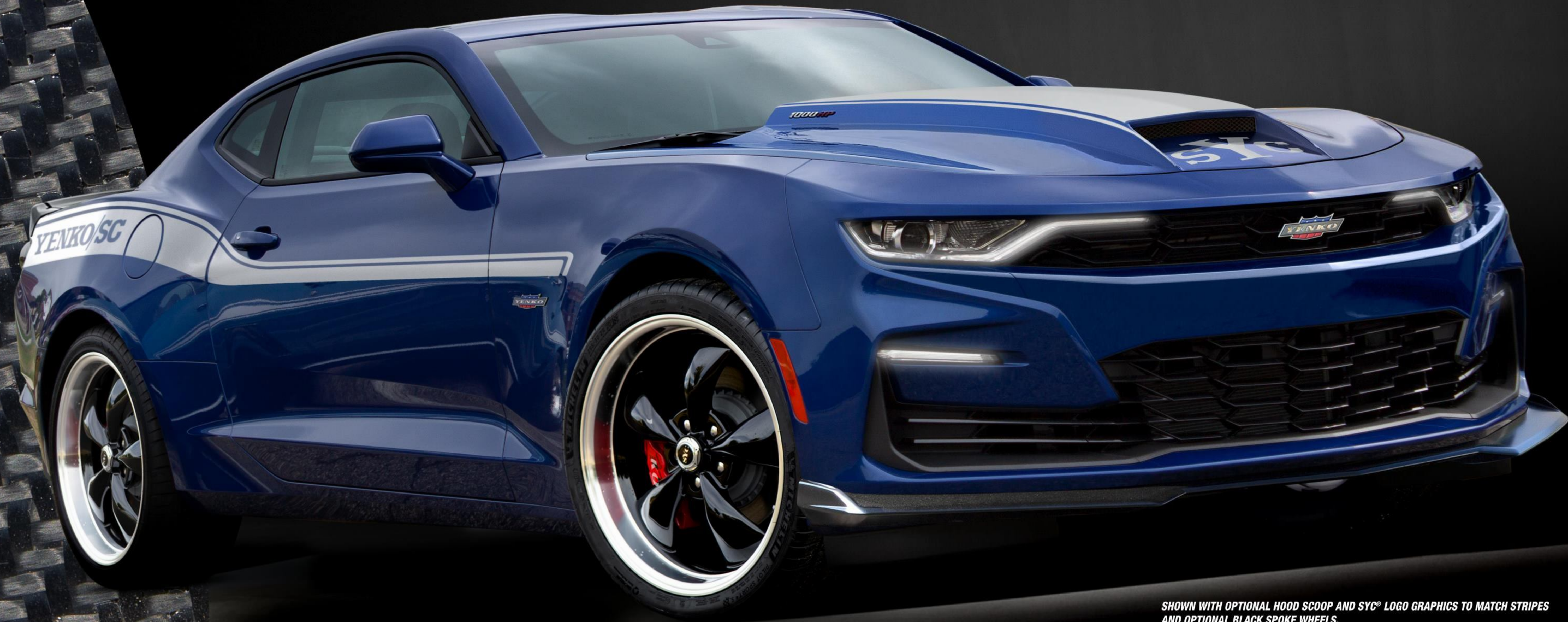
SHOWN WITH OPTIONAL HOOD SCOOP AND SYC® LOGO GRAPHICS TO MATCH STRIPES AND OPTIONAL BLACK SPOKE WHEELS.

heavy-duty cooling system including engine oil cooler, dual outboard radiators, transmission cooler and rear differential cooler. The functional 1LE front splitter helps reduce nose lift and the rear spoiler keeps the rear end firmly planted at speed. The 1LE also features Recaro Performance Seats that keep you planted in position.