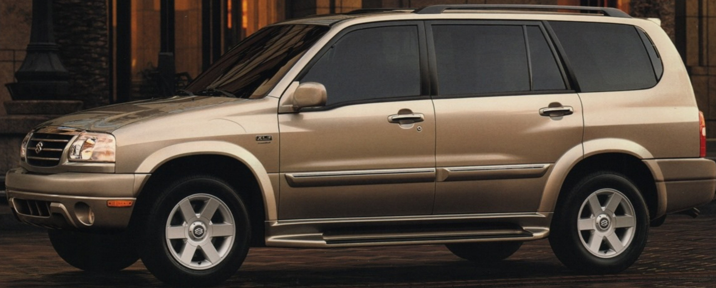
XL-7 Limited shown in Cool Beige Metallic.