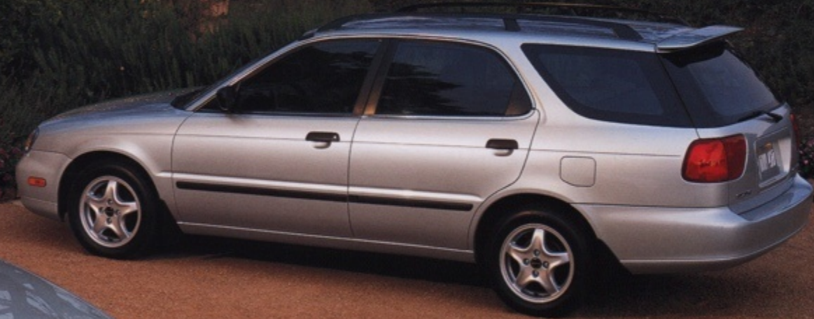
Esteem Sedan GLX and Wagon GLX shown in Silky Silver Metallic.