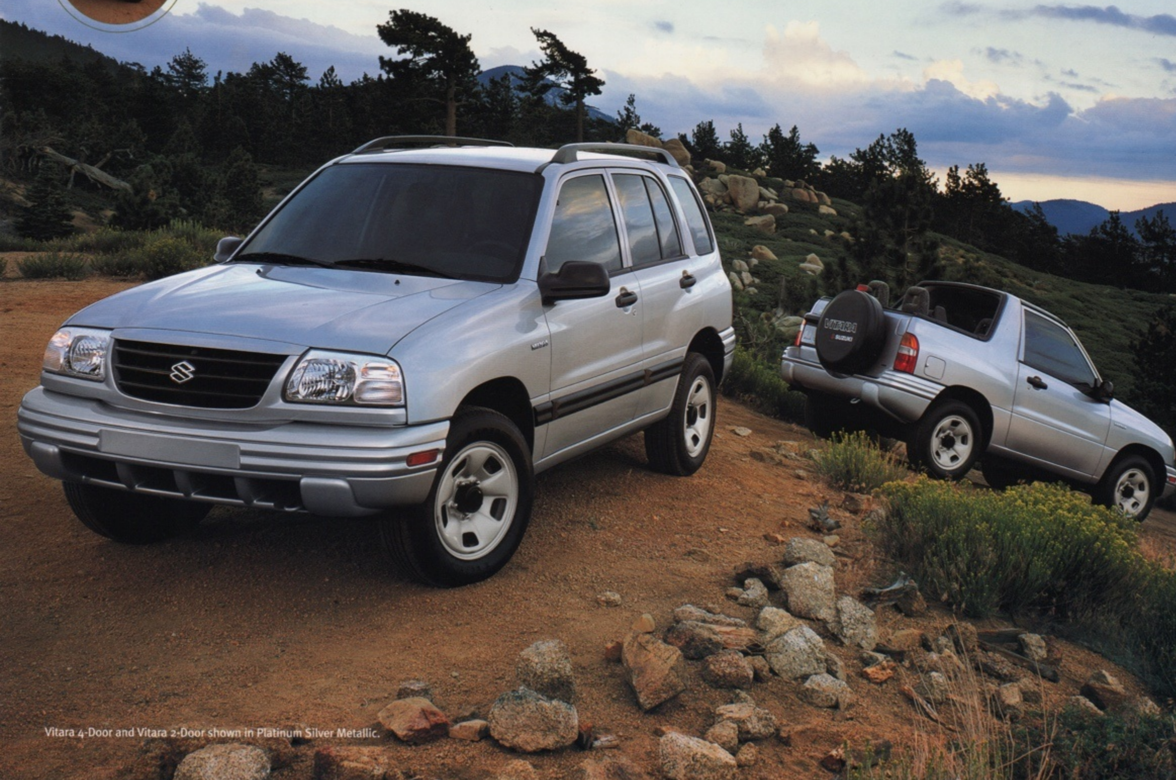
Vitara 4-Door and Vitara 2-Door shown in Platinum Silver Metallic.