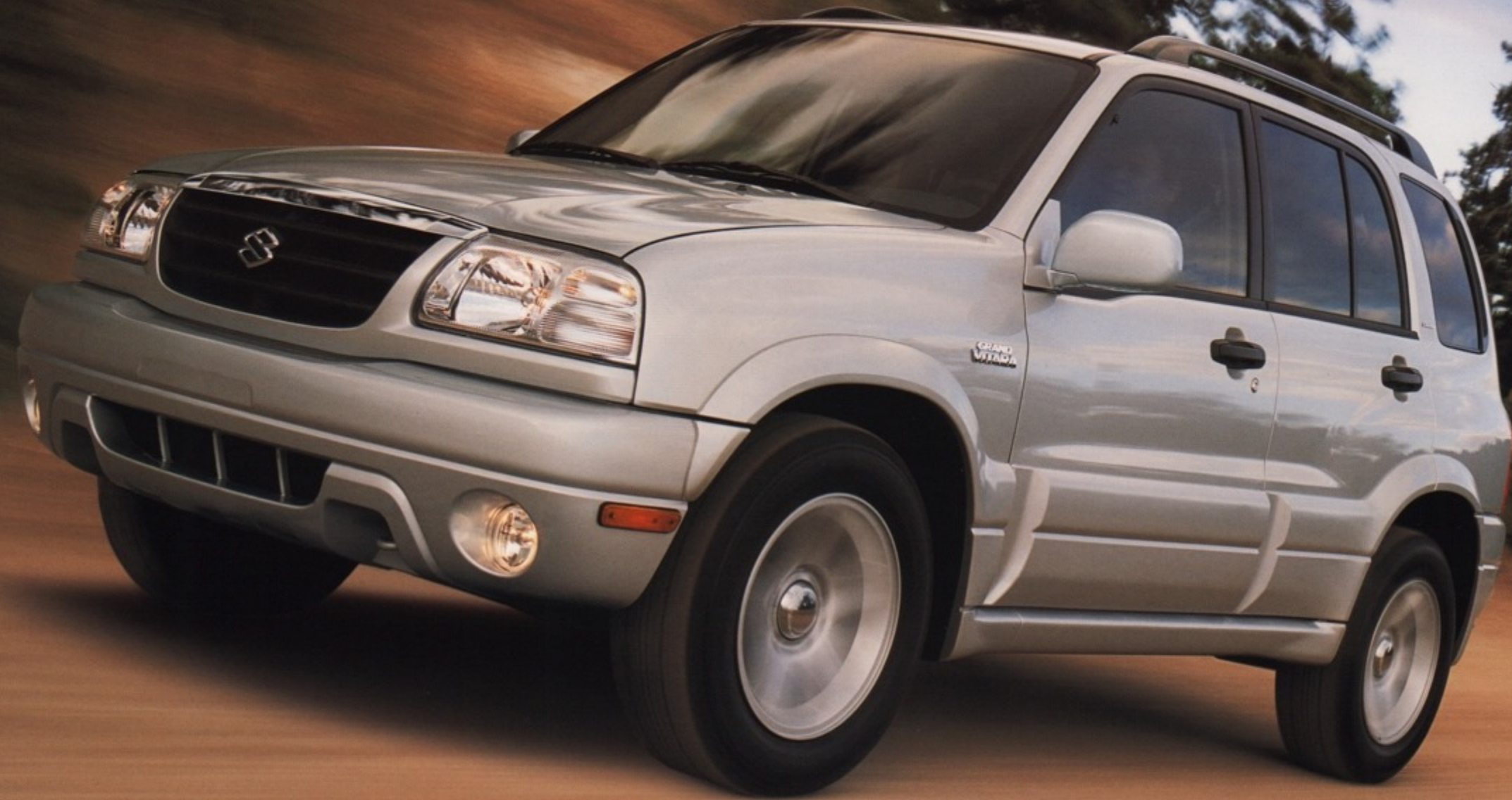
Grand Vitara Limited shown in Silky Silver Metallic.