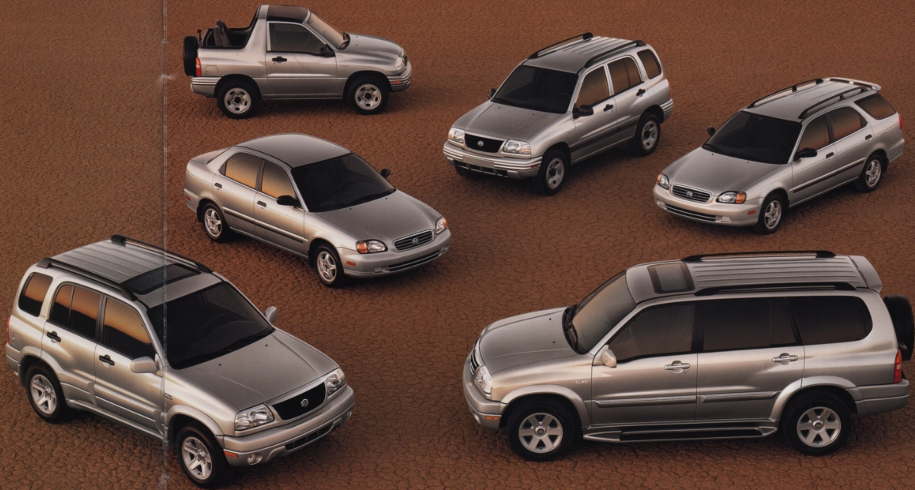
2002 Suzuki lineup. Clockwise from bottom left: Grand Vitara, Esteem Sedan, Vitara 2-Door, Vitara 4-Door, Esteem Wagon and XL-7.