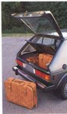
Rabbit GL in Centurian Gray Metallic and Rabbit L (3-door) in Royal Red illustrated.

a standard 4+E manual transmission or an optional 3-speed automatic transmission.