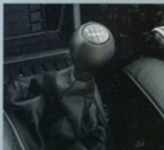
Fully reclining bucket seats (including a height adjustable driver's seat), full instrumentation, 5-speed close-ratio transmission and stylish alloy wheels are all standard on the Jetta GLI.