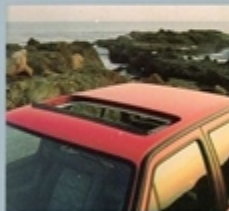
Four wheel disc brakes are standard on Jetta GLI. Optional comfort and convenience features include a power window and door lock package, electronically controlled AM/FM stereo cassette radio with cassette holder, air conditioning and a sunroof.