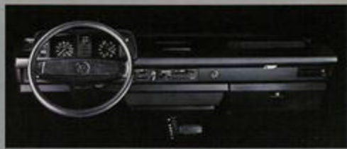
Fully padded instrument panel is ergonomically designed to place all controls within easy reach of the driver.

The Vanagon is one home-away-from-home whose performance matches its practicality. And that puts it in a very classy neighborhood, indeed.