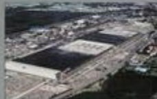
The Vanagon manufacturing facility in Hannover, West Germany.

Isn't it nice to feel secure in your decision to drive a new Volkswagen?