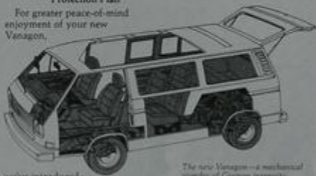
The new Vanagon—a mechanical wonder of German ingenuity.

For greater peace-of-mind enjoyment of your new Vanagon,