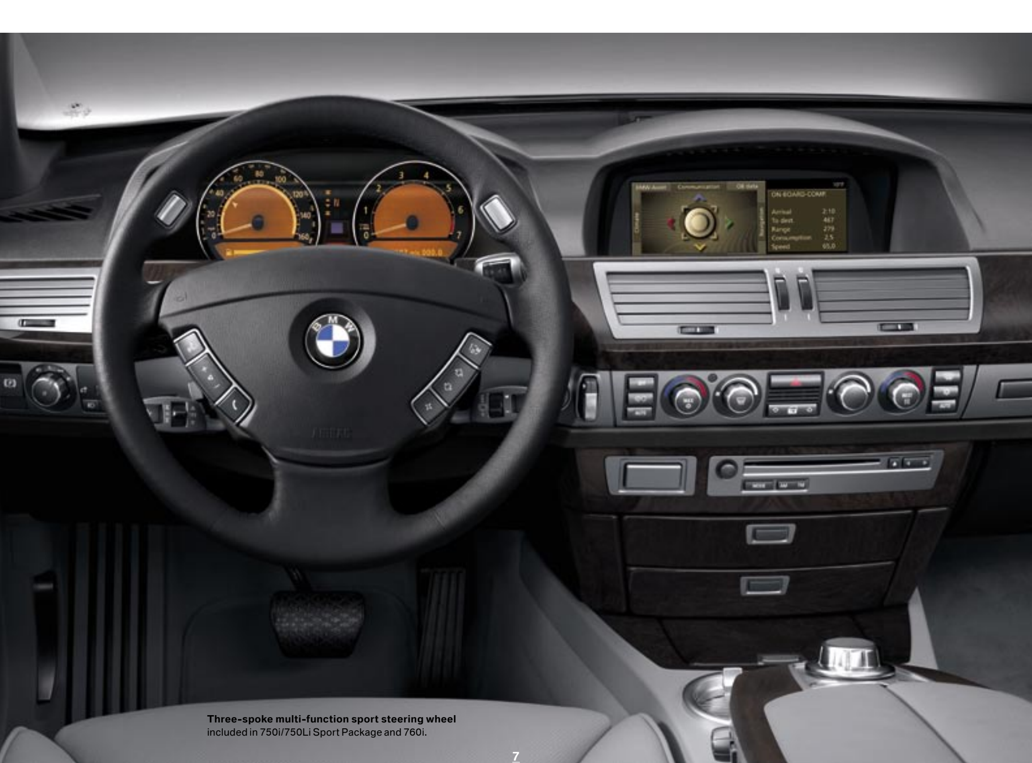
Three-spoke multi-function sport steering wheel included in 750i/750Li Sport Package and 760i.