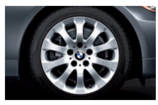
■ /□ 17 x 8.0 Star Spoke (Style 159) light-alloy wheels with 225/45R-17 run-flat¹ all-season tires. (std. on 335i/335xi; included in 328xi Sport Package)