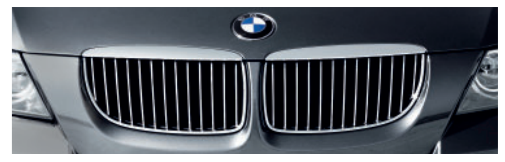
■ BMW's distinctive front kidney-shaped grille features a chrome surround. The vertical slats on the 335i/335xi grille are chrome; the 328i/328xi has black slats.