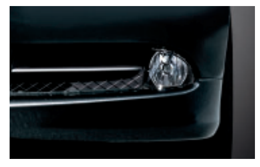
■ / □ Xenon Adaptive Headlights provide brilliant clarity of the road ahead and to the side at night and in conditions with poor visibility. The dynamic auto-leveling feature adjusts for varying passenger and cargo loads, helping to keep headlight glare out of the eyes of oncoming drivers. BMW Adaptive Headlights provide optimum road illumination around corners, thanks to an electromechanical control system that directs the headlights into andaround the bend as soon as the vehicle begins cornering. (std. on 335i/335xi; opt. on 328i/328xi)