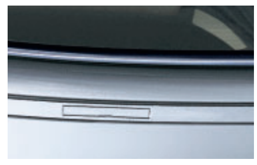
■ Roof rail clips and grooves are designed for the BMW Accessory roof rail system, holding it perfectly in place.