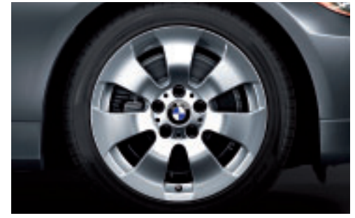
☐ 17 x 8.0 Star Spoke (Style 158) light-alloy wheels with 225/45R-17 run-flat¹ all-season tires. (included in 335xi Sport Package)