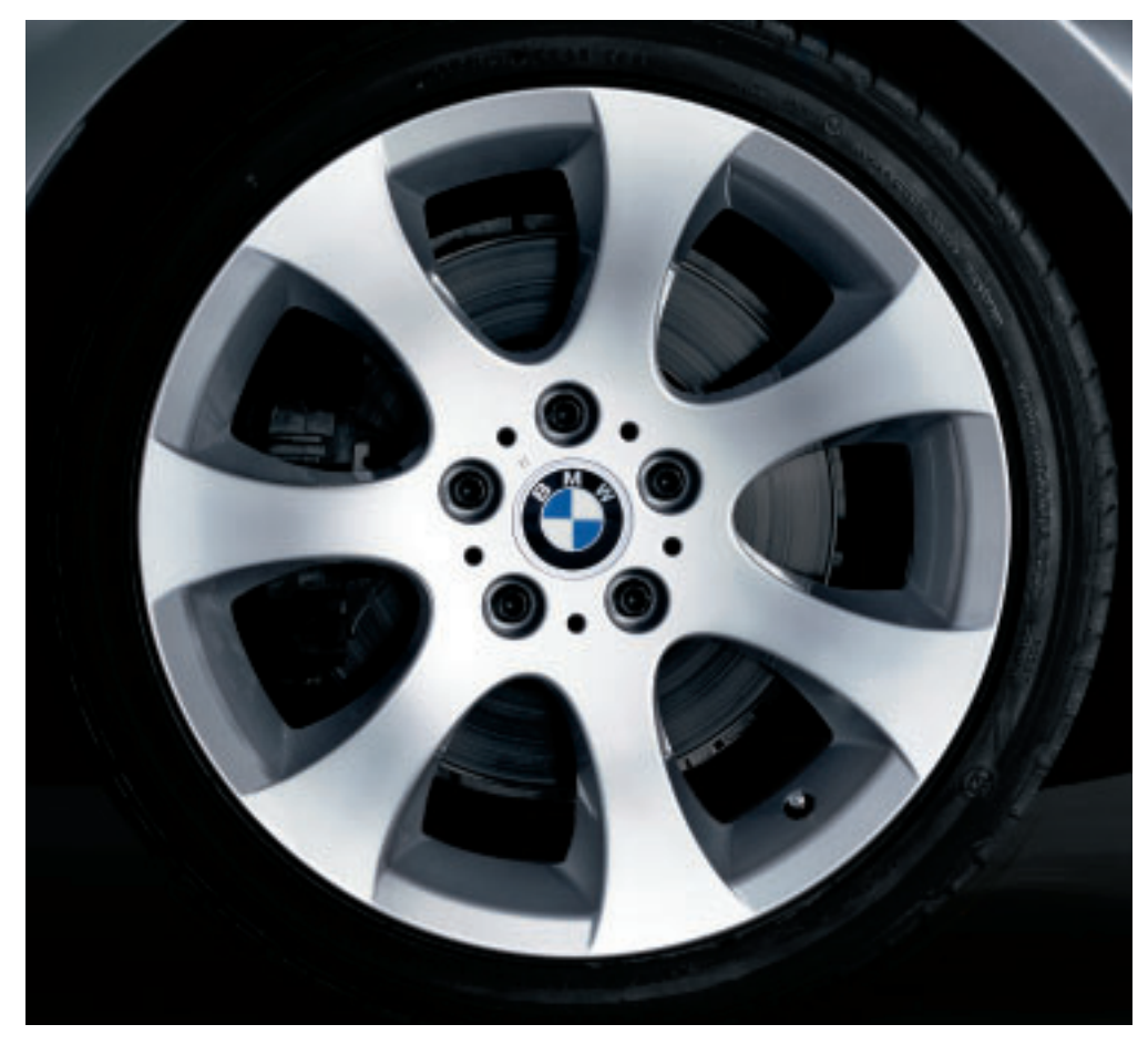
\square Star Spoke (Style 162) light-alloy wheels and run-flat<sup>1</sup> performance tires.<sup>2</sup> In front: 18 x 8.0 wheels and 225/40R-18 tires; in back: 18 x 8.5 wheels and 255/35R-18 tires.<sup>3</sup> (included in 335i Sport Package; opt. in 335xi, requires optional Sport Package)