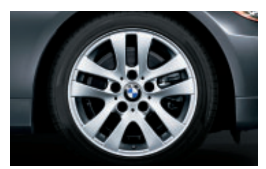
■ 16 x 7.0 Double Spoke (Style 156) light-alloy wheels with 205/55R-16 run-flat<sup>1</sup> all-season tires. (std. on 328i/328xi)