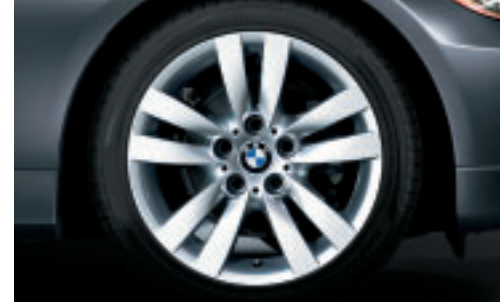
□ Double Spoke (Style 161) light-alloy wheels and run-flat¹ performance tires.² In front: 17 x 8.0 wheels and 225/45R-17 tires; in back: 17 x 8.5 wheels and 255/40R-17 tires.³ (included in 328i Sport Package; opt. in 328xi, requires optional Sport Package)