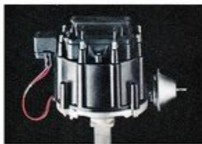
Standard on every Ventura is this new High Energy Electronic Ignition. For improved ignition performance and reliability.