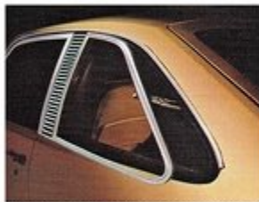
Swing-out rear quarter windows are available on all Ventura Coupes.

Of course, if you want more, we also offer a little nicer Ventura called Custom. You'll know what we're talking about when you come to grips with