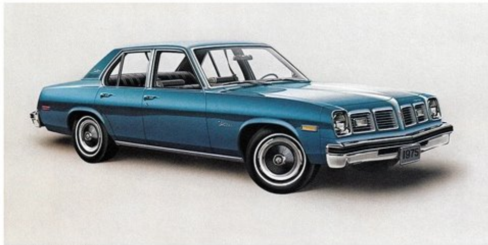
Ventura Custom 4-door Sedan.

the custom cushion steering wheel. And settle back into the custom cloth and Morrokide upholstered interior.