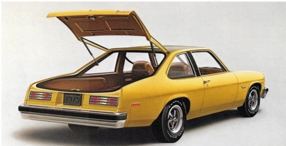
Ventura 2-Door Hatchback Coupe.

There's a pretty sporty interior, too. With a special aluminum swirl-finish instrument panel.