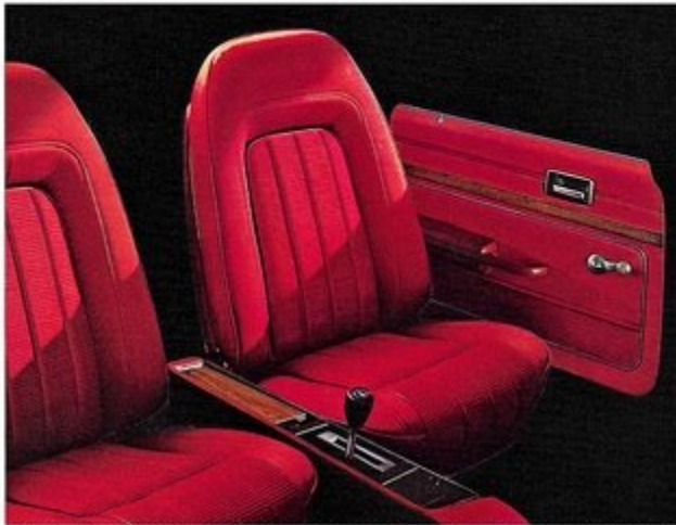
Ventura SJ's standard cloth and Morrokide interior. Shown in burgundy—also available in black. Remind you of other great Pontiacs?