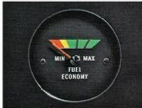
An available fuel economy gauge can help you save gas (N.A. at start of production).