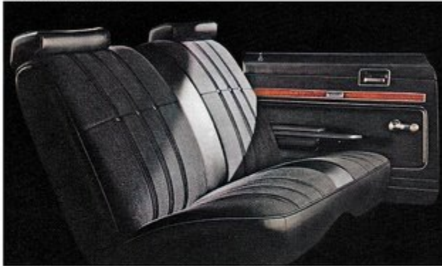
One reason our Ventura Custom is called just that. This custom cloth and Morrokide full-width seat is standard. Shown in black—also available in sandstone.

It used to be you bought a compact car for one or more of three reasons. You liked the size. You liked the price. Or you liked the economy.