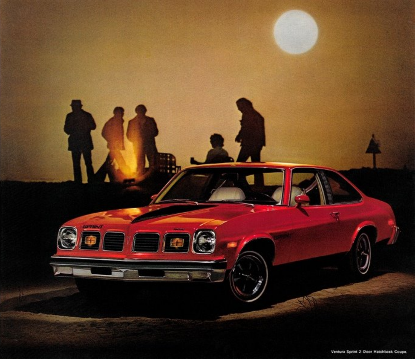
Ventura Sprint 2-Door Hatchback Coupe.