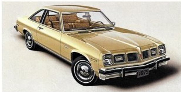
Ventura 2-Door Coupe.