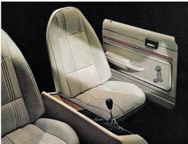
All-Monokide bucket seats are available on any Ventura. Shown in white—also available in saddle and black. Burgundy and blue buckets also available on 2-Door Coupes.

Custom cushion steering wheel. And cut-pile carpeting.