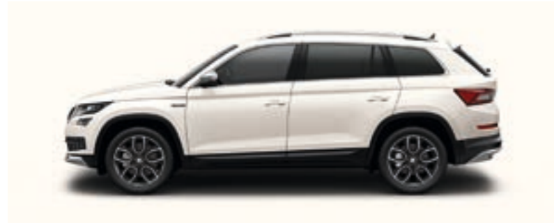
CANDY WHITE UNI