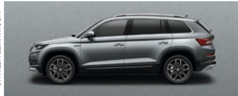
BUSINESS GREY METALLIC