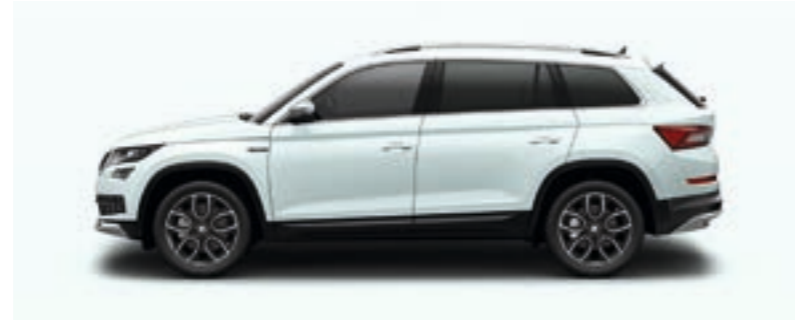
LASER WHITE UNI