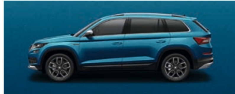
LAVA BLUE METALLIC