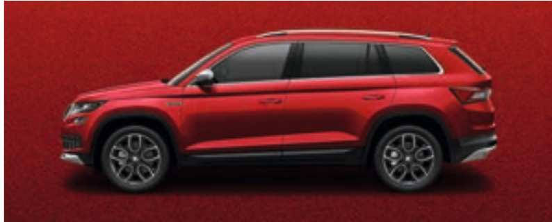
VELVET RED METALLIC