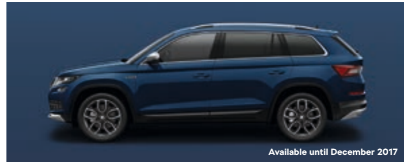
Available until December 2017