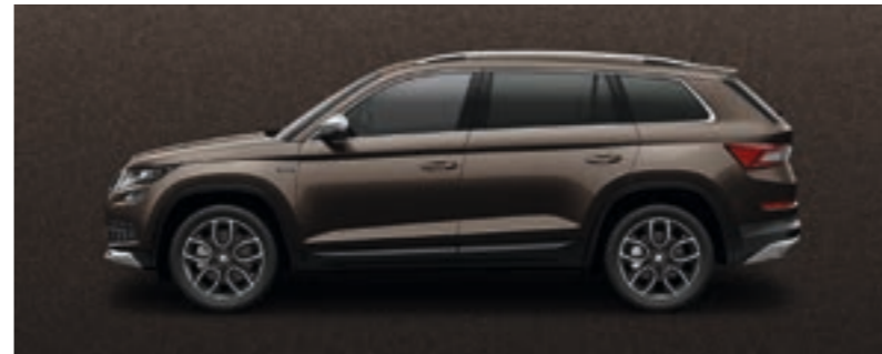
MAGNETIC BROWN METALLIC