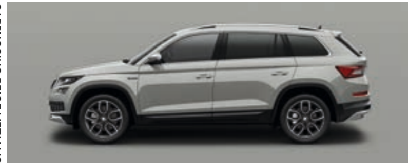
STEEL GREY UNI