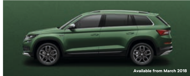
Available from March 2018