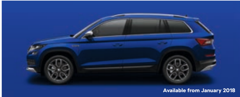
Available from January 2018