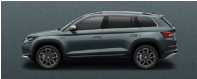
QUARTZ GREY METALLIC