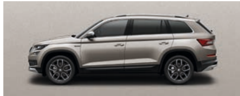
CAPPUCCINO BEIGE METALLIC