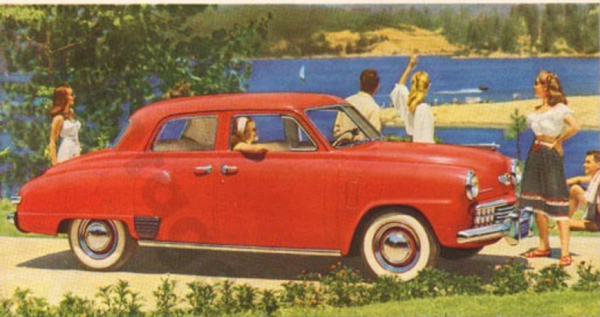
1948 Studebaker Champion Regal De Luxe 4-door Sedan for six passengers