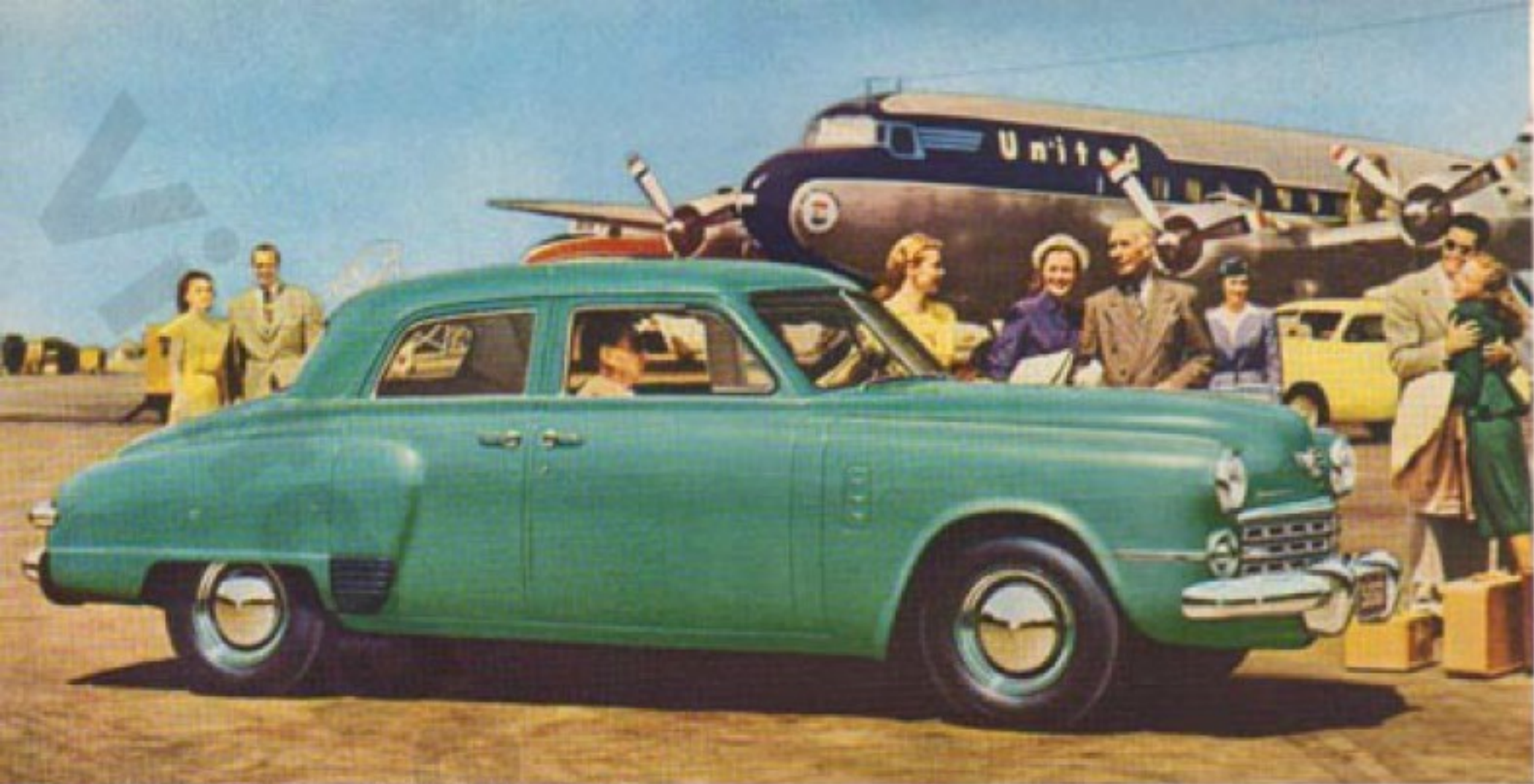
1948 Studebaker Commander De Luxe 4-door Sedan for six passengers