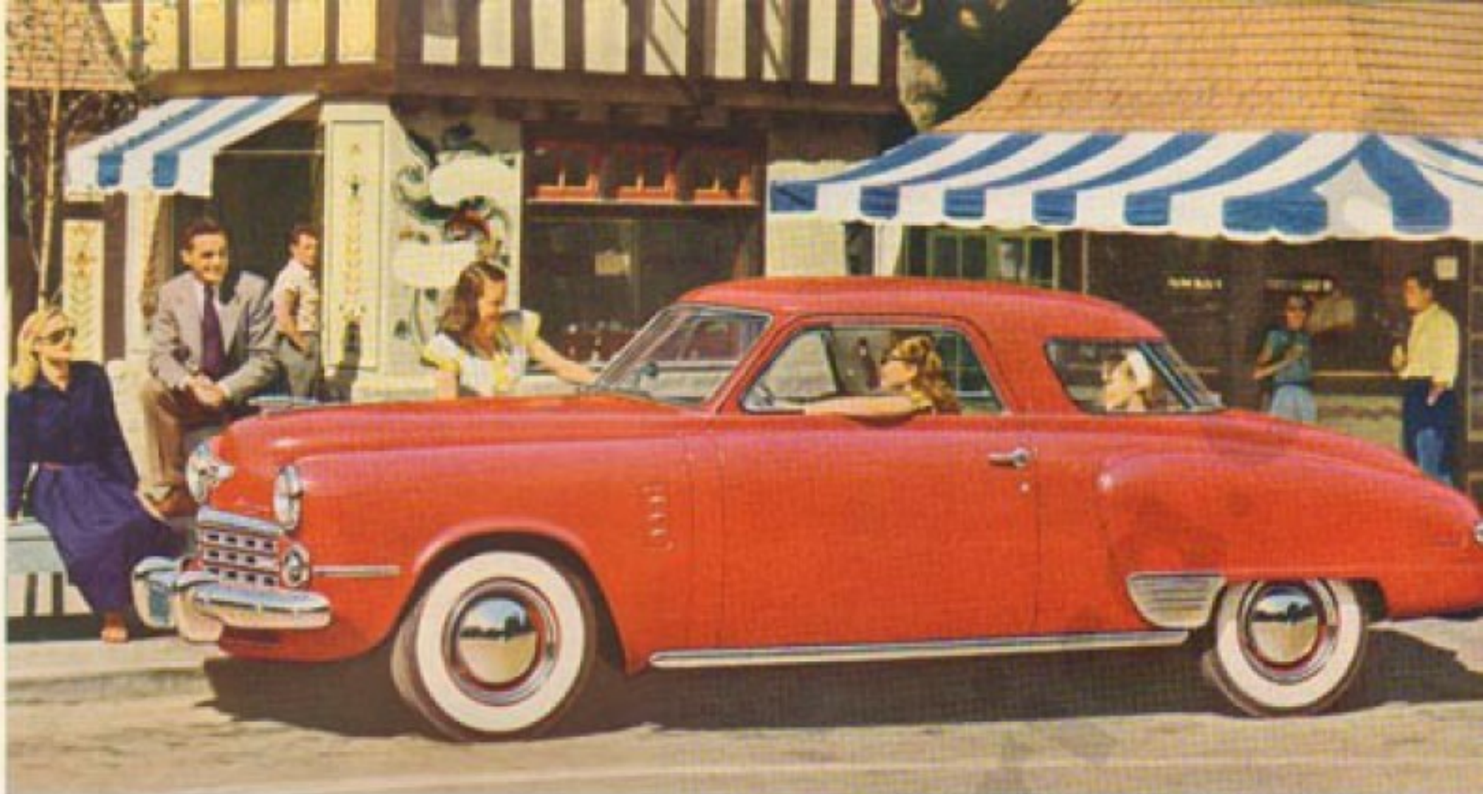
1948 Studebaker Commander Regal De Luxe Coupe for five passengers