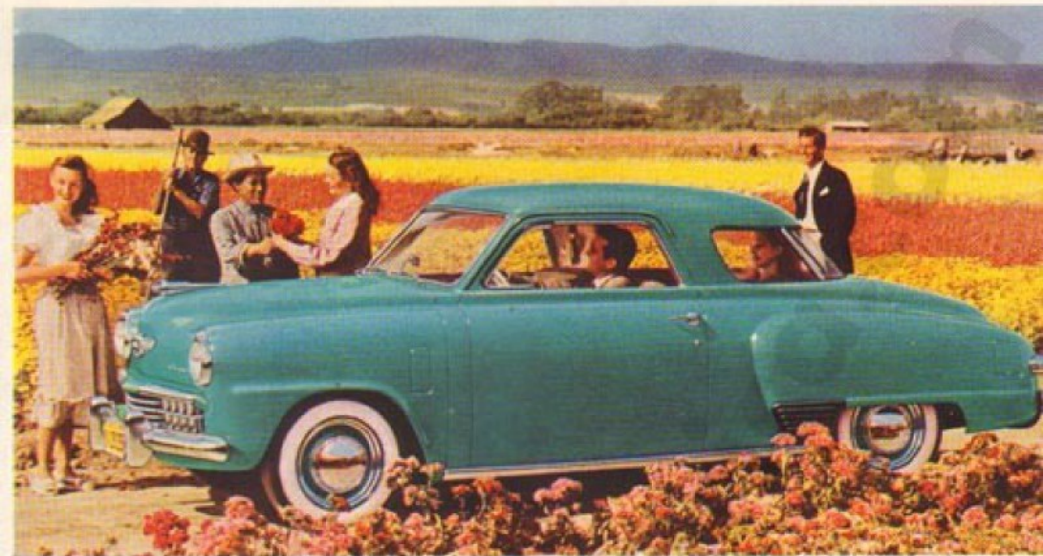
1948 Studebaker Champion Regal De Luxe Coupe for five passengers