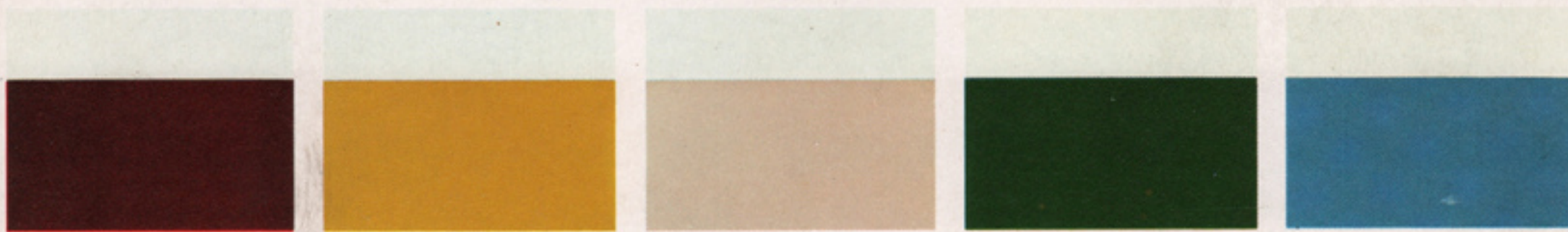
Pastel White Chianti Red