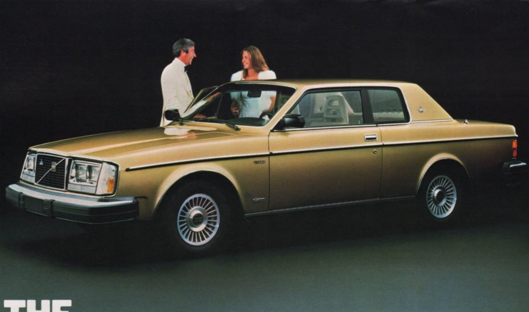
THE BERTONE COUPE IN CORONADO GOLD METALLIC.