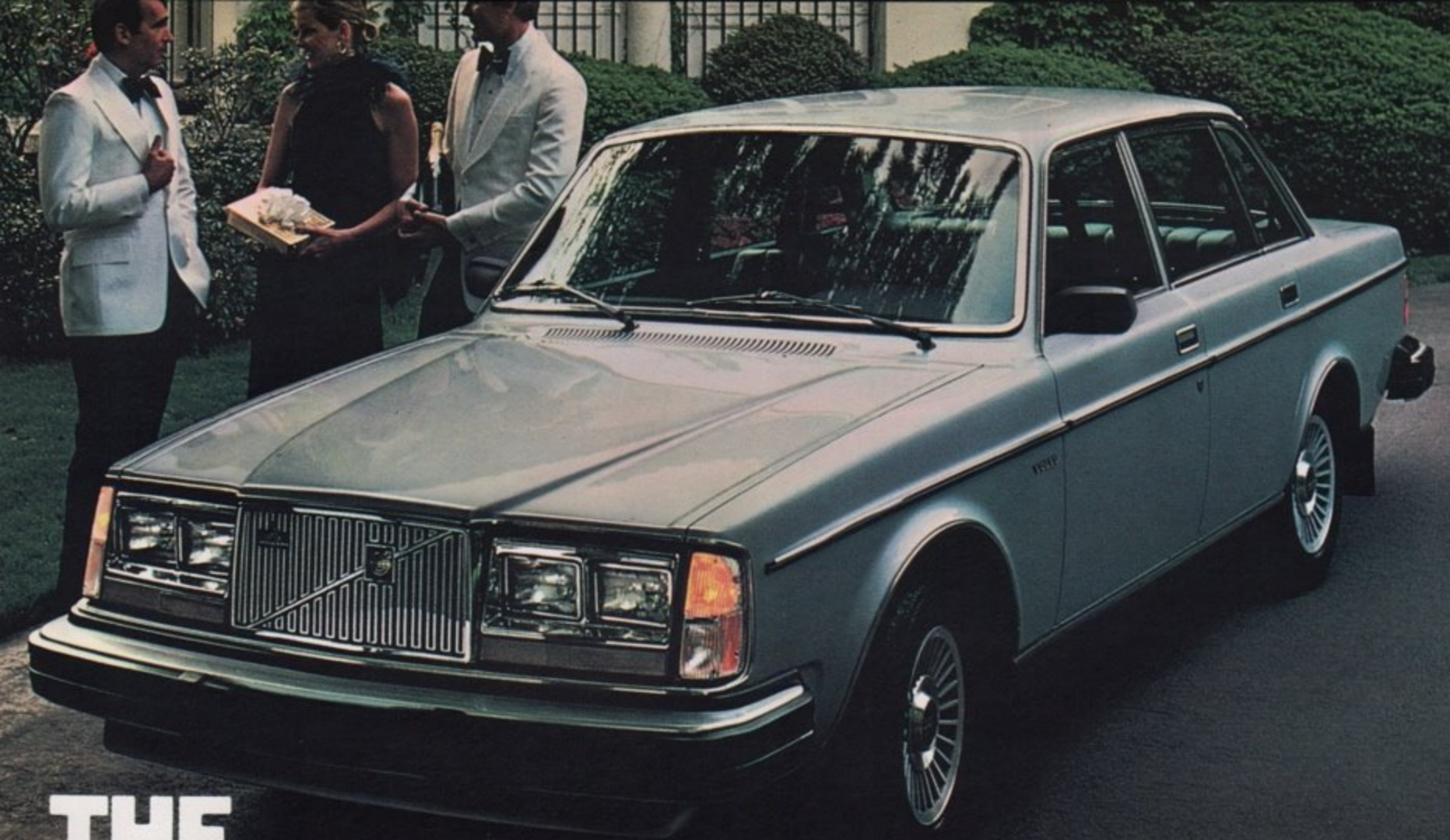
MYSTIC SILVER METALLIC GLE SEDAN.