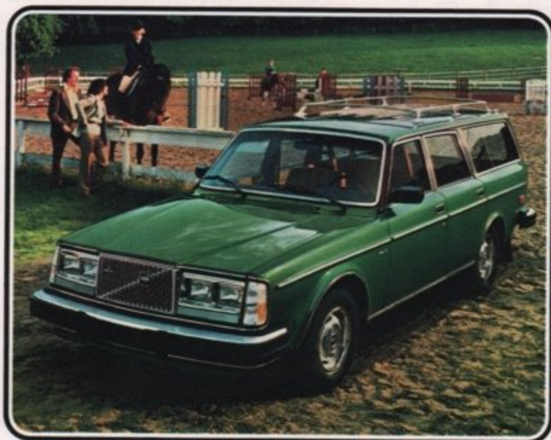
KINGSMERE GREEN METALLIC GLE WAGON WITH OPTIONAL ROOF RACK.

On all Volvo GLE sedans and wagons, luxury is standard; not added on.