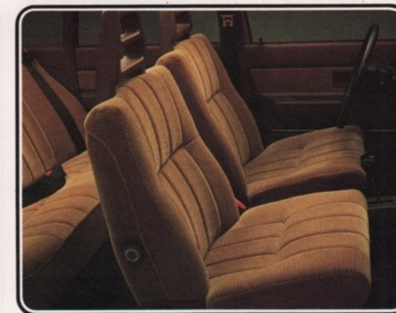
BEIGE VELOUR UPHOLSTERY IS STANDARD ON KINGSMERE GREEN METALLIC GL SEDANS.

The GL sedan is just right for the family that requires the economy of a four-cylinder engine—outward appearances to the contrary.