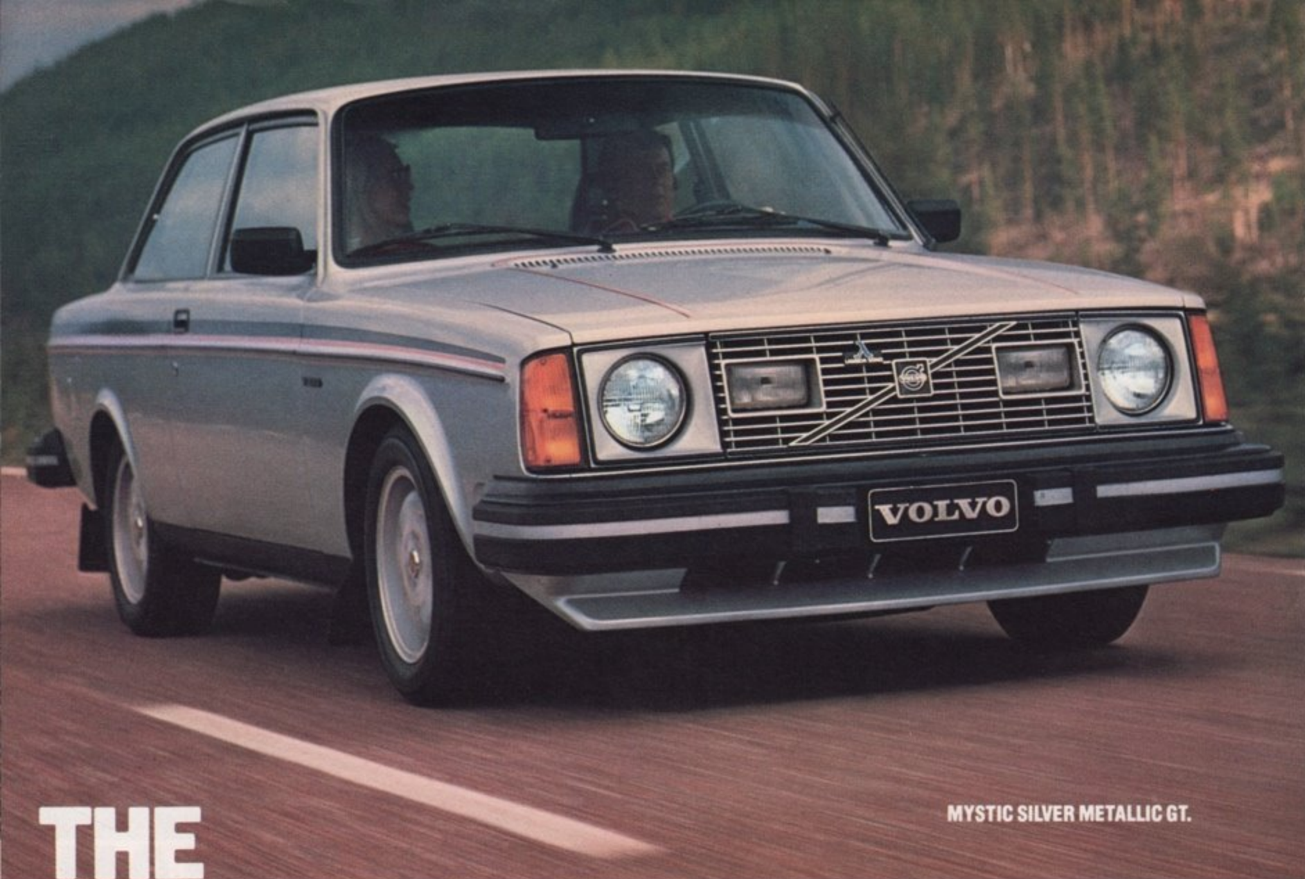
MYSTIC SILVER METALLIC GT.