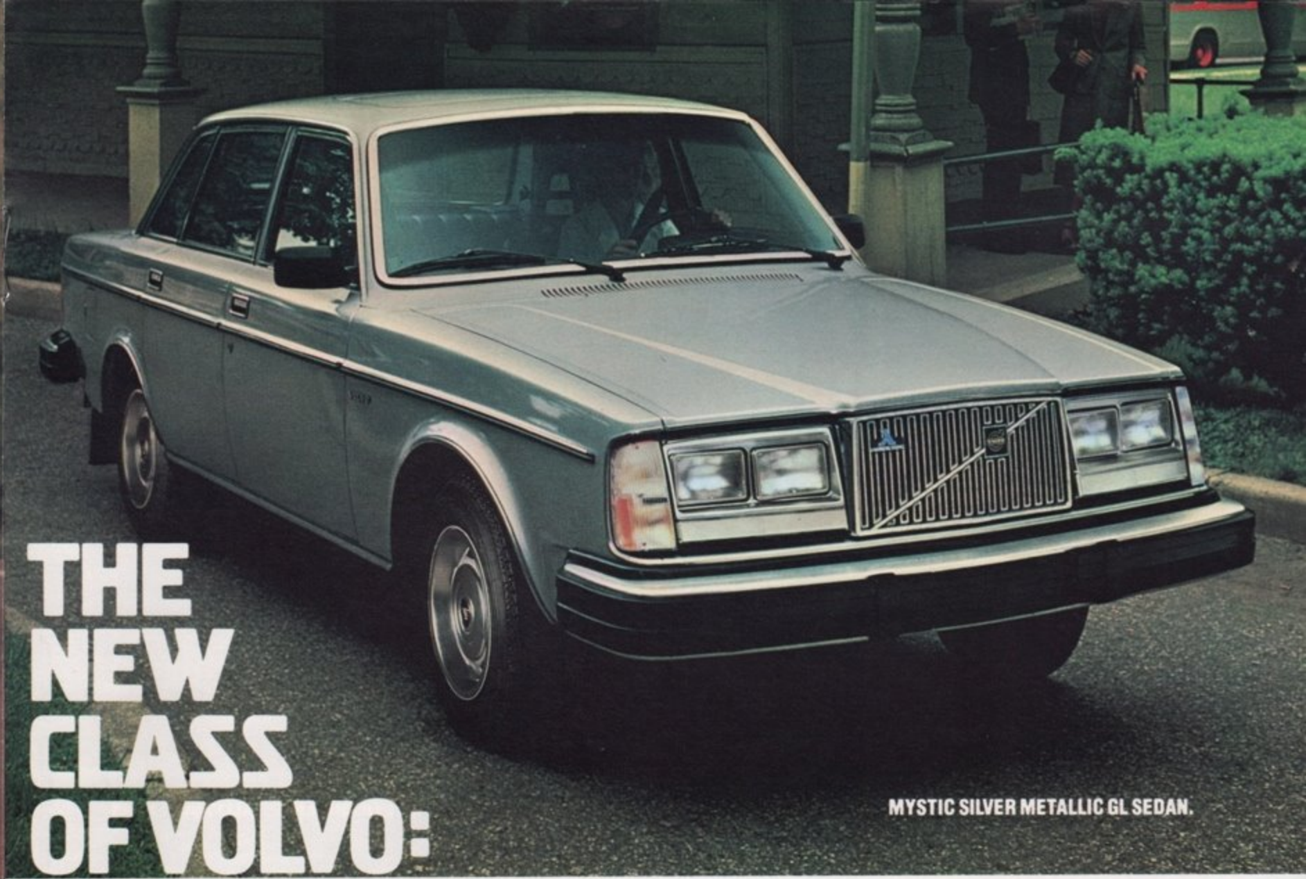
MYSTIC SILVER METALLIC GL SEDAN.