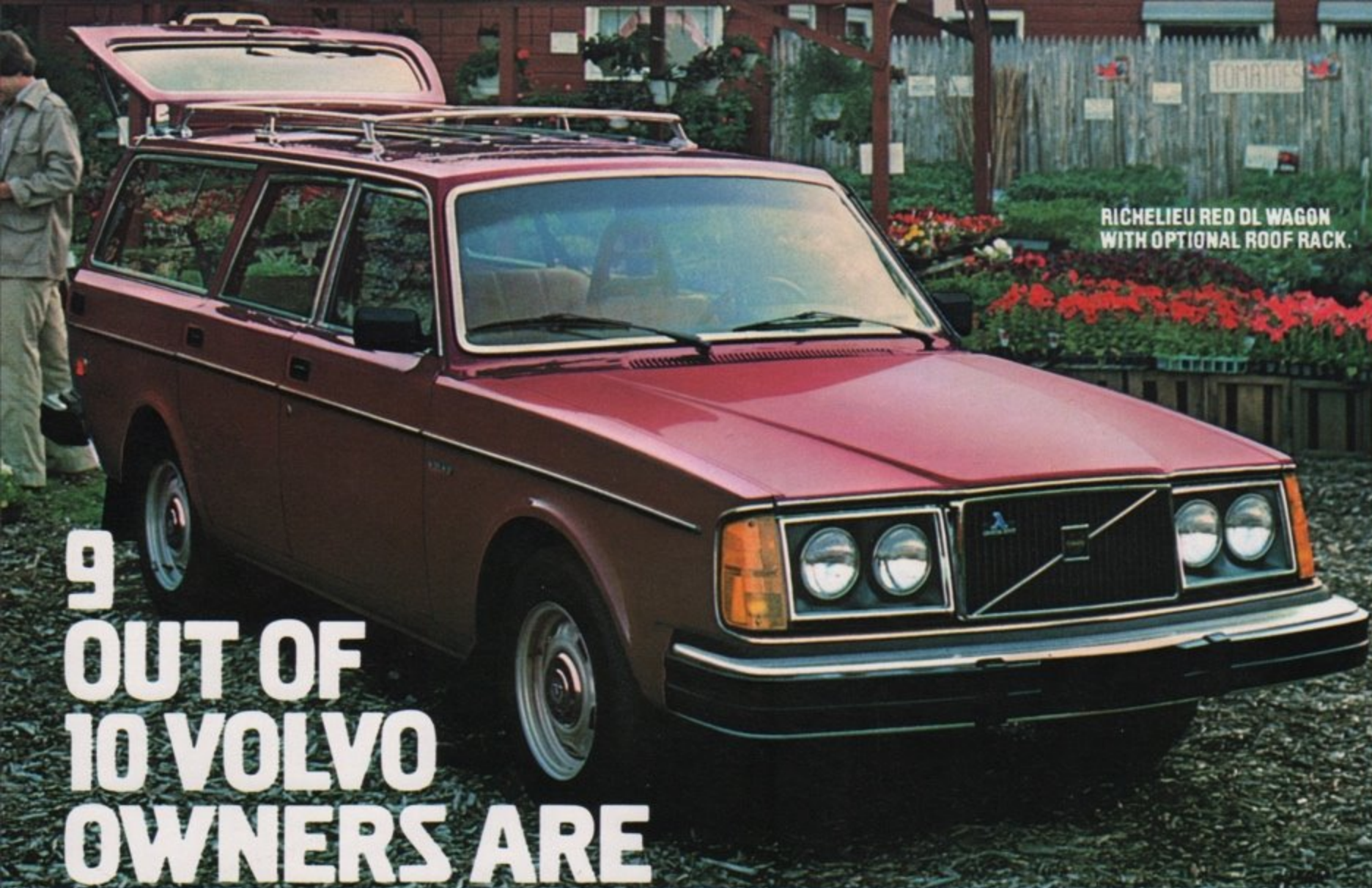
RICHELIEU RED DL WAGON WITH OPTIONAL ROOF RACK.