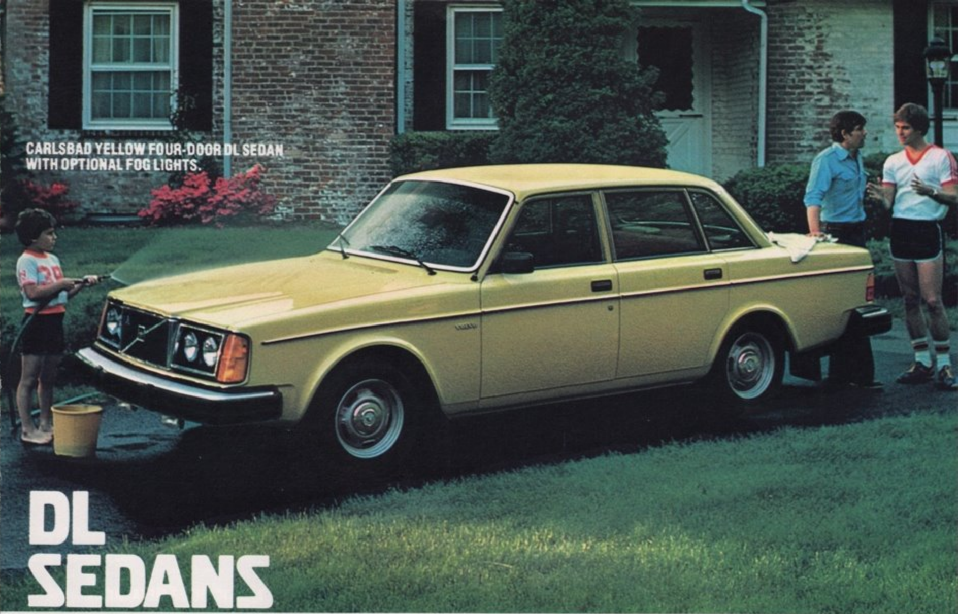
CARLSBAD YELLOW FOUR-DOOR DL SEDAN WITH OPTIONAL FOG LIGHTS.