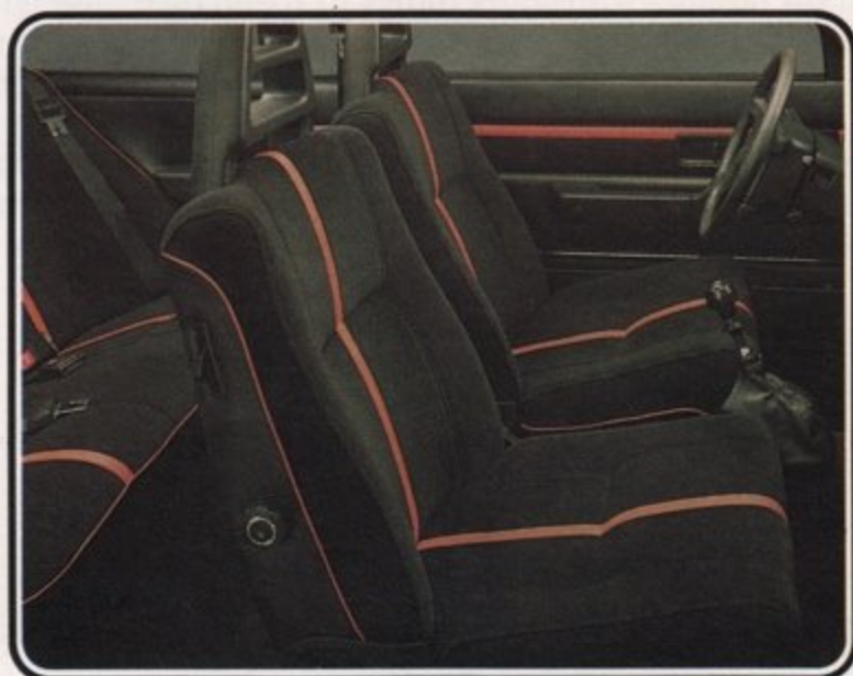
BLACK CORDUROY UPHOLSTERY WITH RED STRIPING.

The Volvo GT can give you an edge on the open road. And you won't have to sacrifice your standard of living to own one—because a Volvo GT won't leave your budget in the dust.