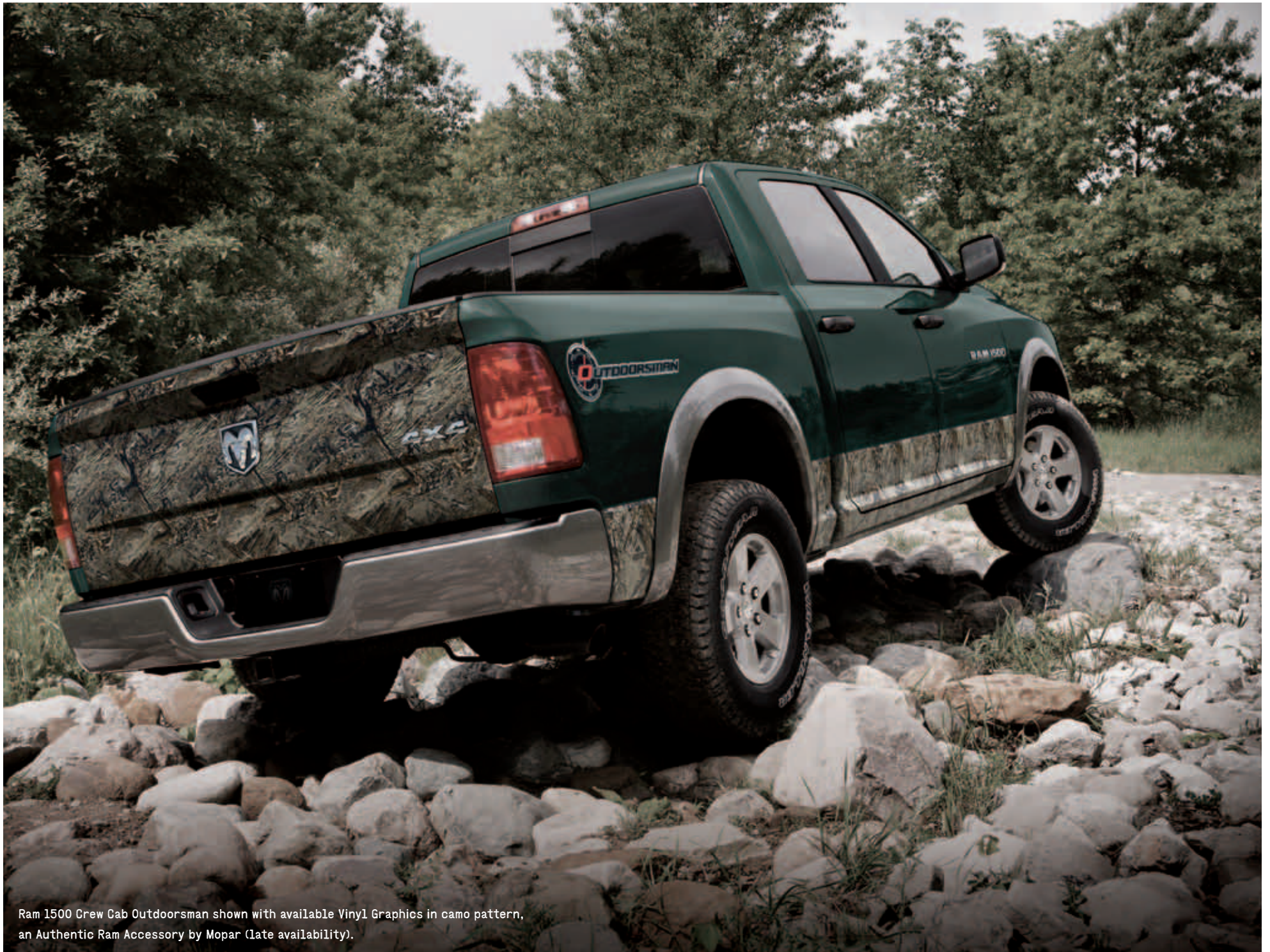
Ram 1500 Crew Cab Outdoorsman shown with available Vinyl Graphics in camo pattern, an Authentic Ram Accessory by Mopar (Late availability).