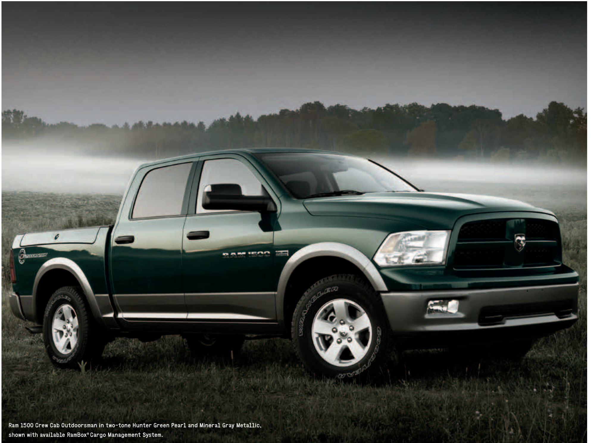
Ram 1500 Crew Cab Outdoorsman in two-tone Hunter Green Pearl and Mineral Gray Metallic, shown with available RamBox® Cargo Management System.