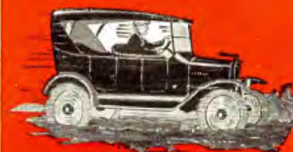
Safely Travels through Muddy and Sandy Roads