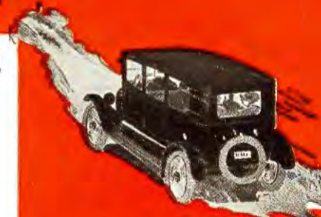
Climbs Hills without Exertion of the Engine