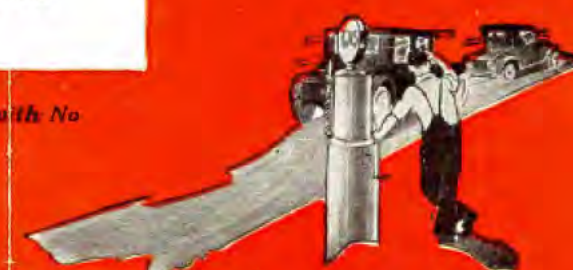
Less Gas Used, which means Lower Upkeep