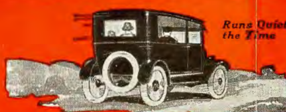
Runs Quietly All the Time