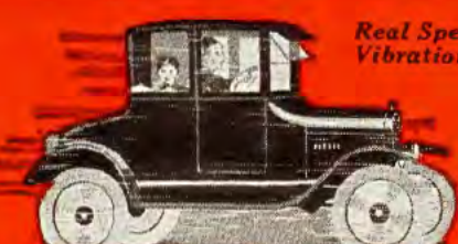
Real Speed with No Vibration