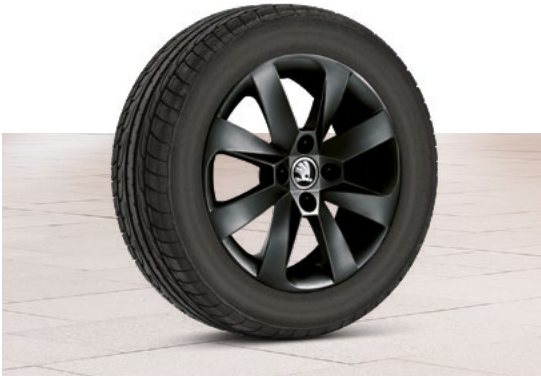
15" CRUX ALLOY WHEELS - IN A CHOICE OF BLACK OR WHITE

Eye-catching in every way, the Colour Edition is packed with extra equipment and offers a wide choice of contrasting roof and body colours.