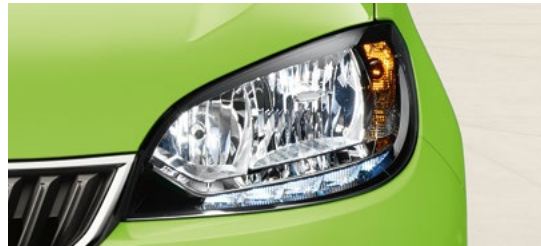
HALOGEN TWIN HEADLIGHTS WITH SEPARATE LED DAYTIME RUNNING LIGHTS