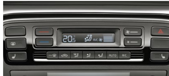
CLIMATE CONTROL AIR CONDITIONING