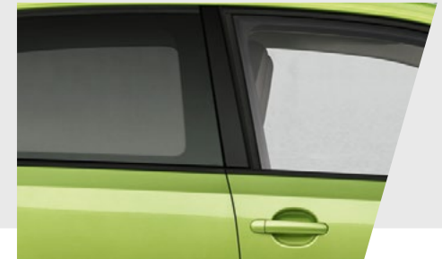
PRIVACY GLASS ON THE REAR WINDOWS