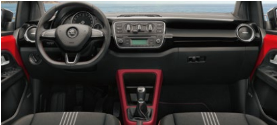
MONTE CARLO INTERIOR STYLING

A celebration of ŠKODA's many adventures on the racetrack, this level features dynamic design touches and includes an exclusive Monte Carlo logo throughout.