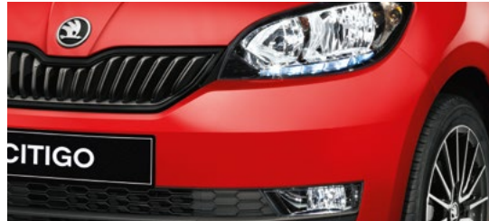
MONTE CARLO EXTERIOR STYLING