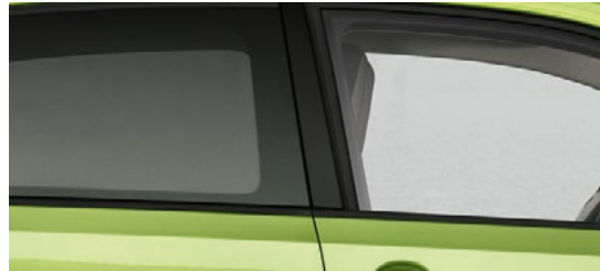
PRIVACY GLASS ON THE REAR WINDOWS