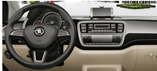
LEATHER STEERING WHEEL WITH GRAIN DASHBOARD