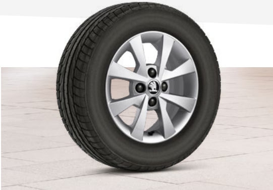
14" APUS ALLOY WHEELS

Already one of the best-equipped small cars in the city, the SE adds further style and comfort enhancing features.