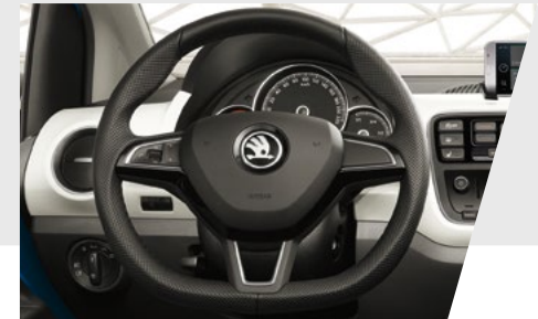
LEATHER MULTIFUNCTION STEERING WHEEL