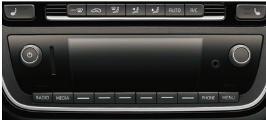
RADIO BLUES WITH CD PLAYER, USB PORT AND TWO SPEAKERS

Packed with thoughtful touches and clever technology, this entry-level trim offers impressive value for money.