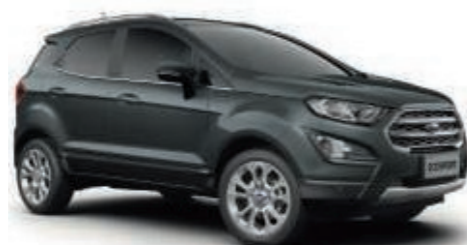
Magnetic Exclusive body colour*