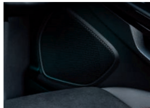
EcoSport ST-Line with B&O premium audio system (available as part of the optional X-Pack).