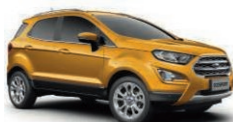
Luxe Yellow Exclusive body colour*