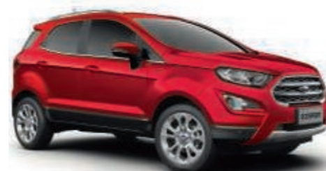
Lucid Red Tinted clear coat body colour*

*At extra cost. The Ford EcoSport is covered by the Ford Perforation Warranty for 12 years from the date of first registration. Subject to terms and conditions.