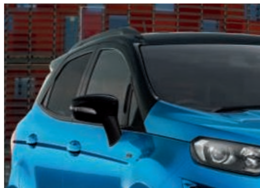
EcoSport ST-Line shown with Desert Island Blue and Contrast Roof in Agate Black (option).