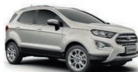
Metropolis White Metallic body colour