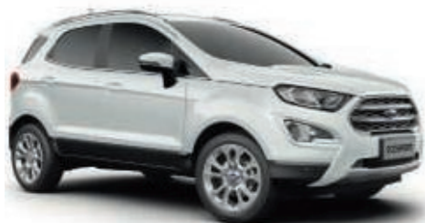
Frozen White Premium body colour*