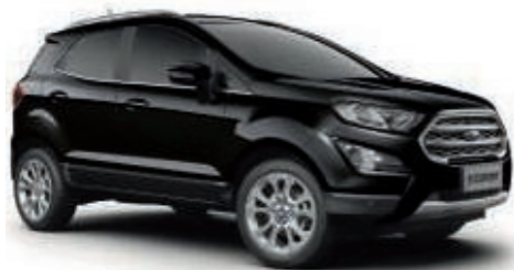
Agate Black Metallic body colour*