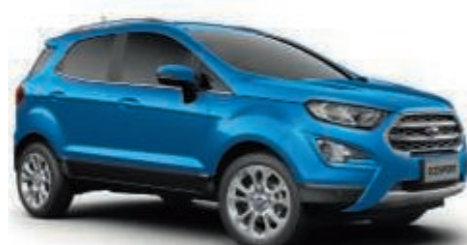
Desert Island Blue Metallic body colour*