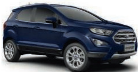
Blazer Blue Solid body colour