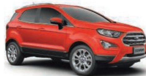
Race Red Solid body colour*