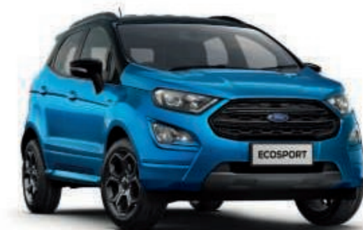
ST-Line and ST-Line with X Pack (option)

With its superior levels of sophistication and comfort, EcoSport Titanium delivers an exceptional driving experience.