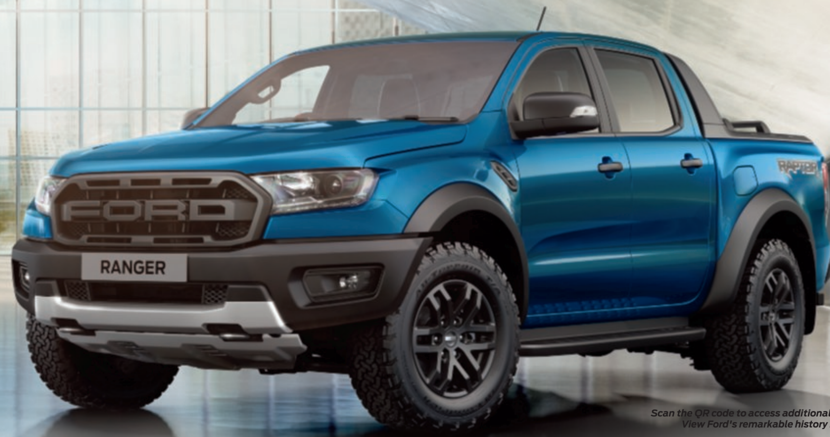
Above: Model shown is a Double Cab Ranger Raptor in Ford Performance Blue metallic body colour (option).

Scan the QR code to access additional content. View Ford's remarkable history in action.