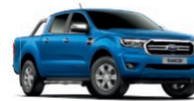
Blue Lightning Metallic body colour*