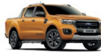
Sabre Orange Fashion Metallic body colour* (Wildtrak only)