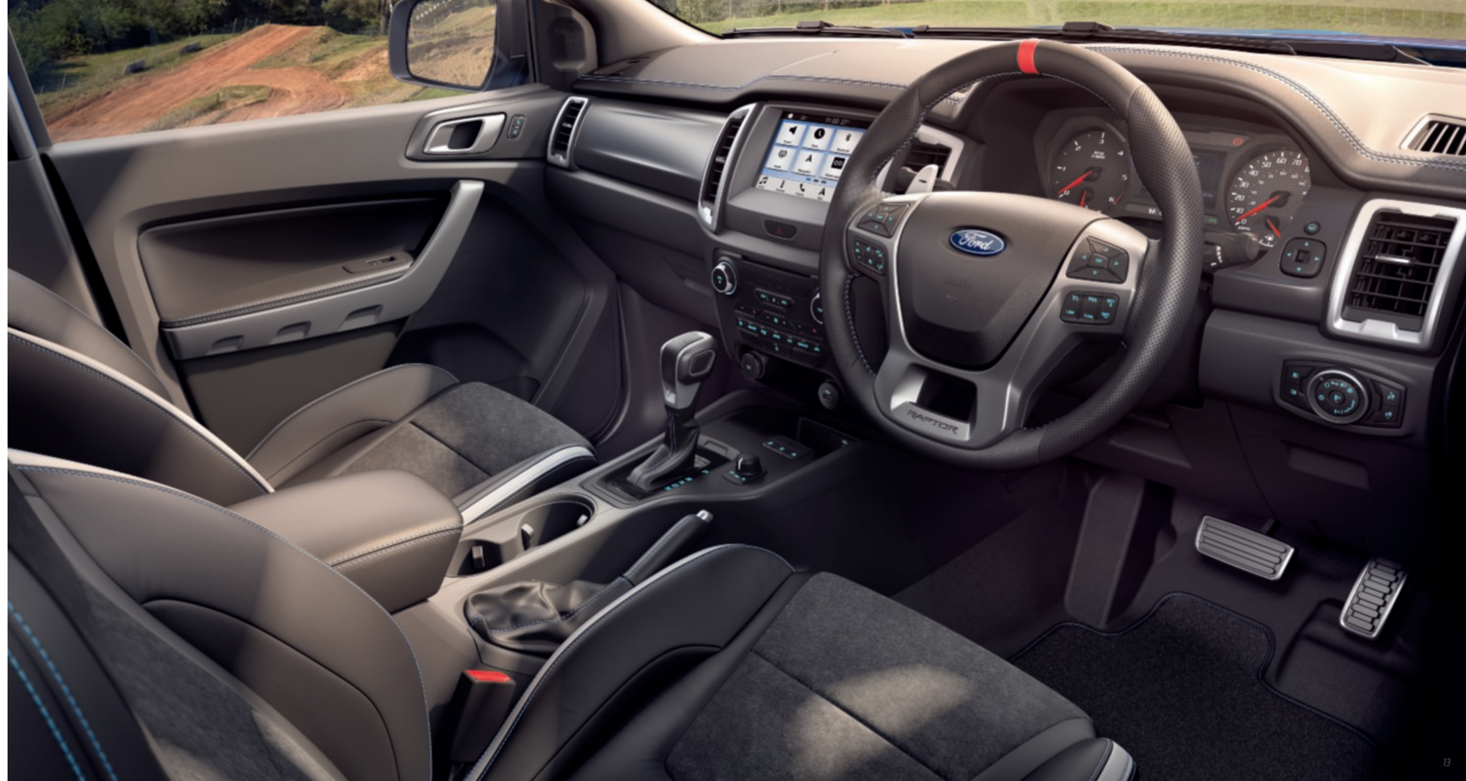
Model shown is a Ranger Raptor with 10-speed automatic transmission (standard).

From now on, you will view every road and every drive from an entirely new perspective.