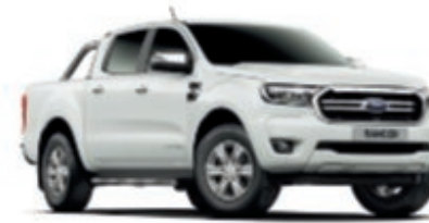
Frozen White Solid body colour