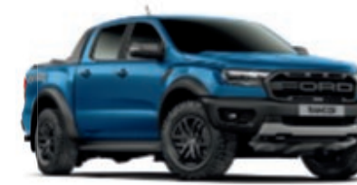
Ford Performance Blue Fashion Metallic body colour* (Ranger Raptor only)