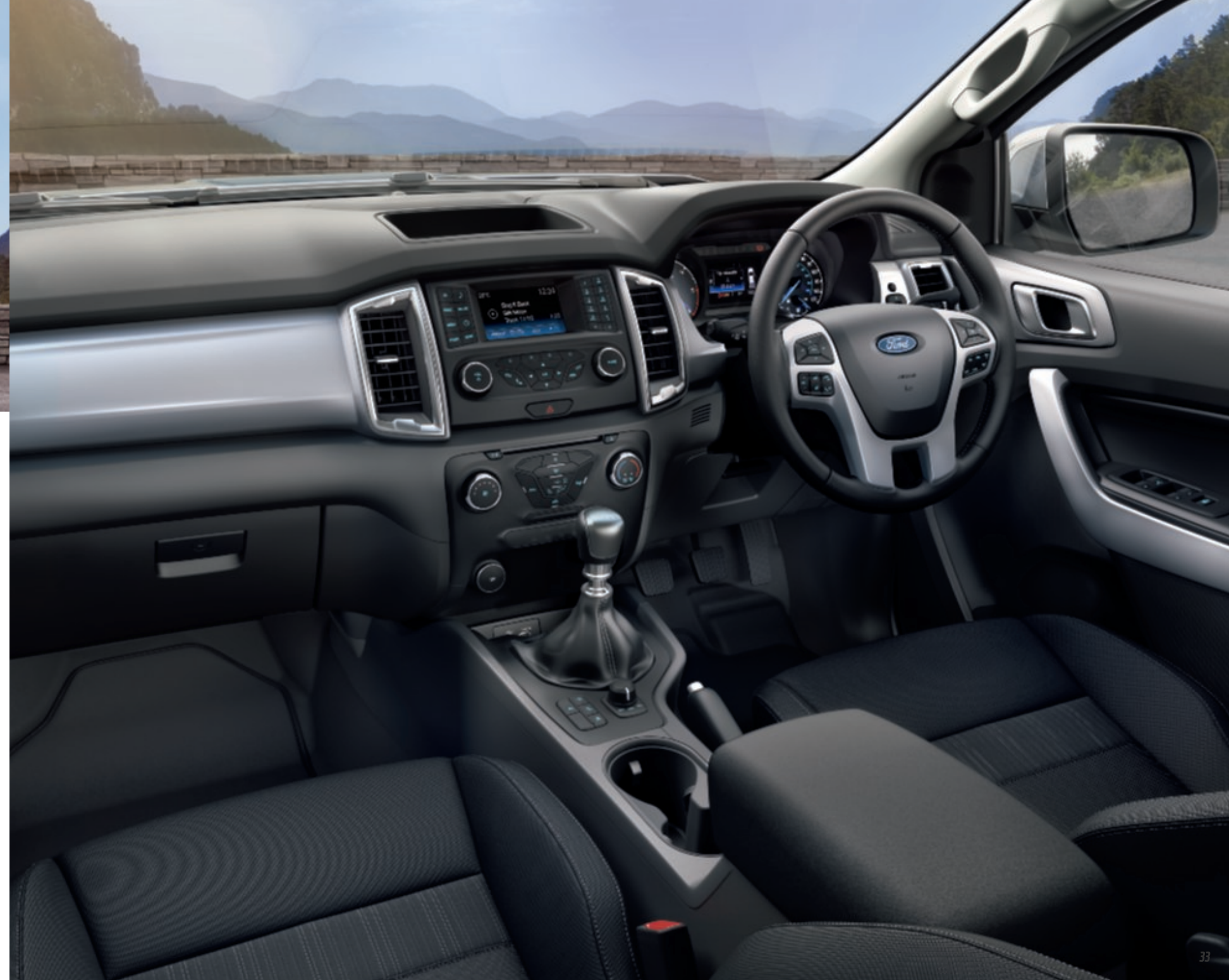
Model shown is a Double Cab XLT in Sea Grey metallic body colour (option).

Change from two-wheel drive to four-wheel drive – and back again – at the flick of a switch when you're on the move.