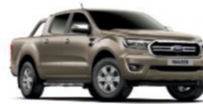
Diffused Silver Metallic body colour*