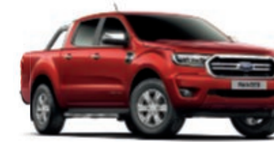
Copper Red Metallic body colour*