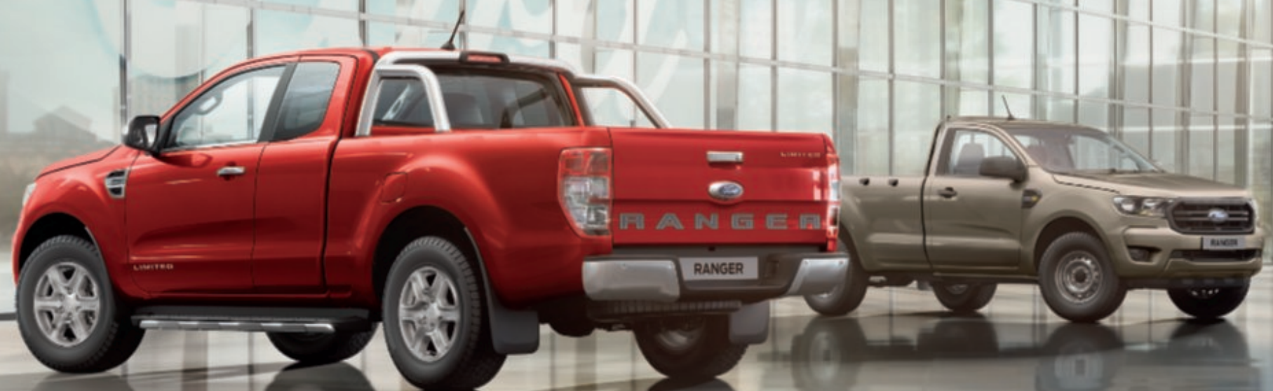
Left: Model shown is a Super Cab Limited in Copper Red metallic body colour (option).