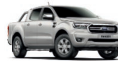
Moondust Silver Metallic body colour*