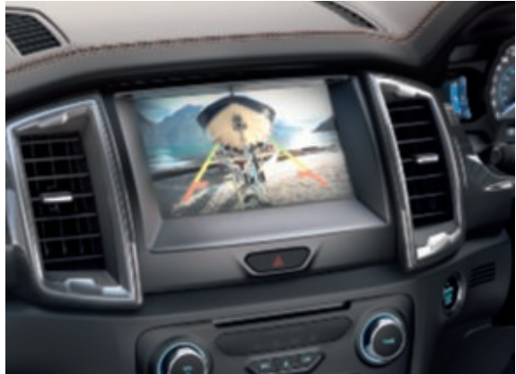
Rear-view camera with Trailer Hitch Assist Select reverse and the view to the rear of your Ranger vehicle is displayed in the Multi-Functional Display screen. Marker lines overlaid on the camera image indicate where your vehicle is heading. (Standard on Limited and above)

New Ranger is available with an even greater range of driver assistance features to help make your day easier. Whether you are working hard or playing hard, you can depend on New Ranger to extend a helping hand.