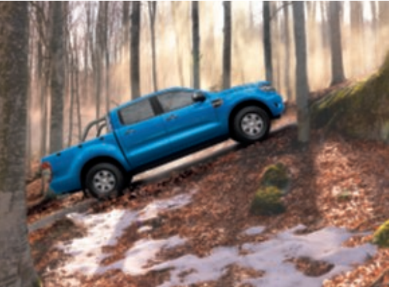
Hill Start Assist ®2) Designed to temporarily prevent you from rolling down a slope when you move your foot from the brake pedal to the accelerator pedal. It works in forward and reverse gears, and can be used when towing and pulling loads. (Standard)