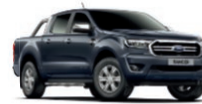
Sea Grey Metallic body colour*