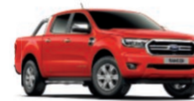
Colorado Red Solid body colour