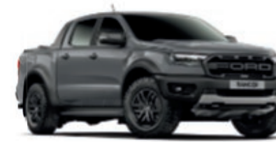
Conquer Grey Premium body colour* (Ranger Raptor only)