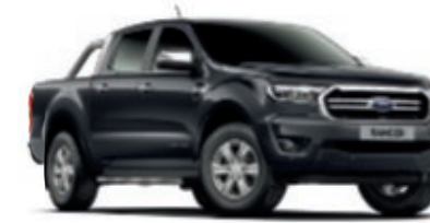
Shadow Black Premium body colour*