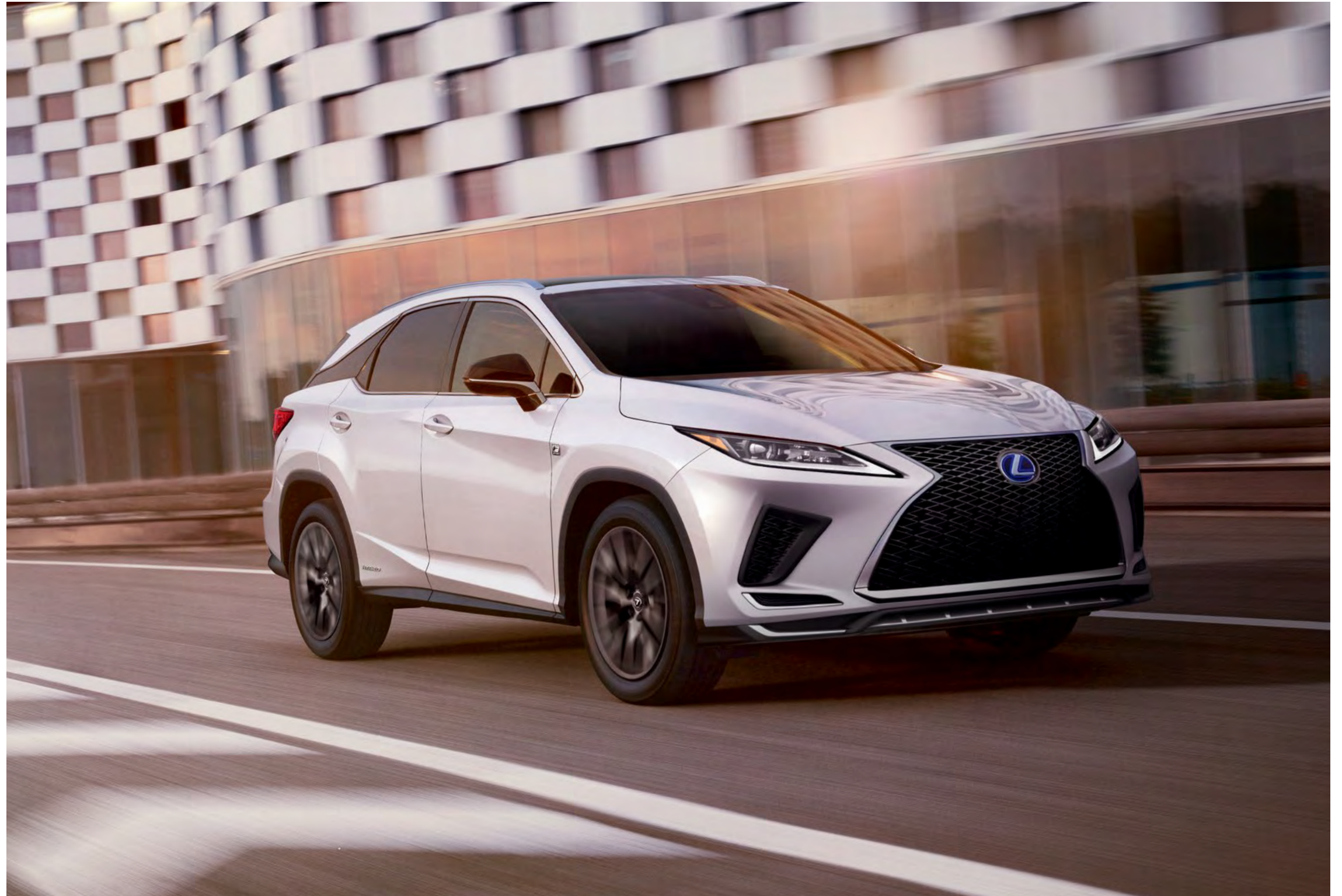
RXh F SPORT shown in Ultra White 9

Craving more of an edge? The RX 450h F SPORT adds bold styling and offers an Adaptive Variable Suspension that takes exhilaration even further.