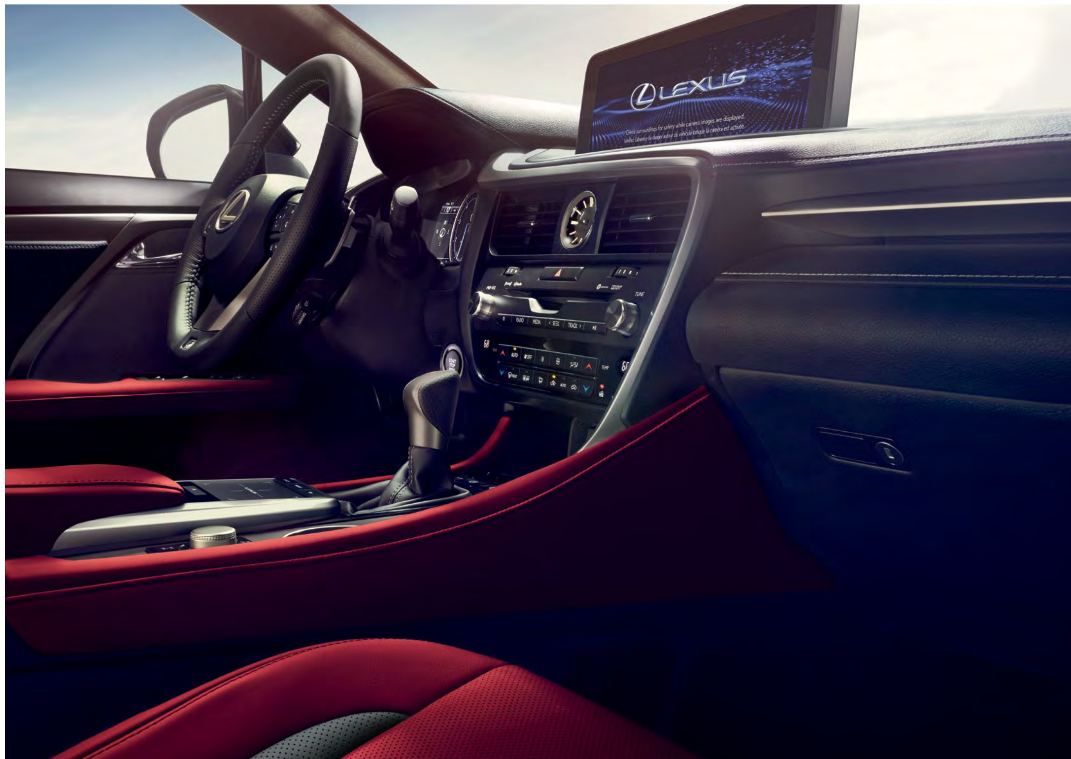
RX F SPORT shown with Circuit Red NuLuxe ®10 and Scored Aluminum interior trim

Customize the climate around you. Individual settings allow the driver and front passenger to adjust their preferred temperatures. Plus, the RX 350L and RX 450hL feature dedicated climate control for passengers in the third row. To help ensure the cabin stays fresh, an available smog-sensing climate-control system automatically switches into recirculation mode if it senses high levels of pollutants outside.