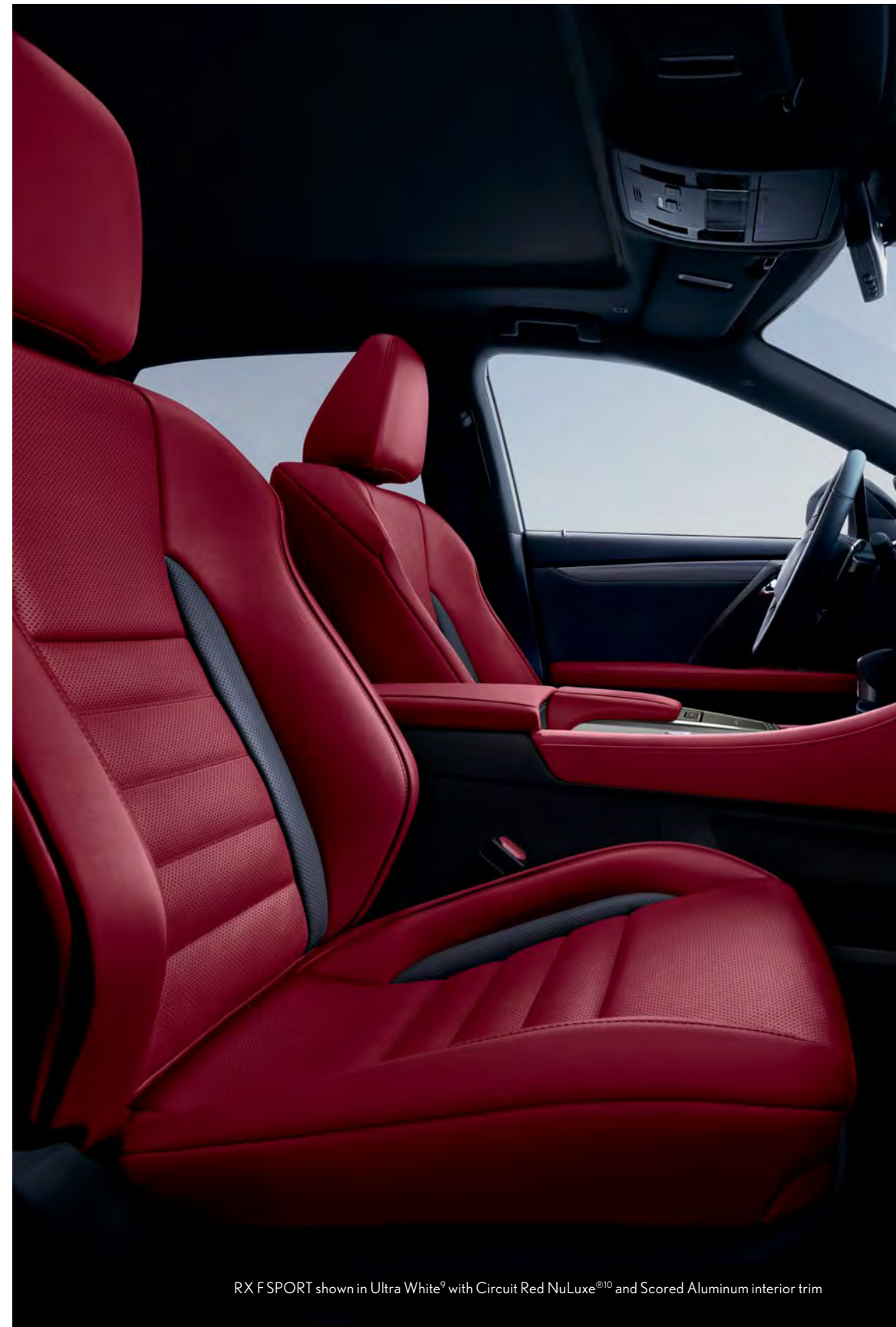
RX F SPORT shown in Ultra White 9 with Circuit Red NuLuxe ®10 and Scored Aluminum interior trim