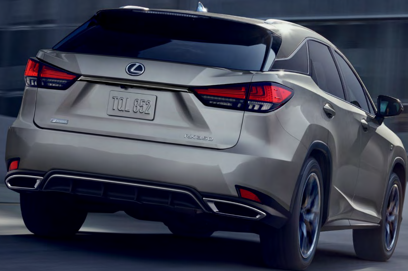
RX F SPORT shown in Atomic Silver