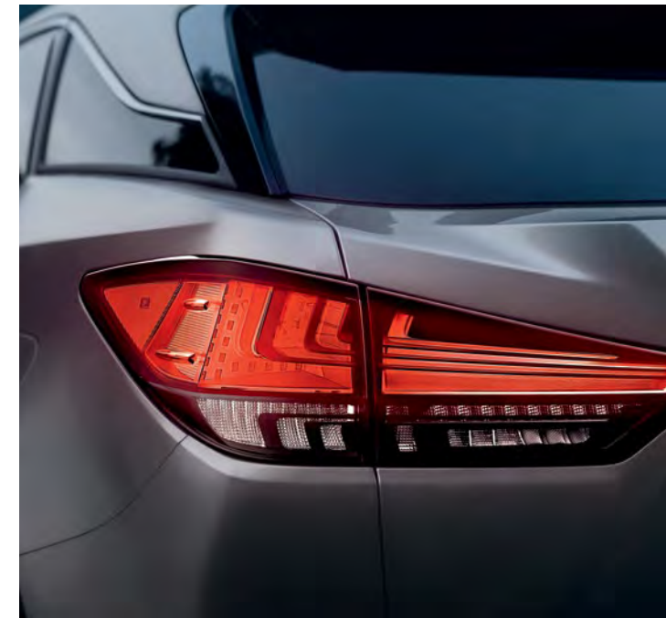
RX shown in Nightfall Mica

From its expressive headlamps and taillamps to its bold character lines, every element of the 2021 RX is crafted to captivate.