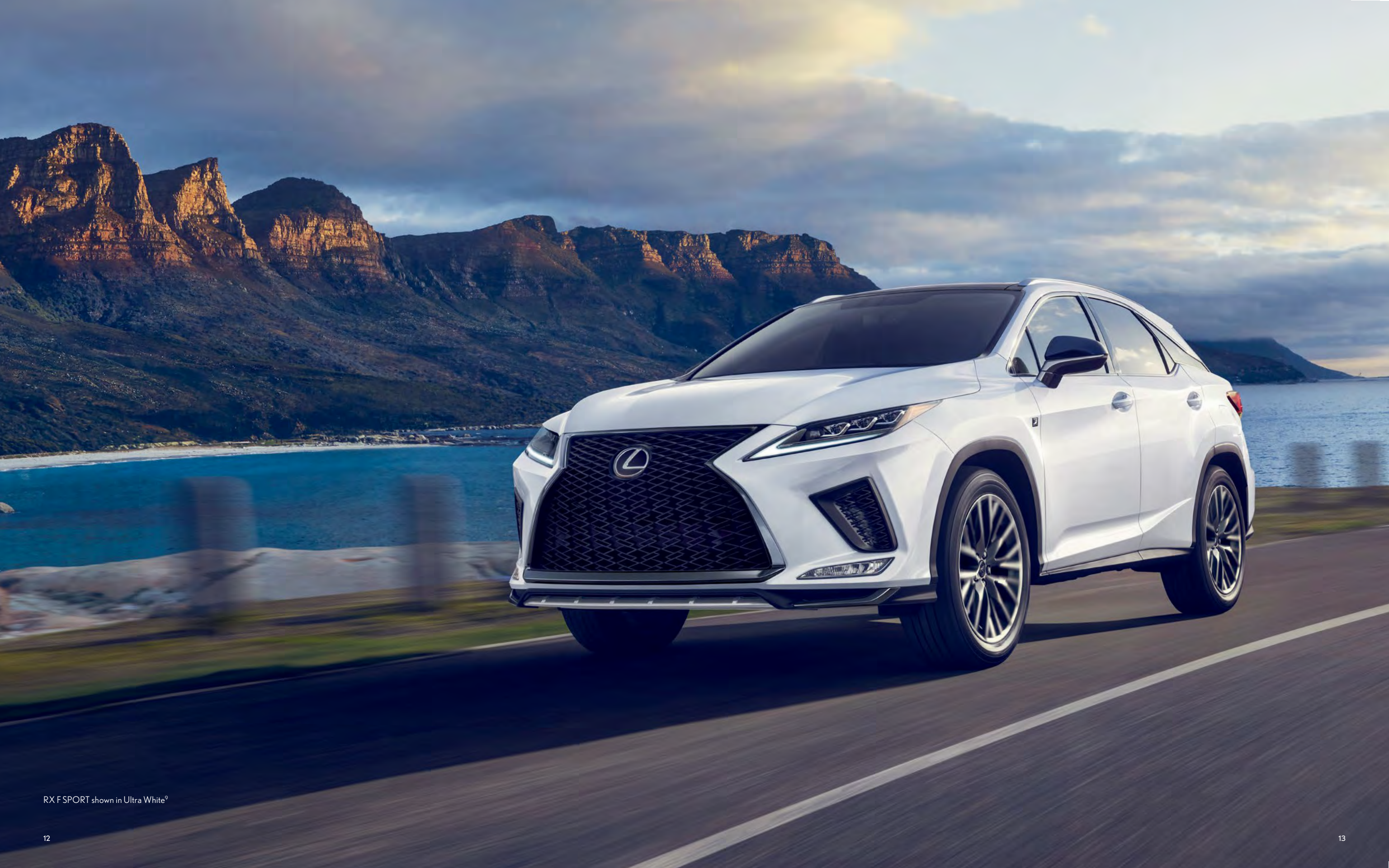
RX F SPORT shown in Ultra White 9