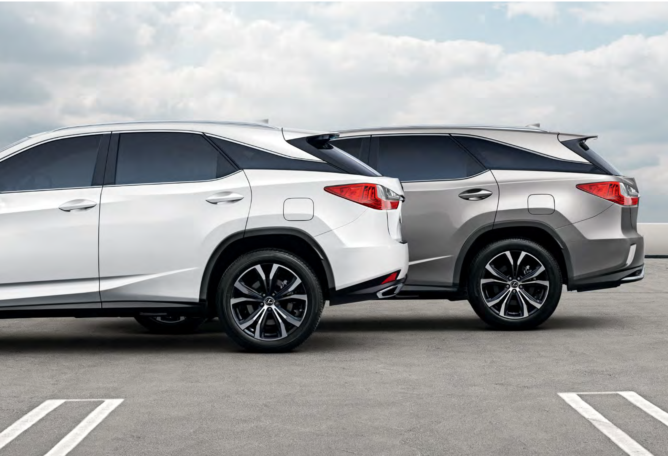
RX shown in Eminent White Pearl 9 (left), RXL shown in Atomic Silver (right)