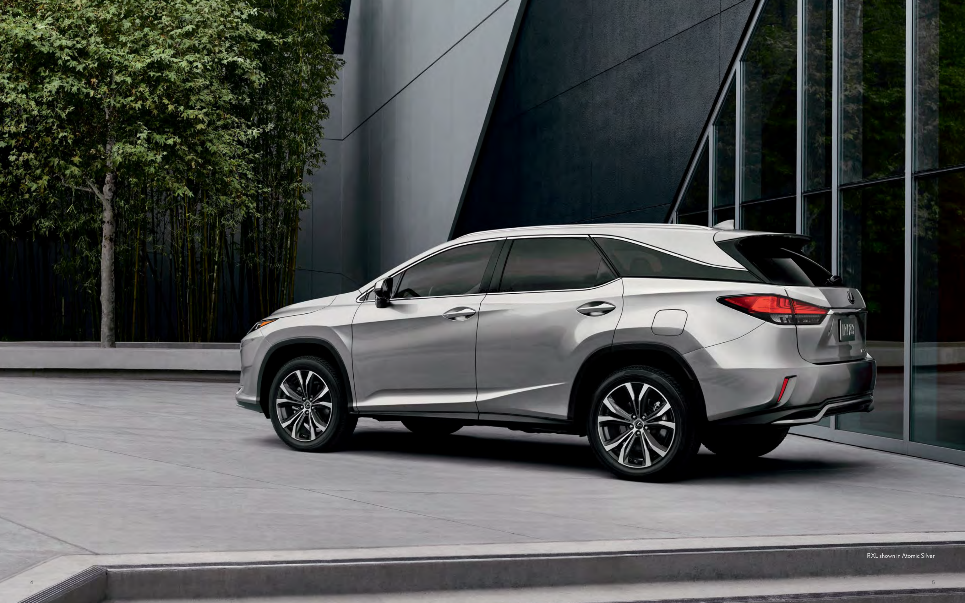
RXL shown in Atomic Silver