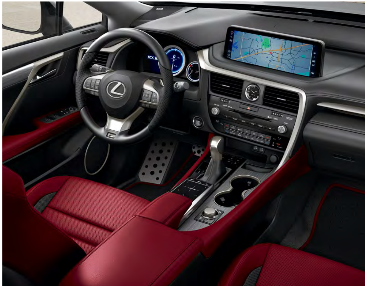
RX F SPORT shown with Circuit Red NuLuxe ®10 and Scored Aluminum interior trim

The bold F SPORT perspective is obvious throughout the driver-centric interior. In addition to exclusive race-inspired instrumentation and bold aluminum accents, you'll find performance upgrades, including bolstered sport seats, a black headliner, a perforated leather-trimmed sport steering wheel and shift knob, plus aluminum pedals and more.