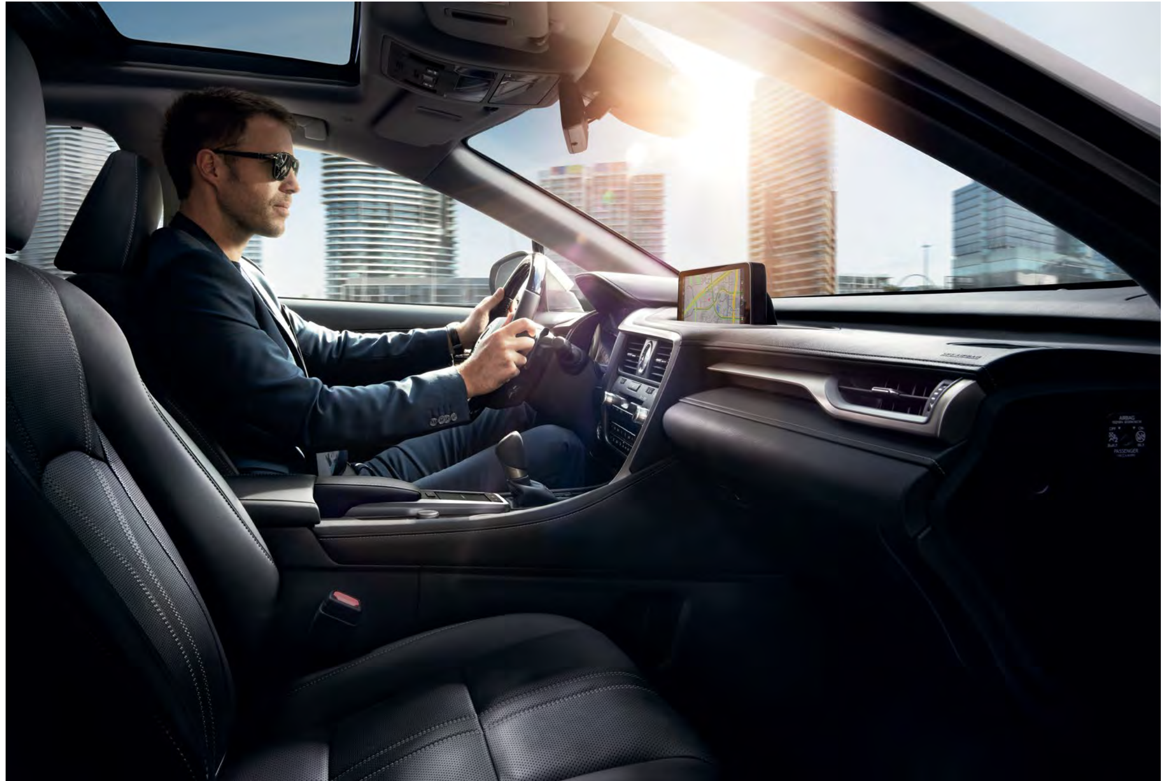
RX shown with Black semi-aniline leather and Gray Sapele wood with Aluminum interior trim