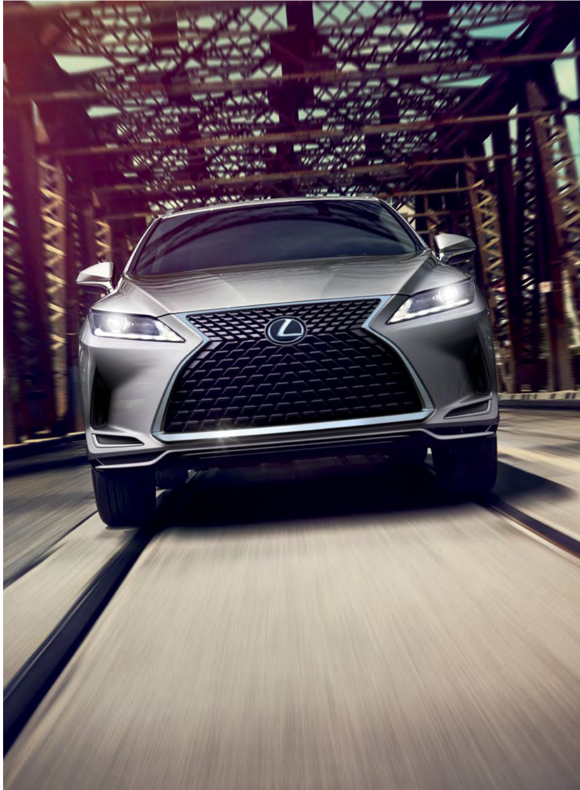
RX shown in Atomic Silver