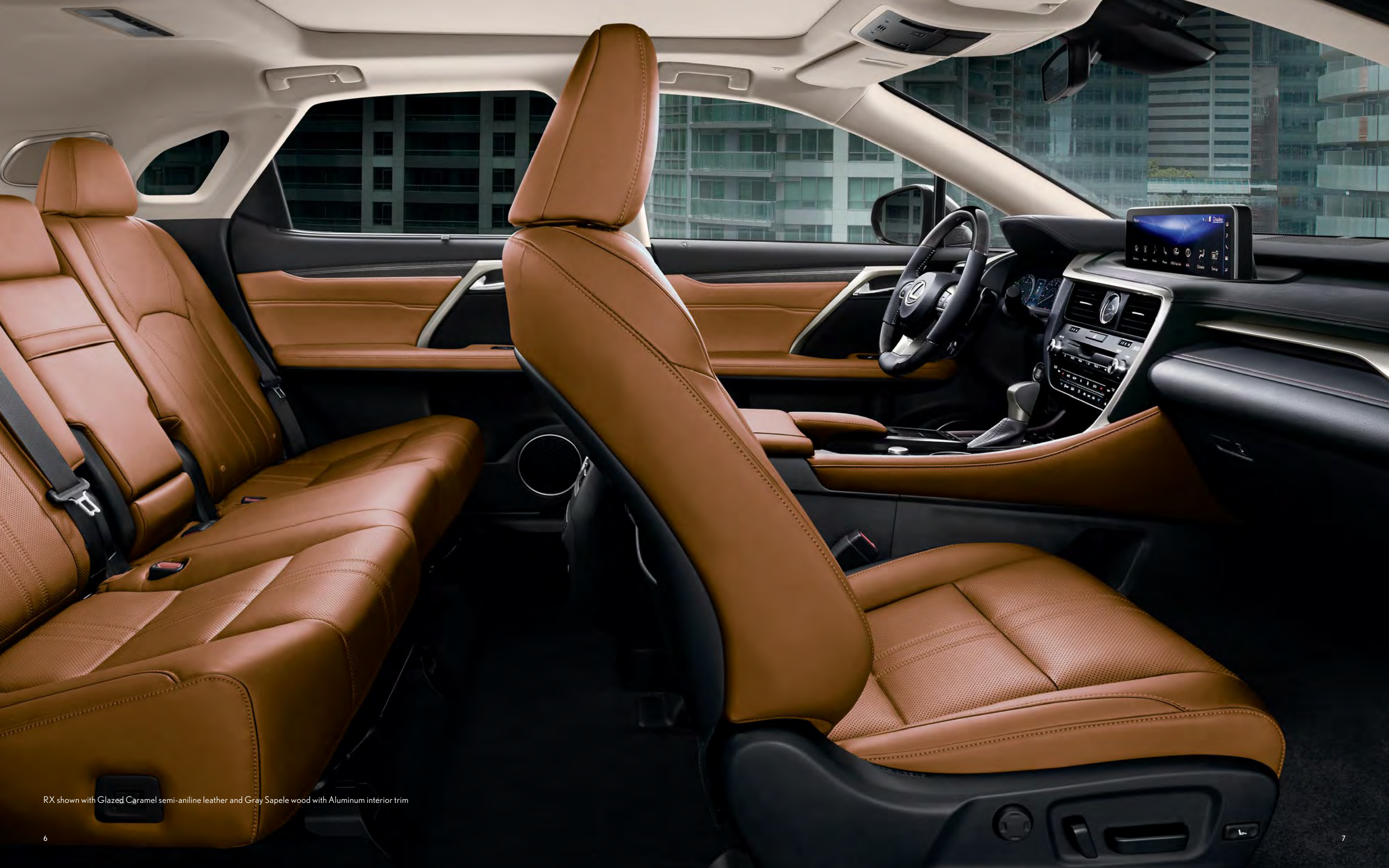
RX shown with Glazed Caramel semi-aniline leather and Gray Sapele wood with Aluminum interior trim