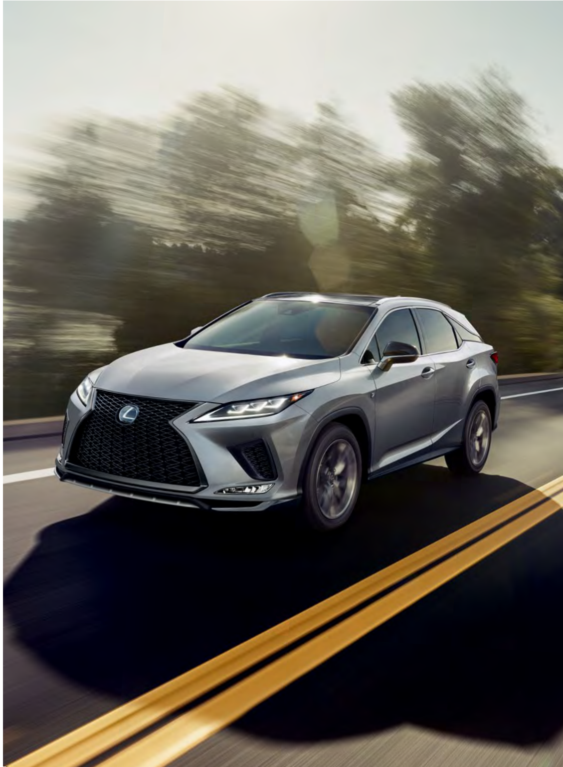
RX F SPORT shown in Atomic Silver