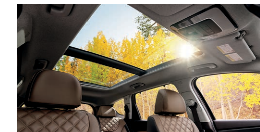
Power panoramic sunroof