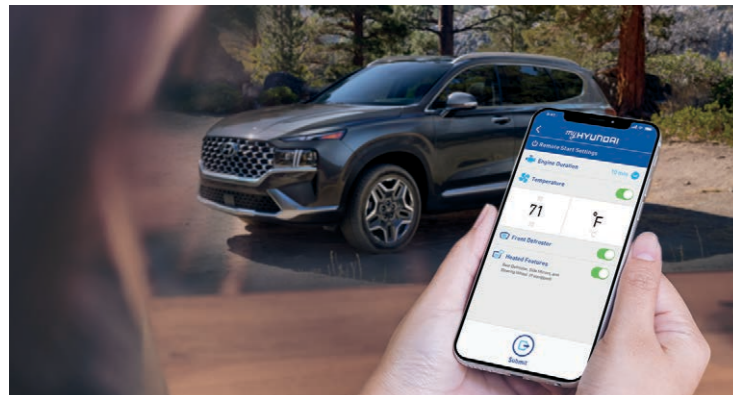
Blue Link Remote

Every Santa Fe Hybrid comes standard with Apple CarPlay ® and Android Auto, ™ and you can now connect two phones to the audio system simultaneously via Bluetooth streaming. 5 Good to know you can easily keep your digital devices powered up, too. A wireless charging pad is available, 6 and dual front and rear USB charge ports are standard.