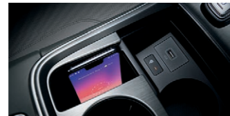
Wireless device charging