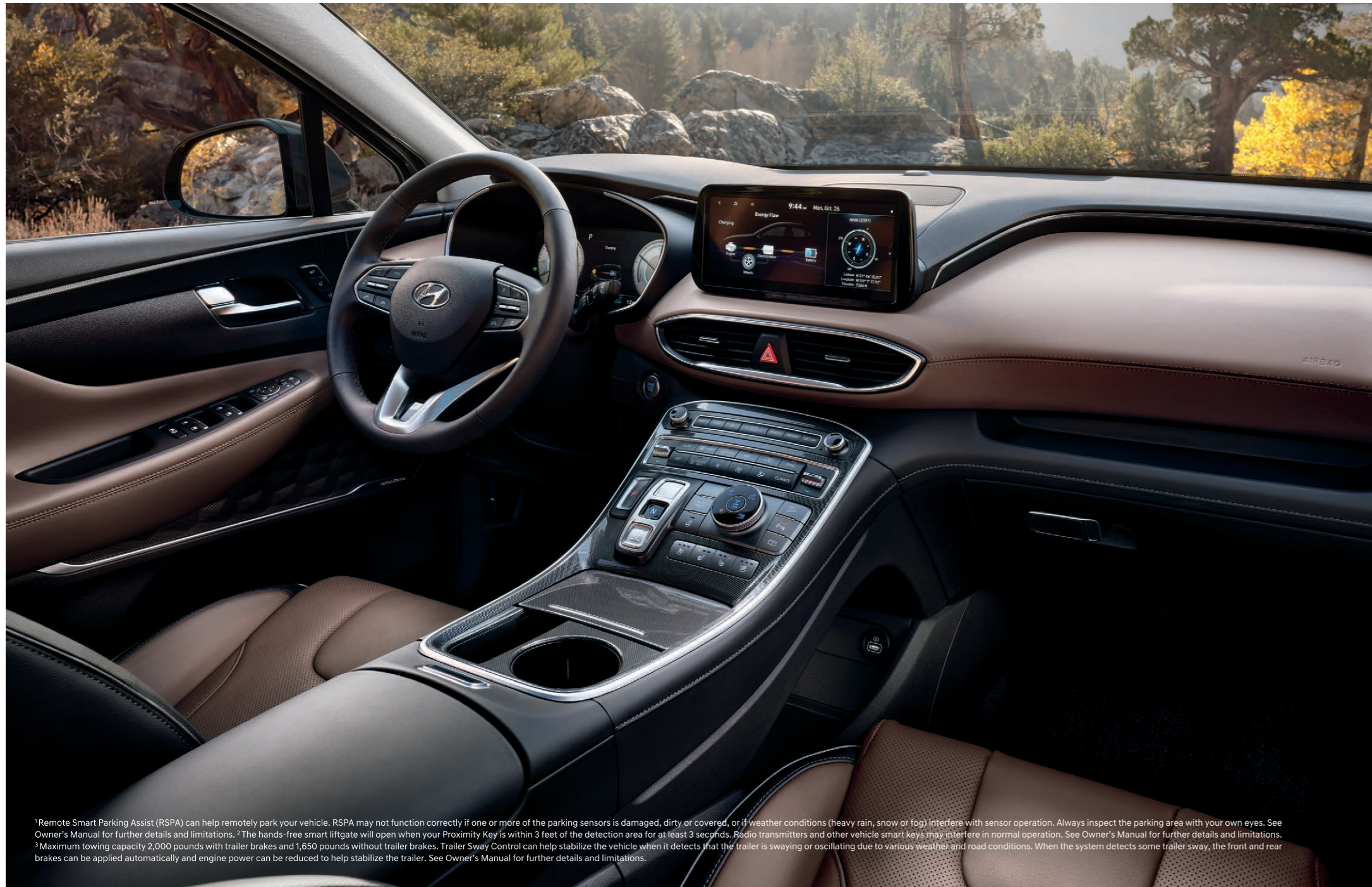
SANTA FE Hybrid Limited in Beige Leather