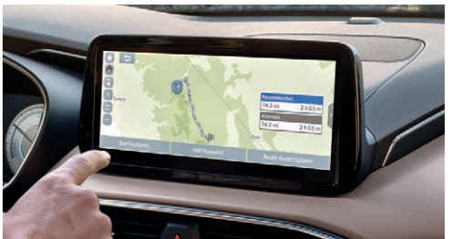
10.25" split-screen navigation display