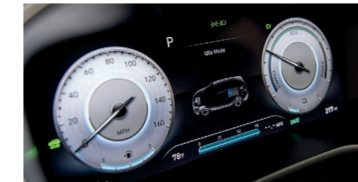
12.3" digital LCD instrument cluster