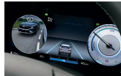
Blind-Spot View Monitor