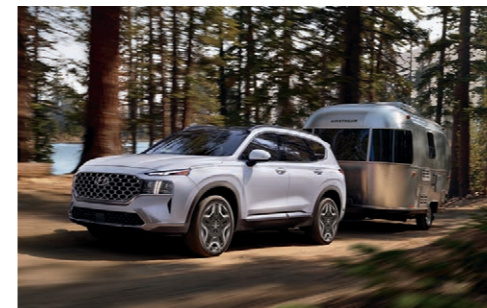
Trailer Sway Control