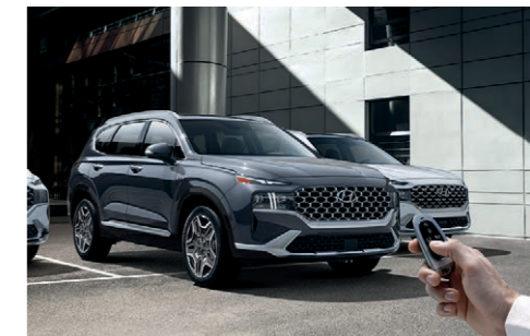
Remote Smart Parking Assist