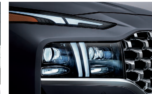
LED headlights and Daytime Running Lights

The 2020 Santa Fe was named "Best 2-Row SUV for the Money" by U.S. News & World Report . 1 How did we make the best even better for 2021? By offering the first-ever Santa Fe Hybrid. Powered by our hyper-efficient hybrid technology, the Santa Fe Hybrid pairs a 178-hp turbocharged Smartstream 1.6L inline-four with a 6-speed automatic and 59-hp electric motor. Its potent electric power comes from a high-voltage lithium-ion battery pack that helps Santa Fe Hybrid Blue deliver a combined 34 MPG 2 and a