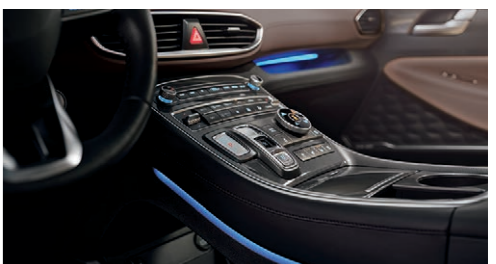
Ambient LED interior lighting