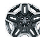
19" Alloy Wheel