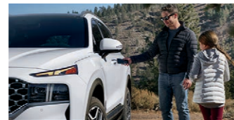
Hyundai Digital Key