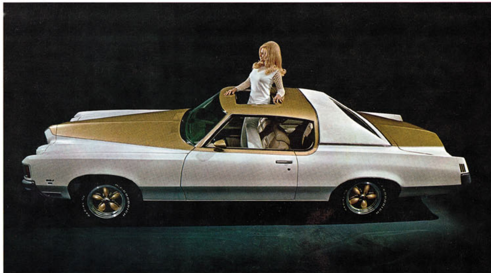
LINDA VAUGHN, "MISS HURST GOLDEN SHIFTER" AND THE NEW SSJ HURST, SHOWN WITH OPTIONAL WHEELS AND TIRES.

AN EXCLUSIVE CUSTOM CONVERSION BY HURST PERFORMANCE RESEARCH CORPORATION