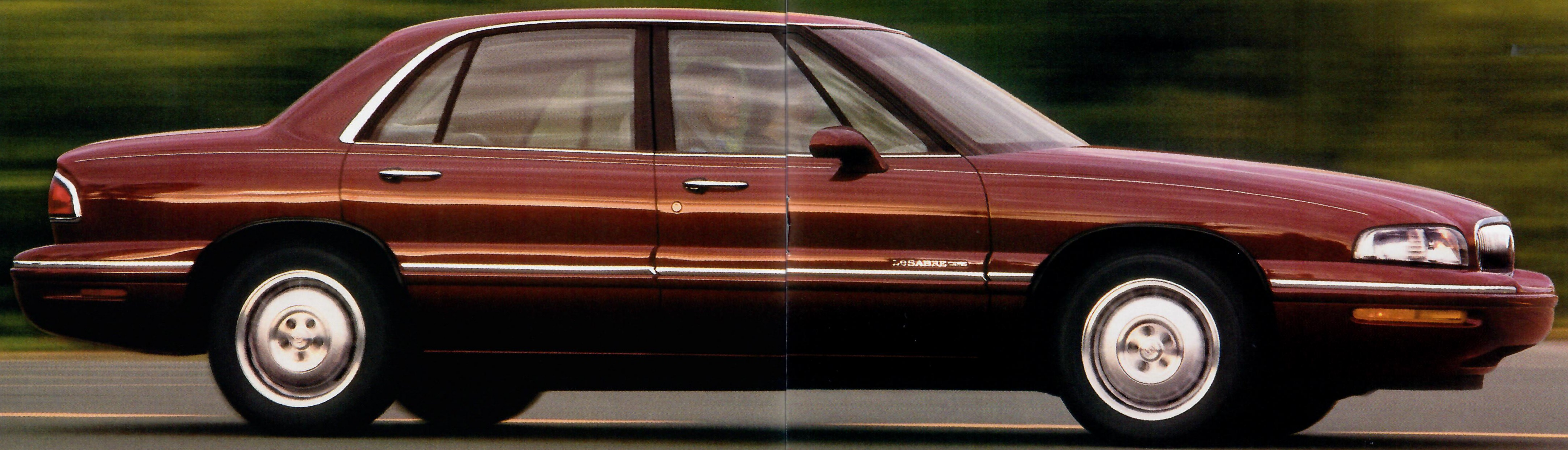
LeSabre Custom Sedan in Platinum Beige Metallic, shown with optional equipment (top left).